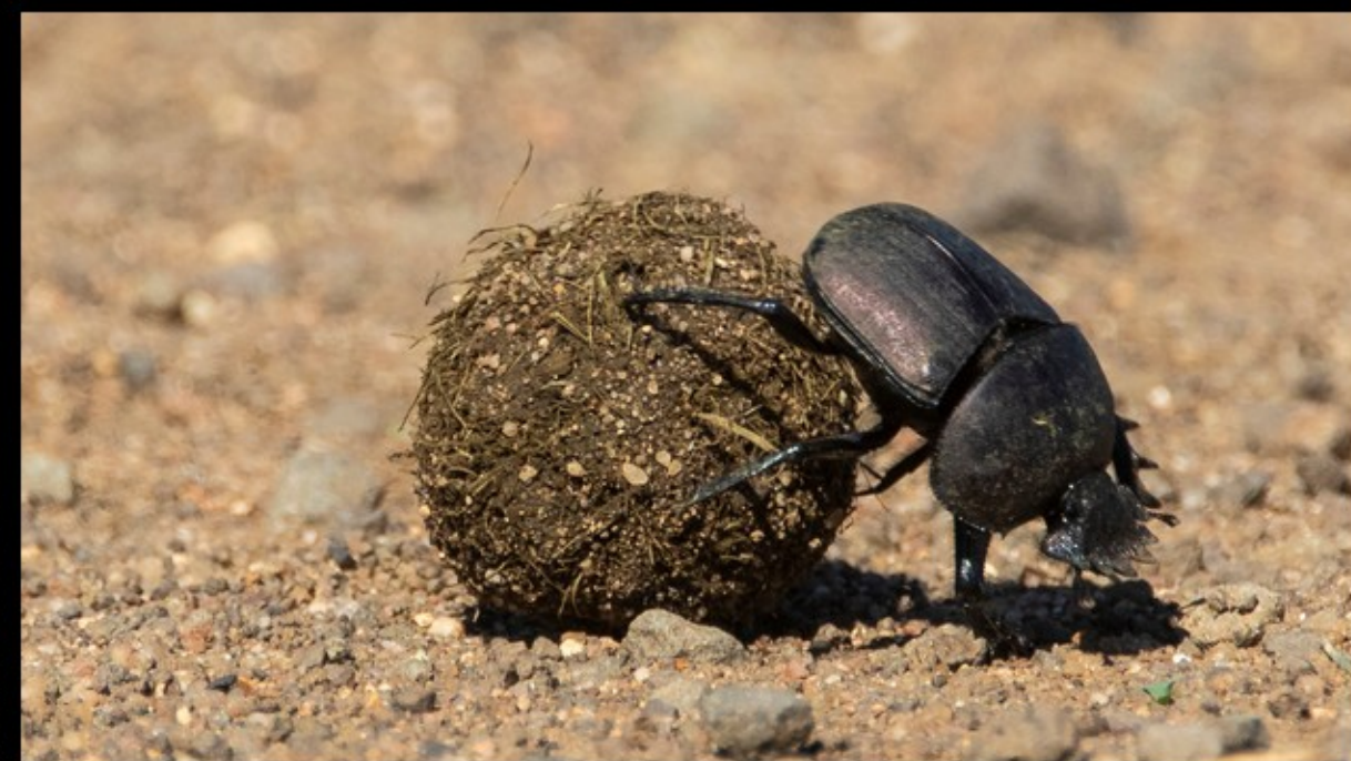
MR-001-Die voedselketting 4-348