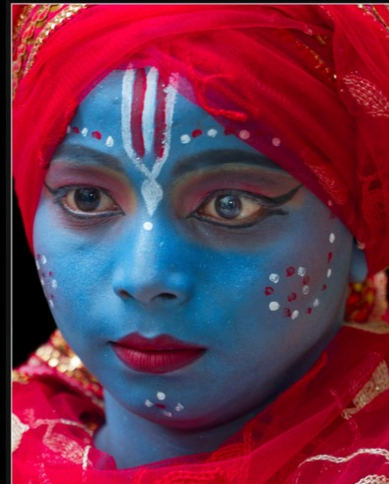
MR-005-Indian boy transformed with blue makeup-16814