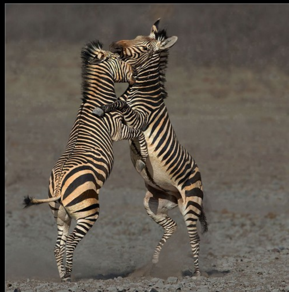
MR-001-05_Hartman zebras at waterhole-734