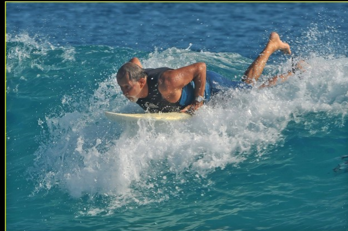
MR-001-Ou surfer 1-629