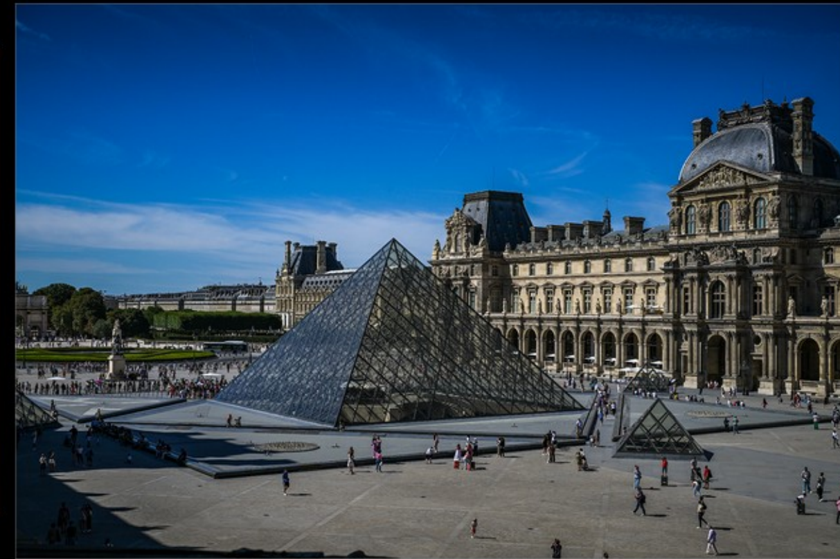
MR-001-The Louvre in a blur 01-7734