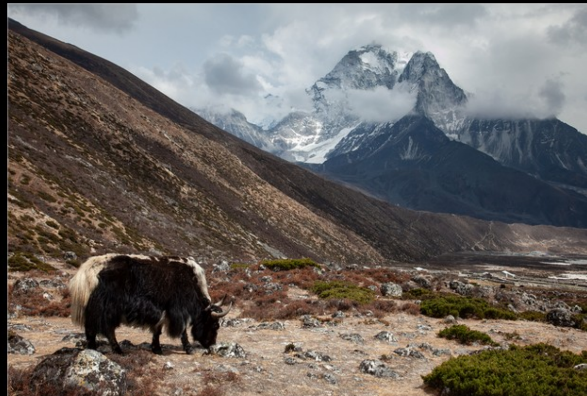
MR-001-Khumbu Valley Vista-5-1113