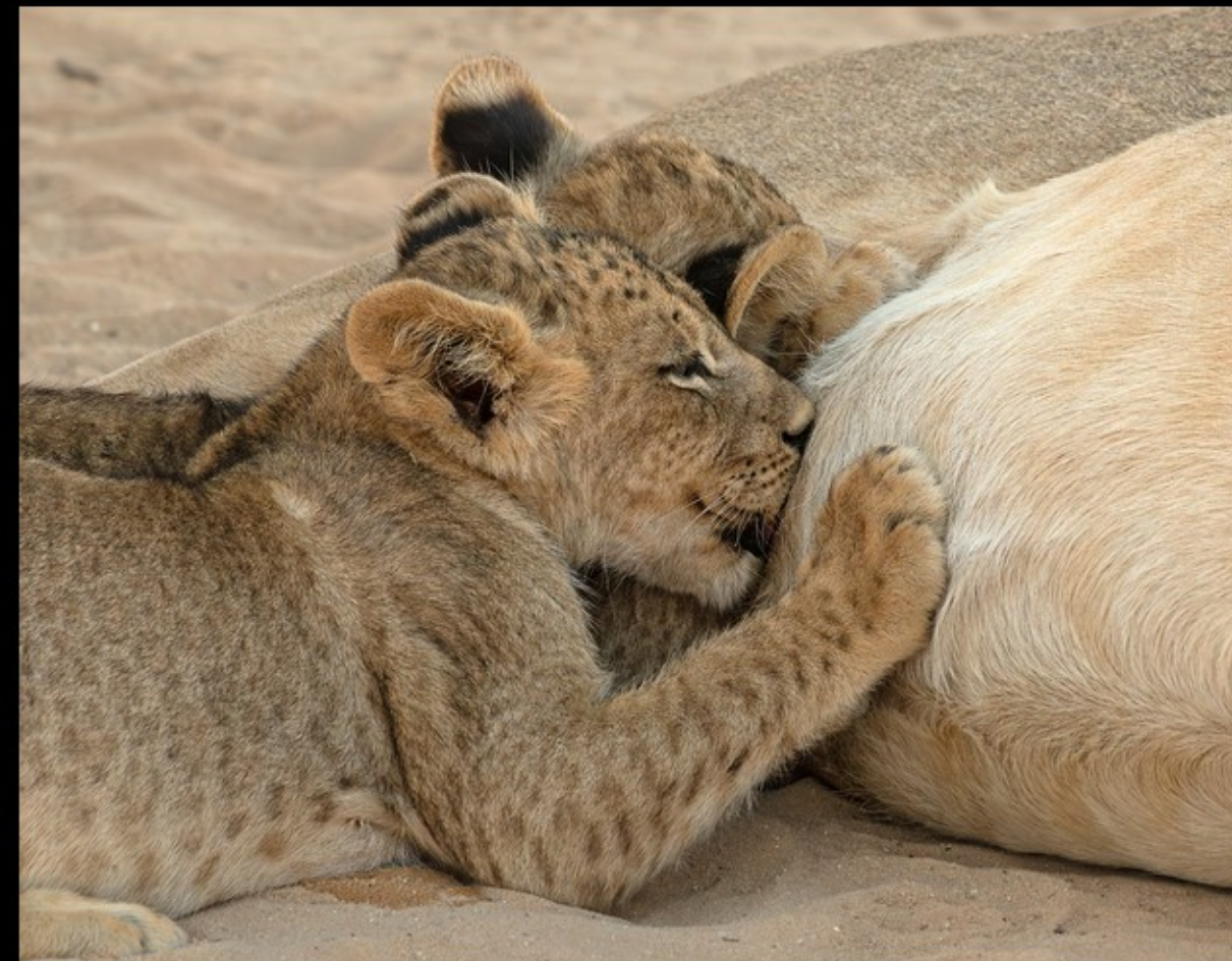
MR-003-\ån lus tot lip aflek lekker-7635