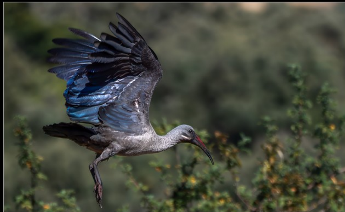
NB-5 star-Hans Bogenhofer-35-G-Mount Sheba Hadede