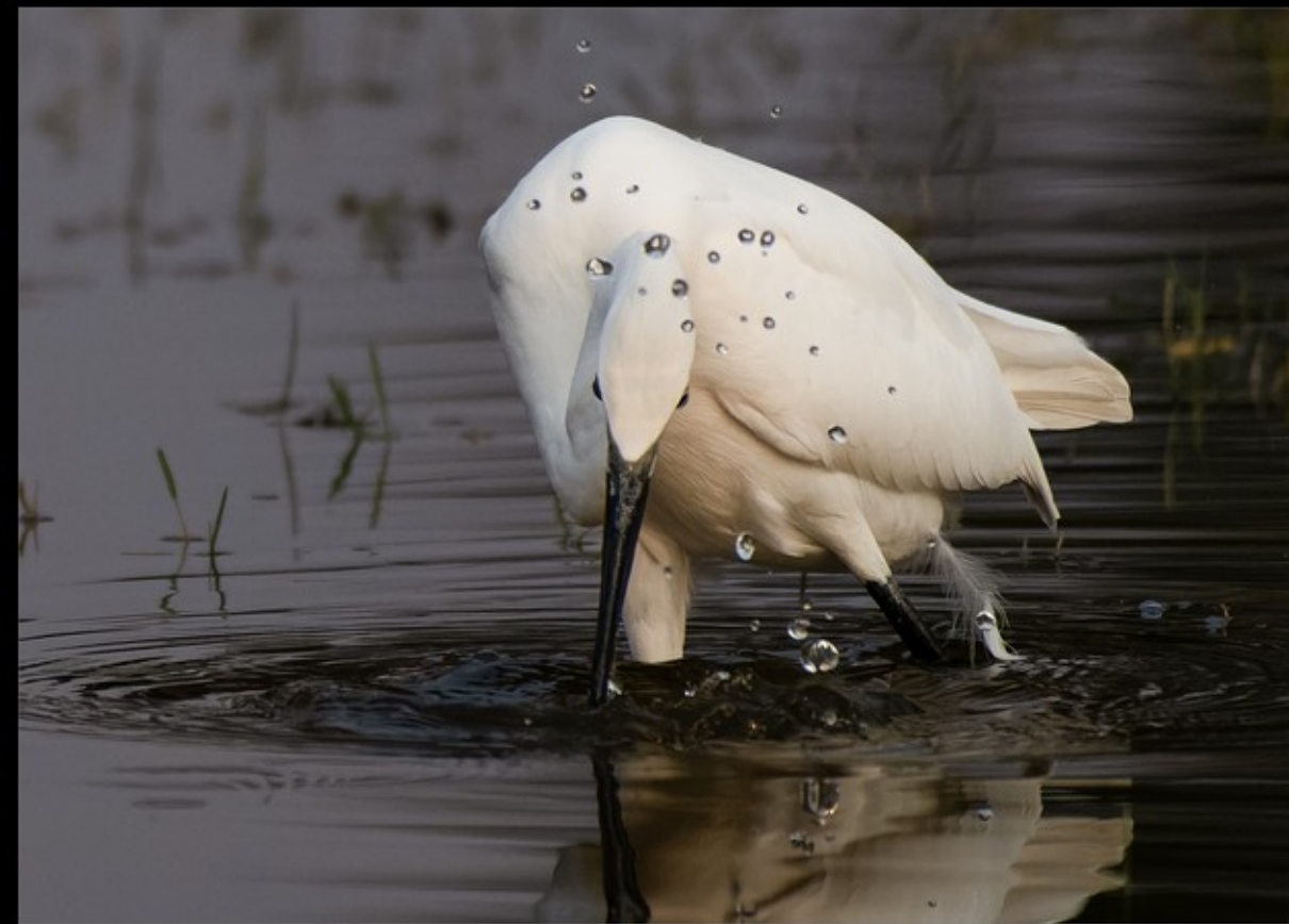
MR-003-Reier hengel in Moremi-14170