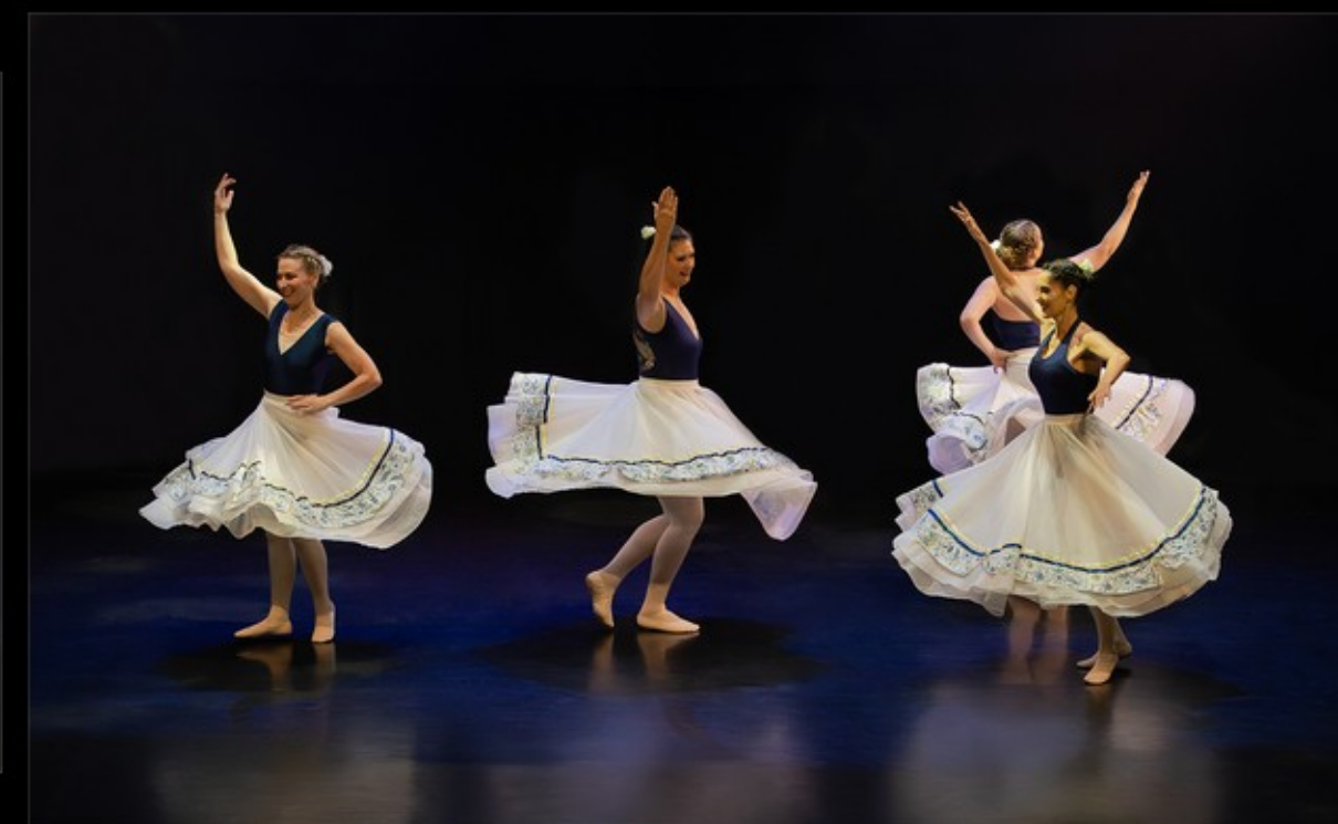
MR-001-Happy dancing team 3-8861