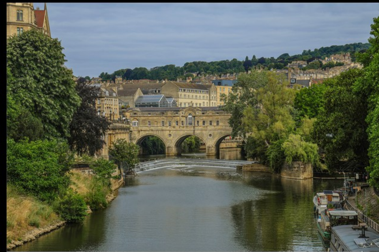
SC-M-Trippie 'Msser-35-G-Mew Of Bath