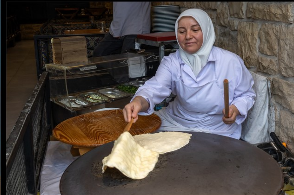
MR-001-Going on to the hot plate-2792