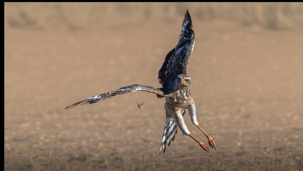
MR-001-The hunt is on 3-537