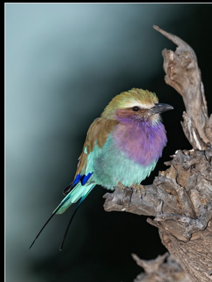
NB-M-Koos Marais-35-G-Roller At Night