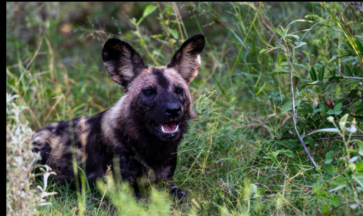
MR-001-Wild dog hunting-12921