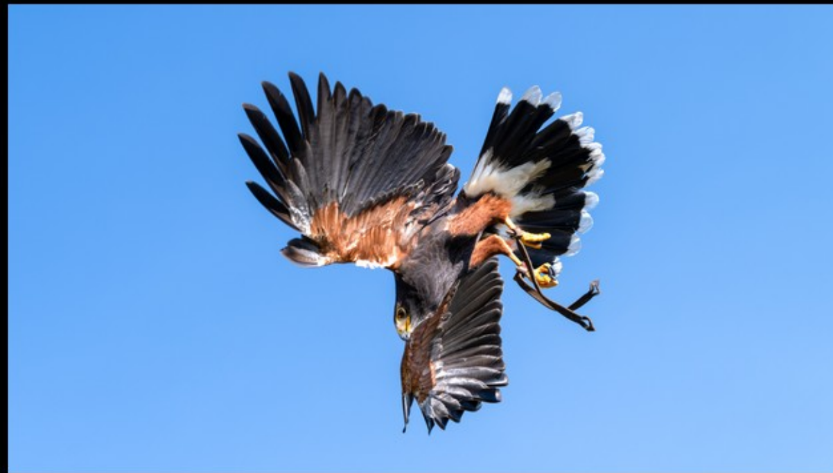
MR-001-Arial anouvers 5-7085