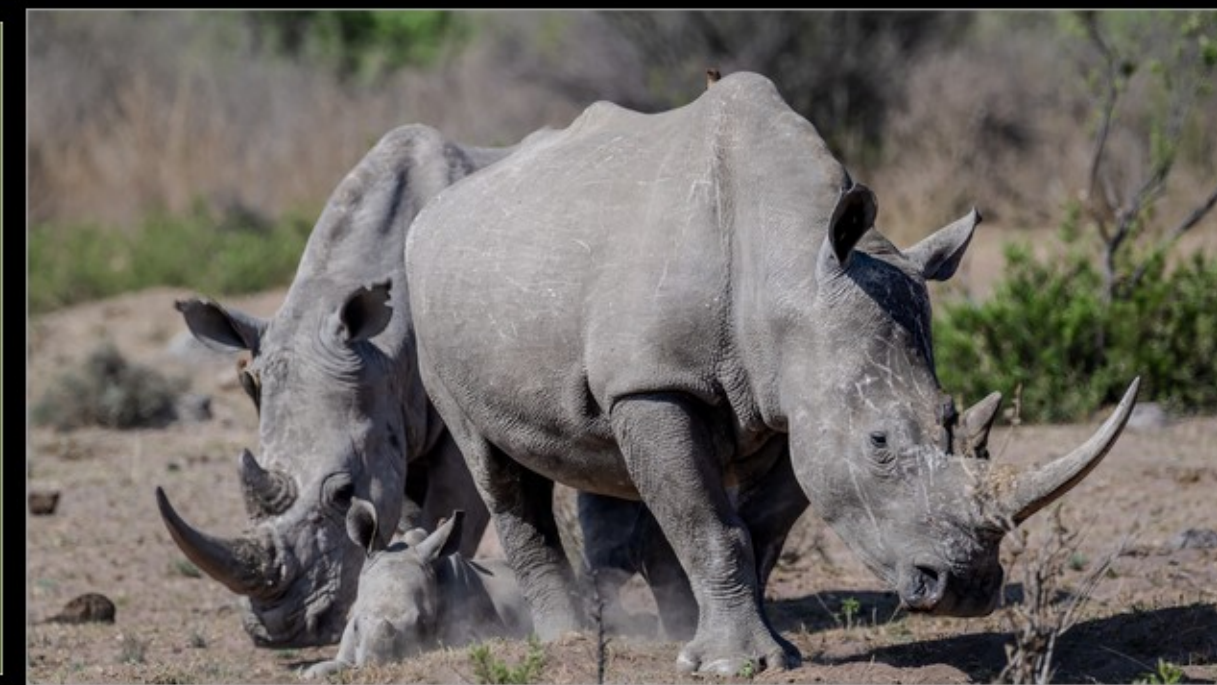
NA-M-Ezabe Bogenhofer-33-G-Rare Family