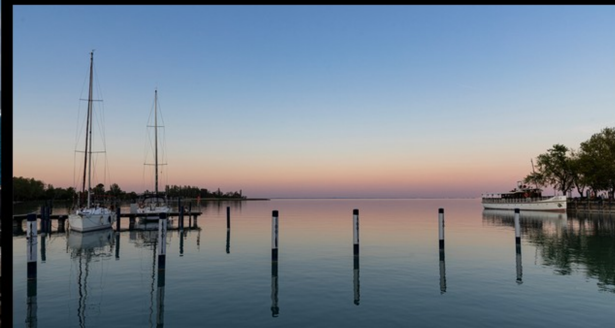
SC-4 star-Amanda Ellis-35-G-Stilte Oor Balaton