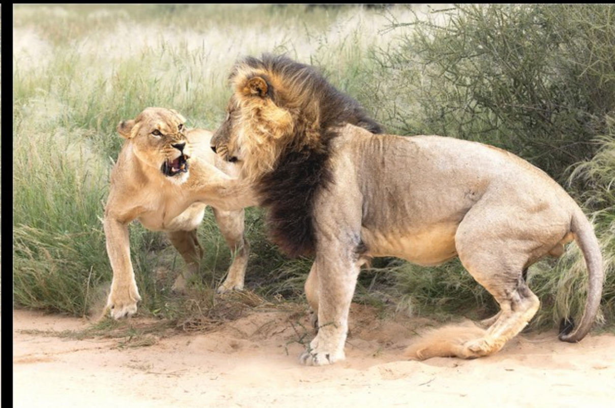
MR-001-Denied with force_series 5-18