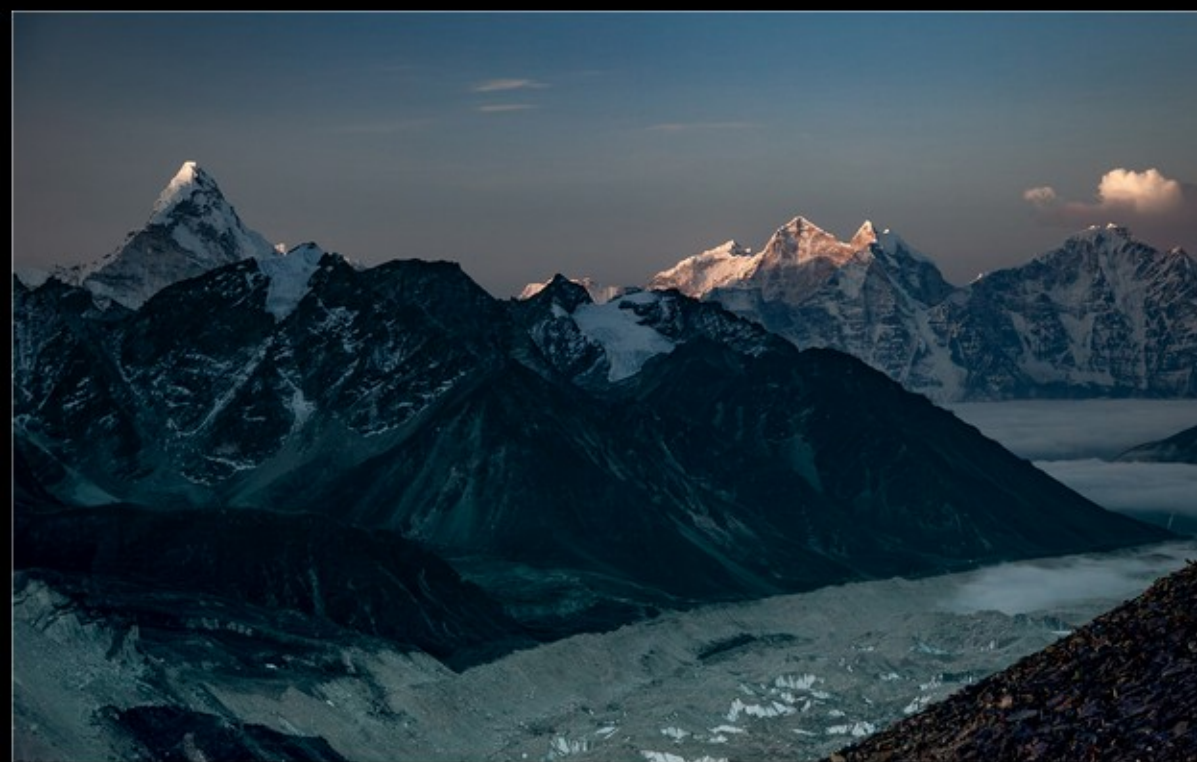
MR-001-Khumbu Valley Vista-3-1113