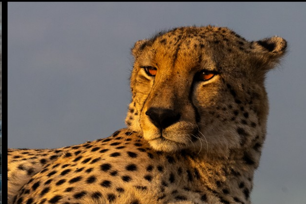
NA-2 star-Maria Geringer-37-G-Burning Eyes At Dusk