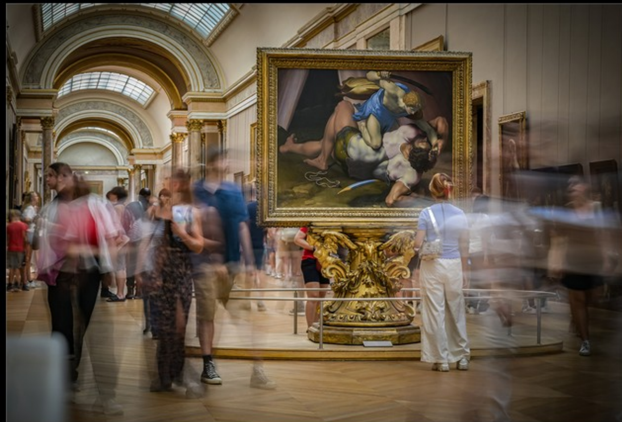
MR-001-The Louvre in a blur 02-7734