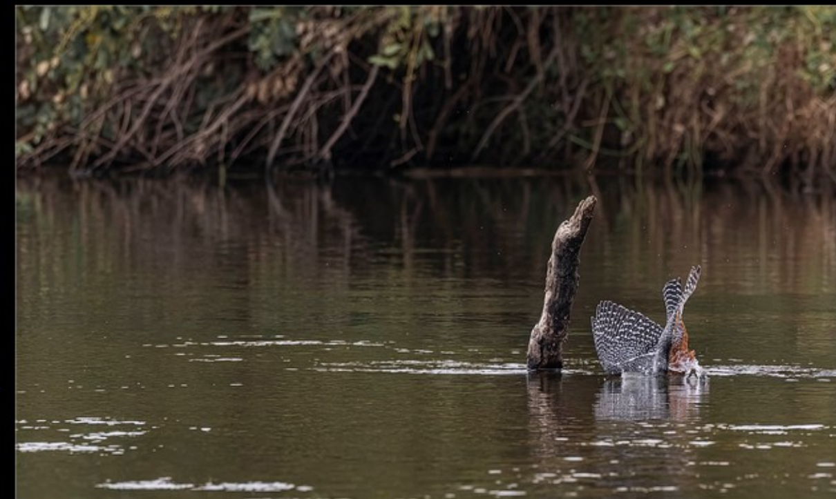
MR-001-2 Amper Take Aways-17046