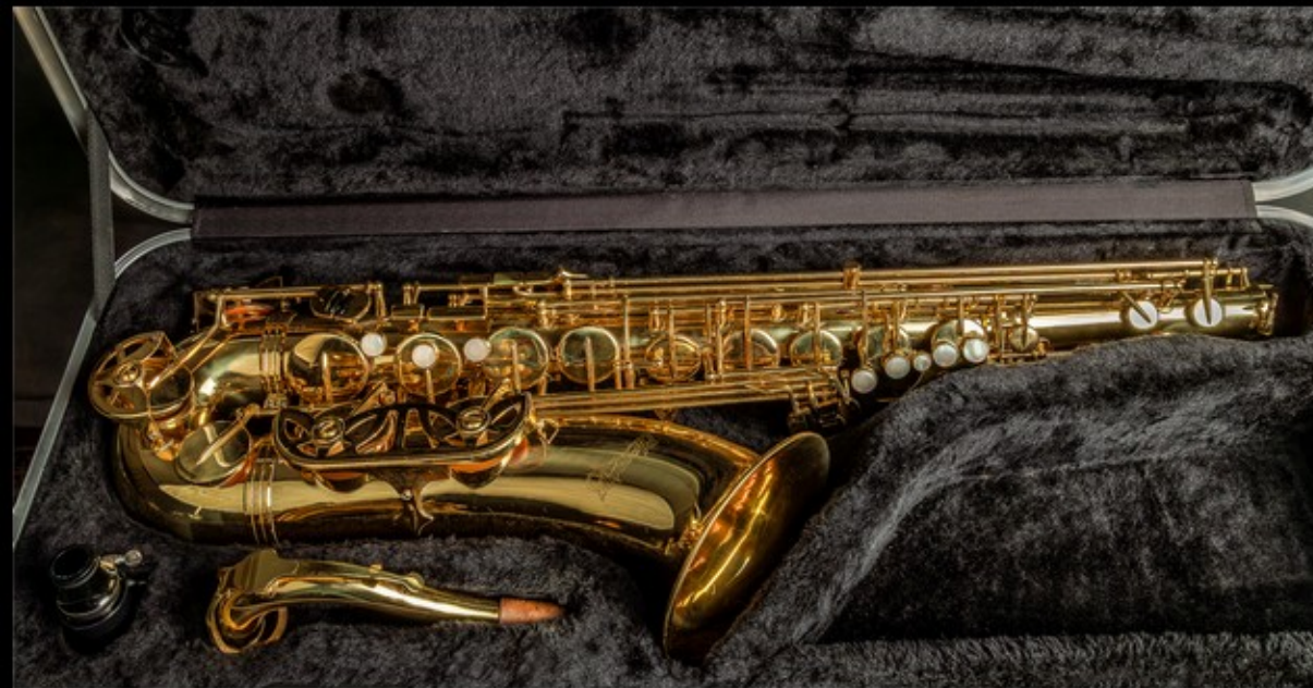
MR-001-The Tenor Saxophone-16528