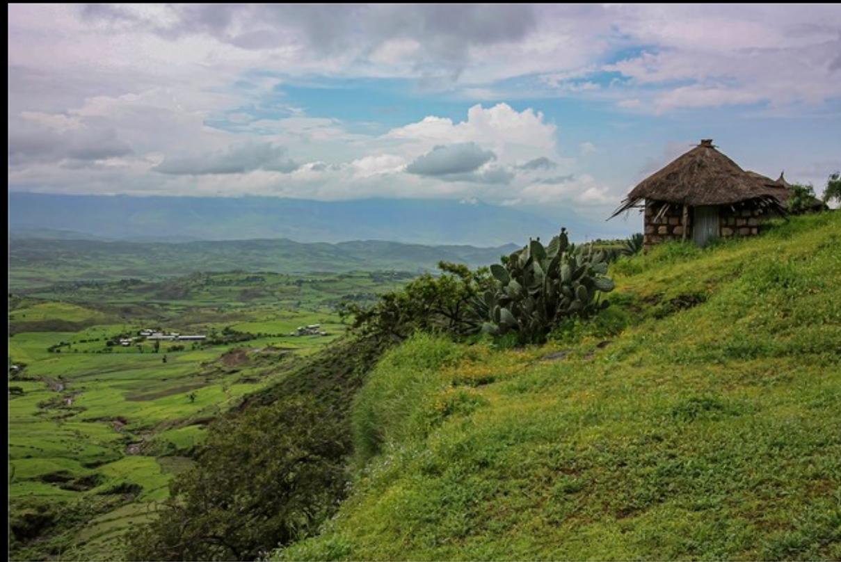
SC-M-Trippie 'Msser-34-G-Huts On Top Of The Hill