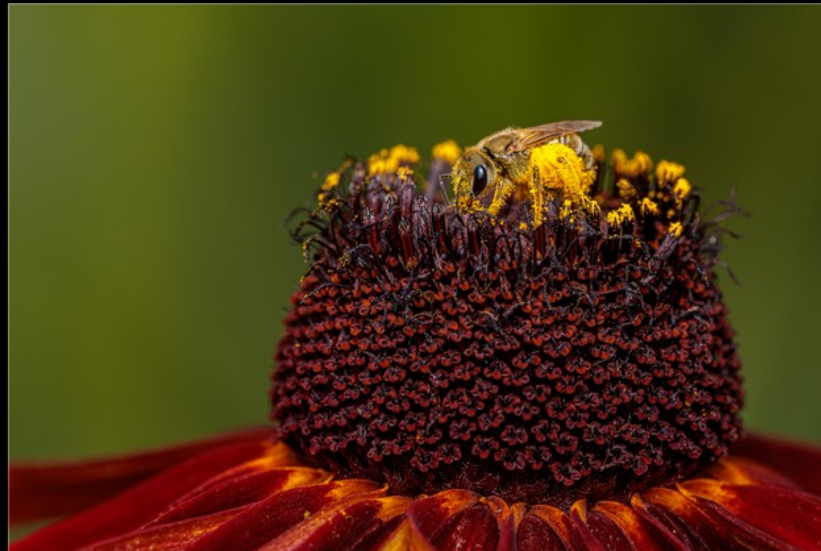
NAM-Riaan Van Den Berg-40-COM; Ctg Wfn-The Smallest Little Bee