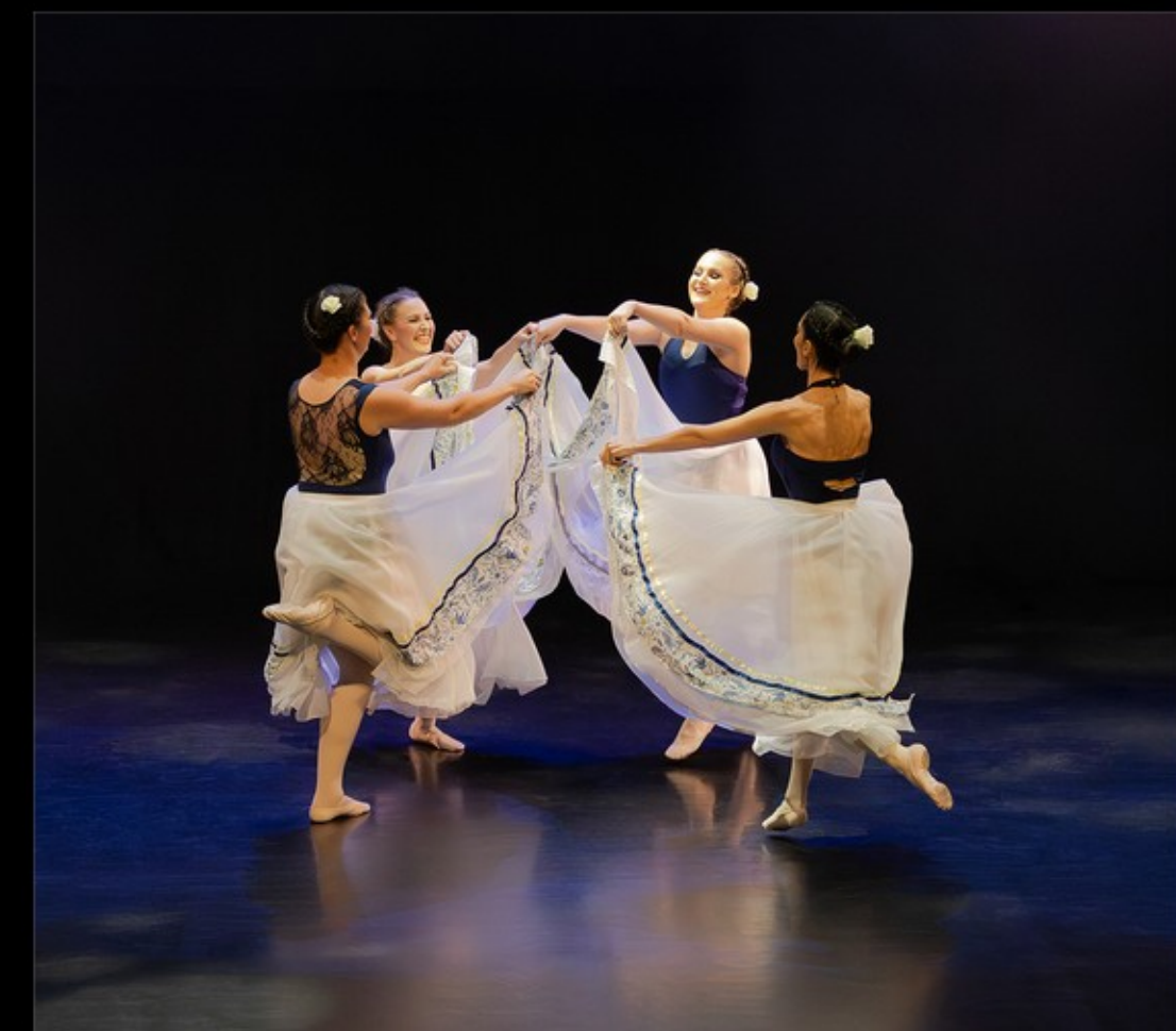
MR-001-Happy dancing team 4-8861