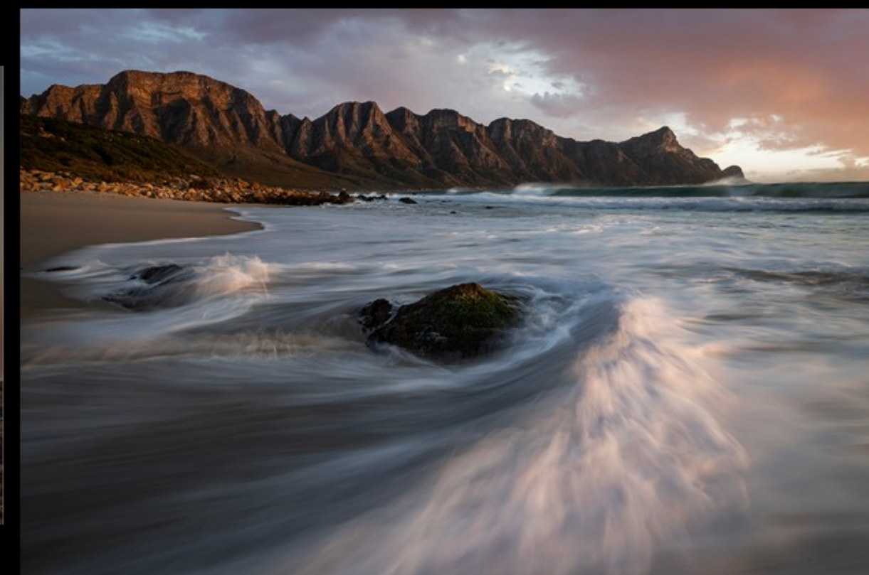
SC-M-Rina Hattingh-39-COM-Where Mountains Meet The Sea