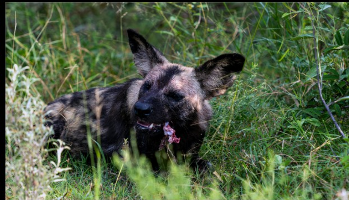
MR-002-Wild dog hunting-12921