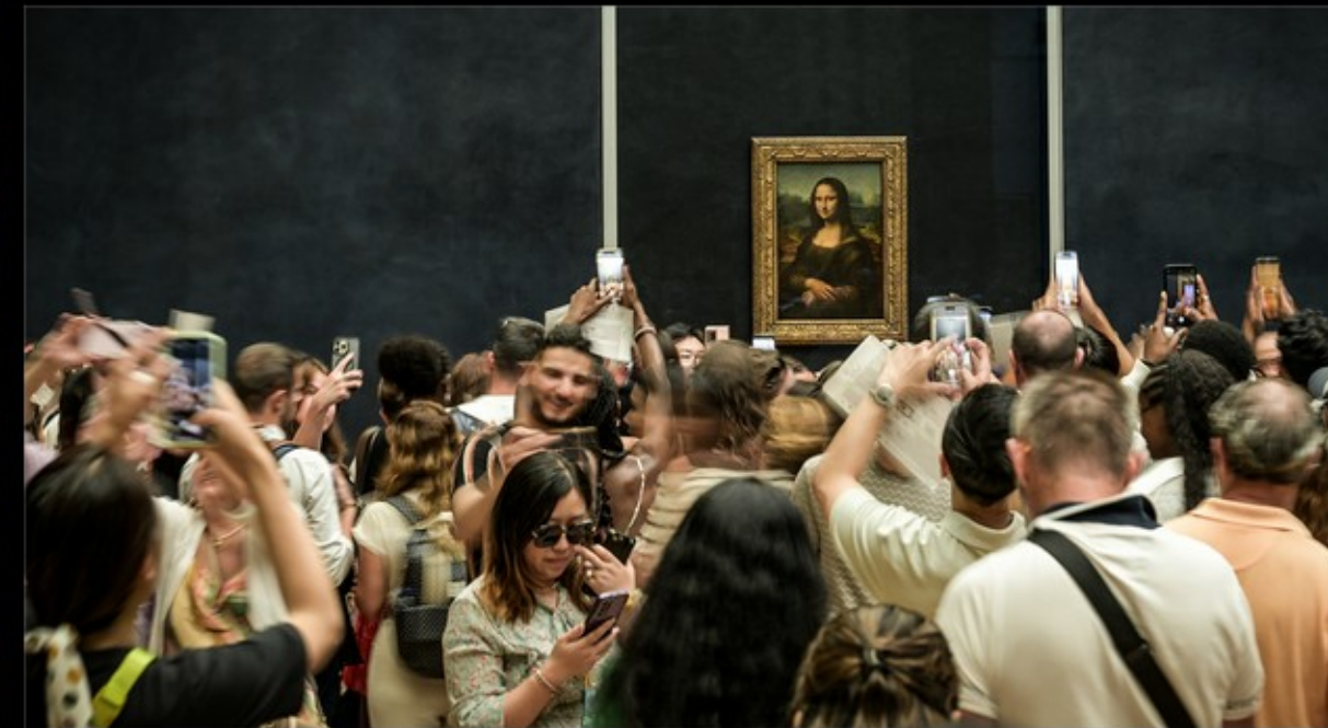
MR-001-The Louvre in a blur 04-7734