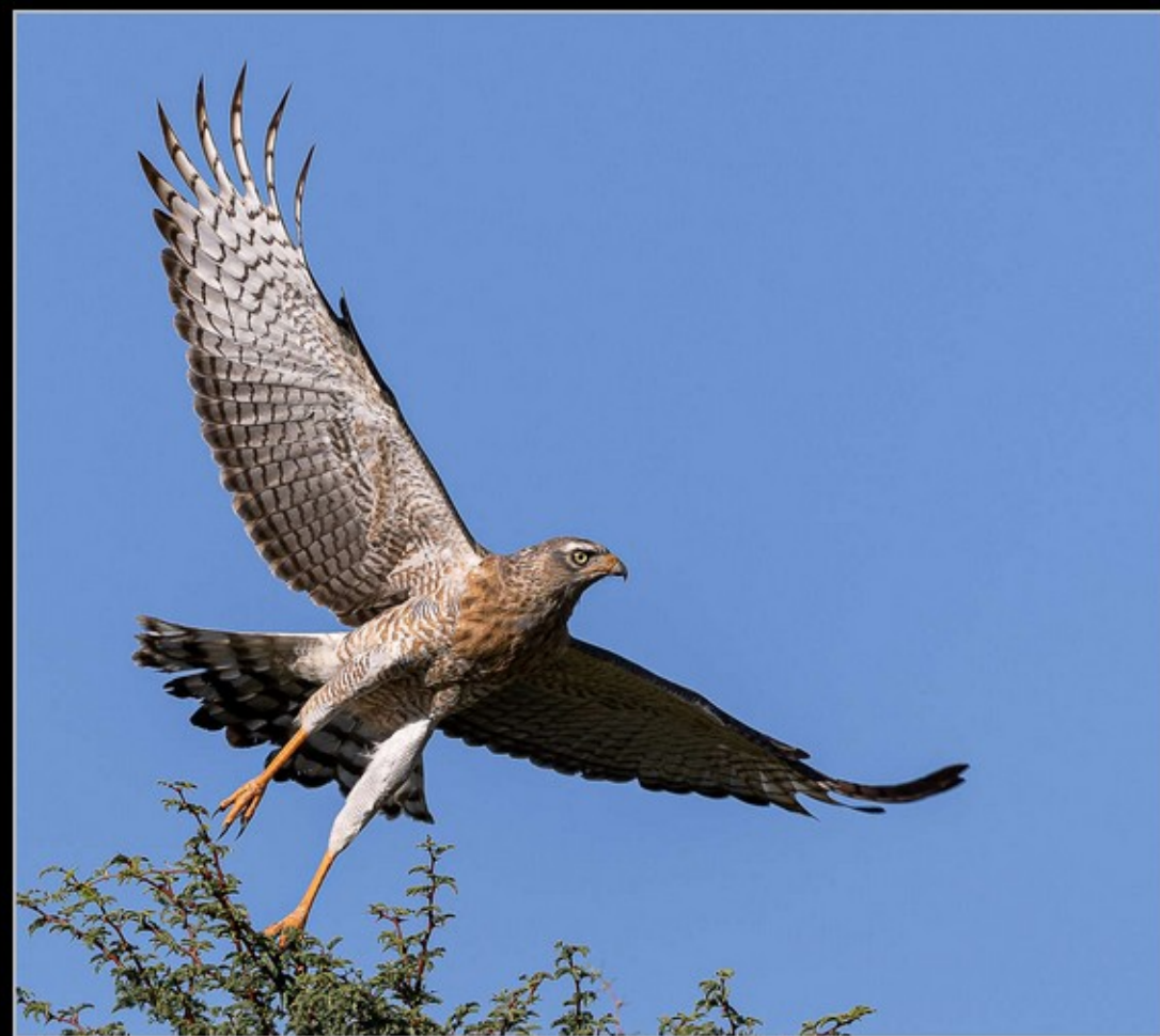
NB-5 star-Keith Boehme-37-G-Wings Spread