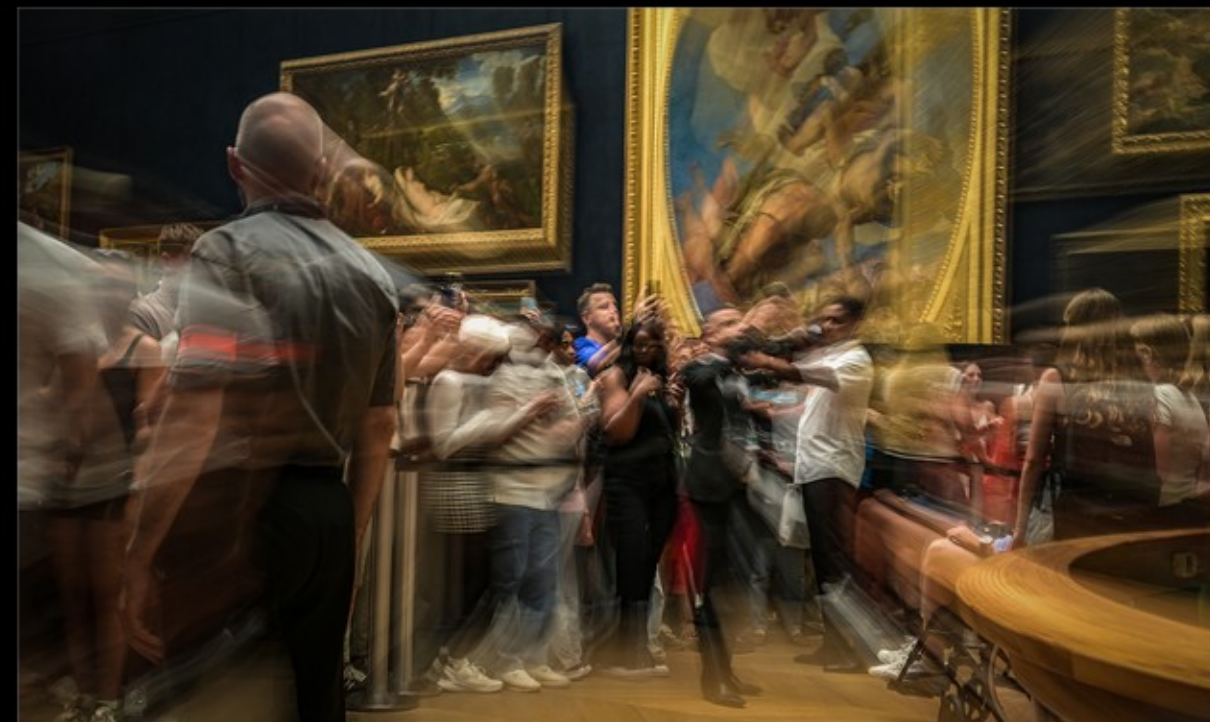
MR-001-The Louvre in a blur 03-7734