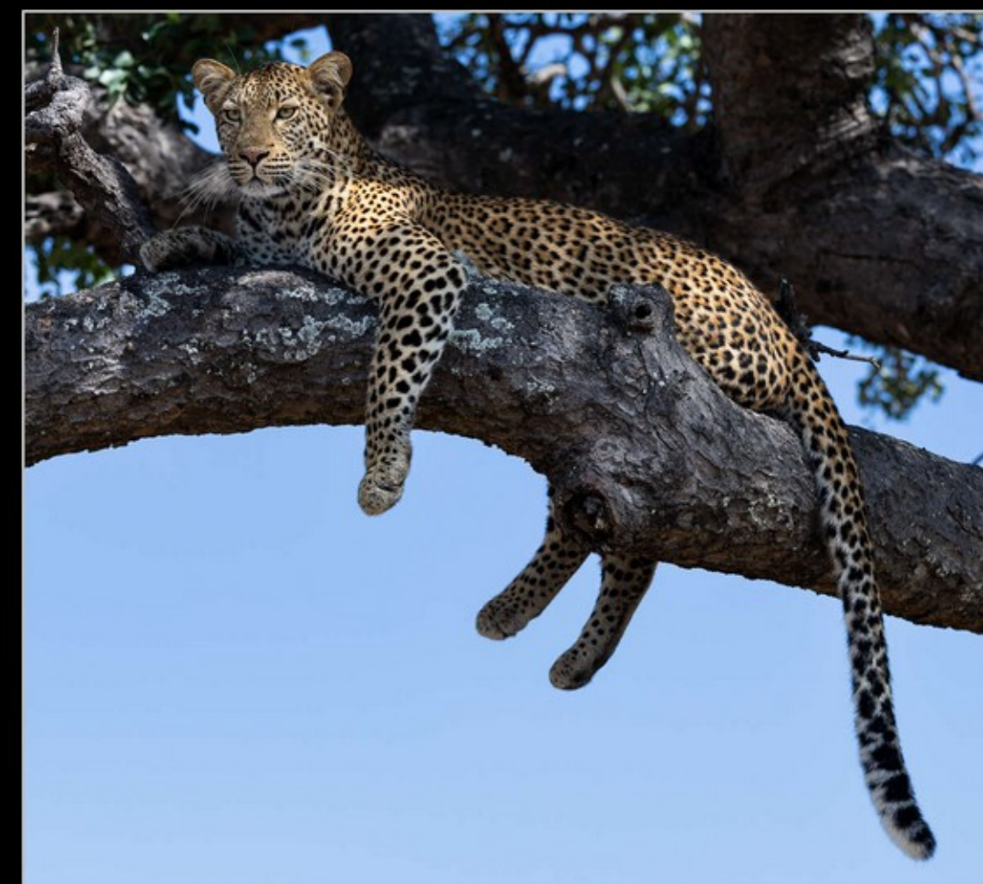
MR-001-Leopard On The Move 1-15194