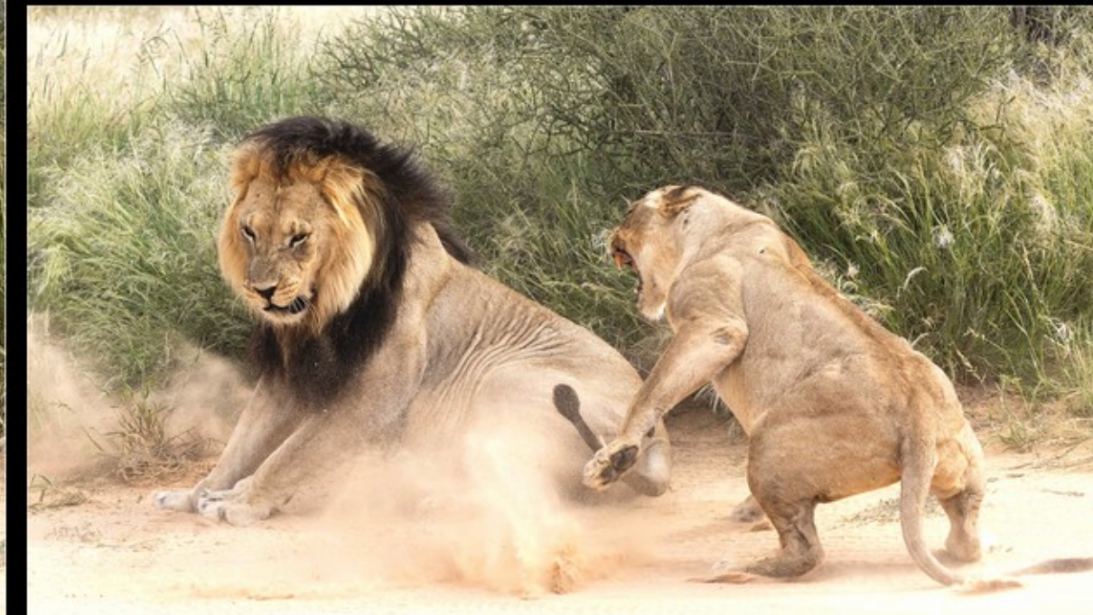
MR-001-Denied with force_series 3-18