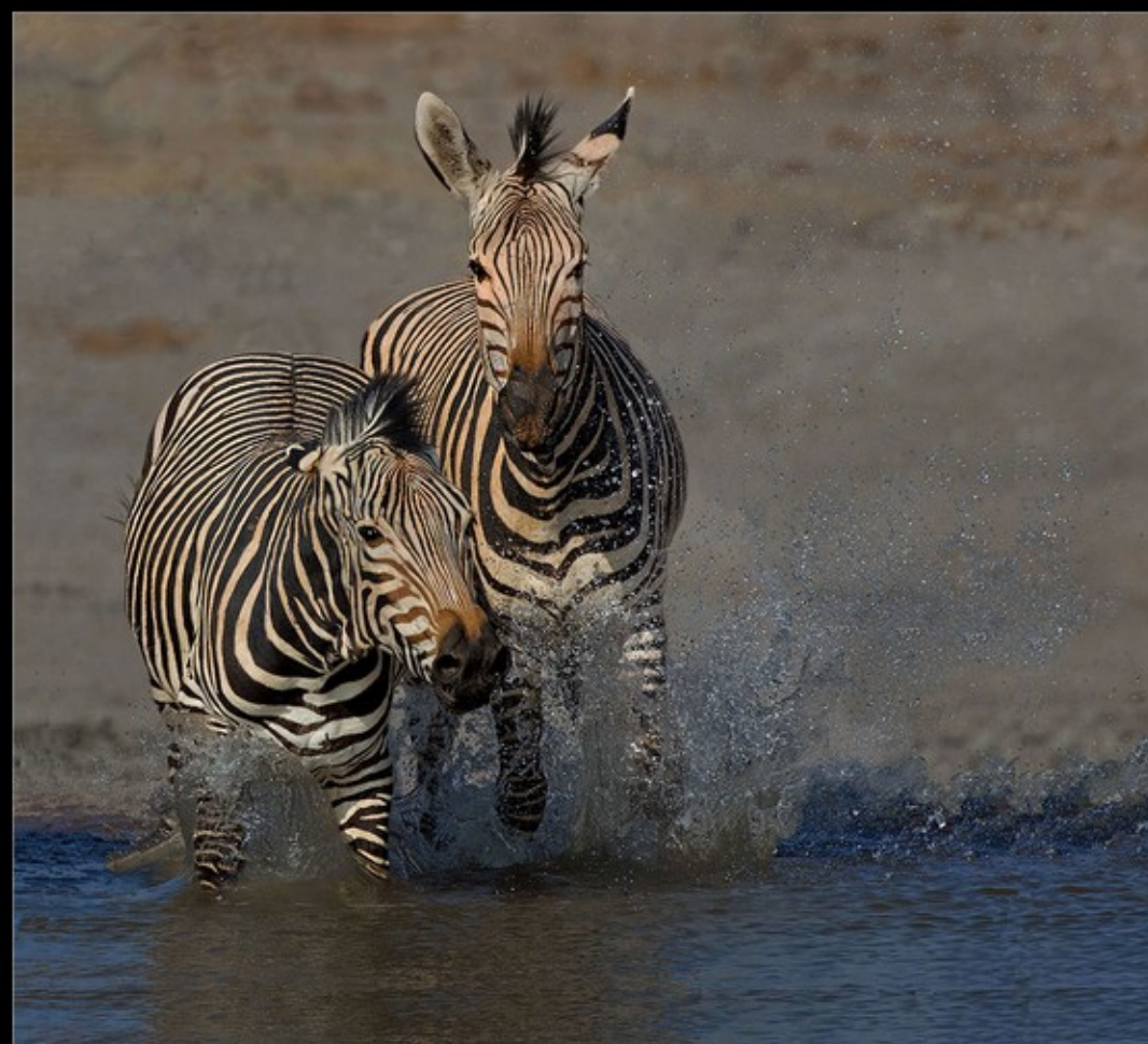
MR-001-02_Hartman zebras at waterhole-734