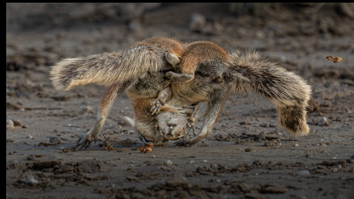
NAM-Johan Greyling-39-COM-Ground Squirrel Fight Over Food