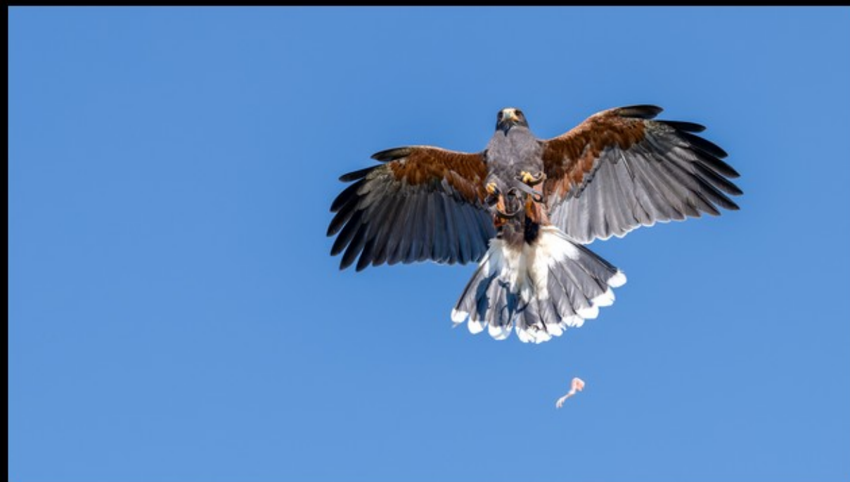
MR-001-Arial manouvers 2-7085