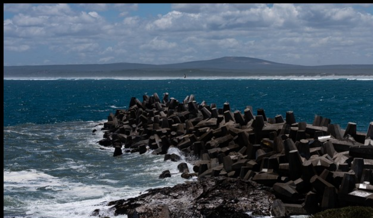
SC-3 star-Marlize De Villiers-32-G-Yzer Soepe