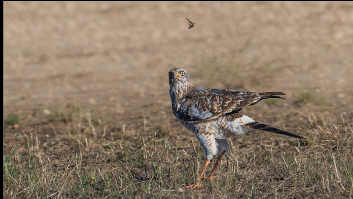
MR-001-The hunt is on-537