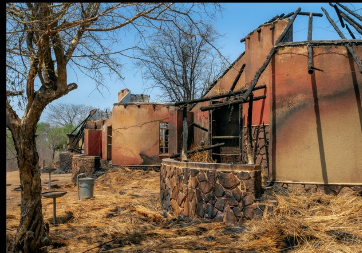
PJ-5 star-Pieter Jordaan-35-G-Die Muur Was Te Warm