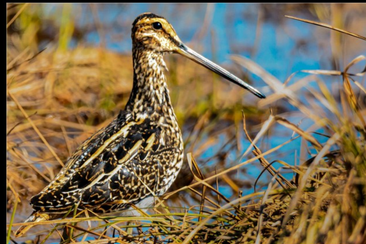
NB-4 star-Mechiel Brandt-28-S-Afrikaanse Snip