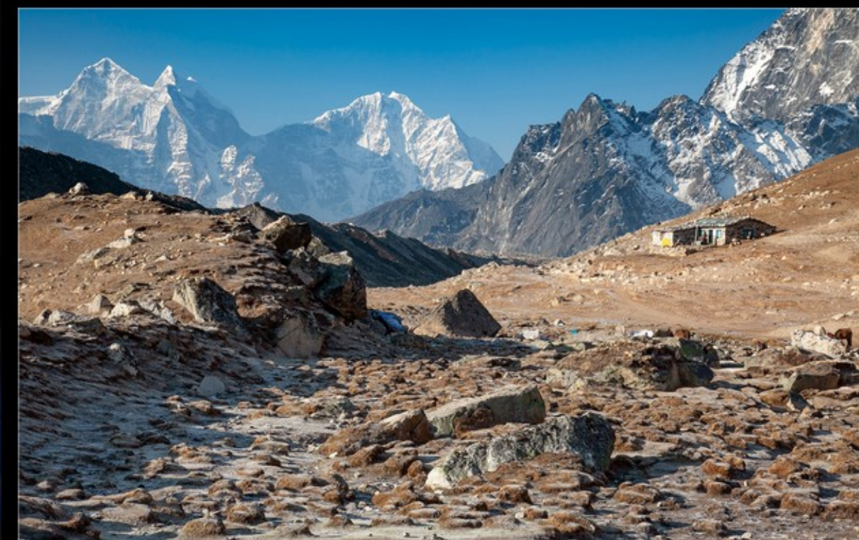
MR-001-Khumbu Valley Vista-1-1113