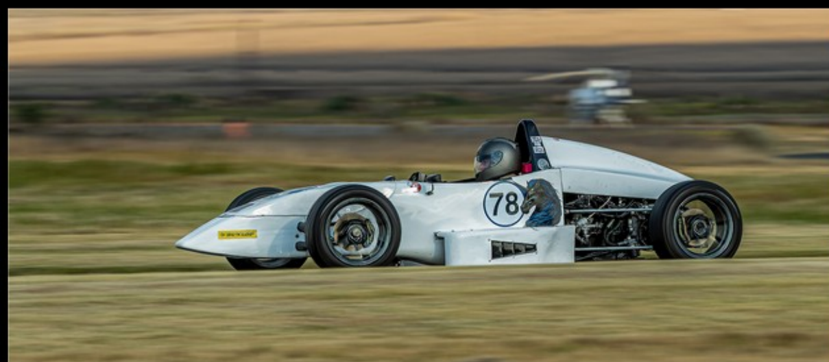
SP-M-Dries Beetge-38-G-Msa 4 78 125 Sec