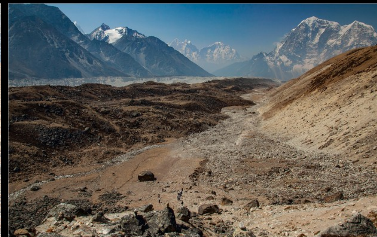
MR-001-Khumbu Valley Vista-2-1113