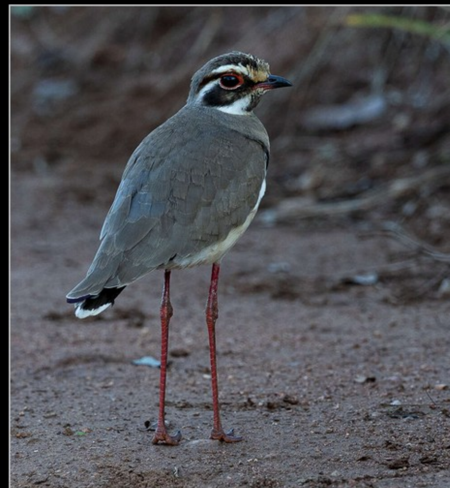
NB-5 star-Keith Boehme-34-G-Bronze Winged Courser