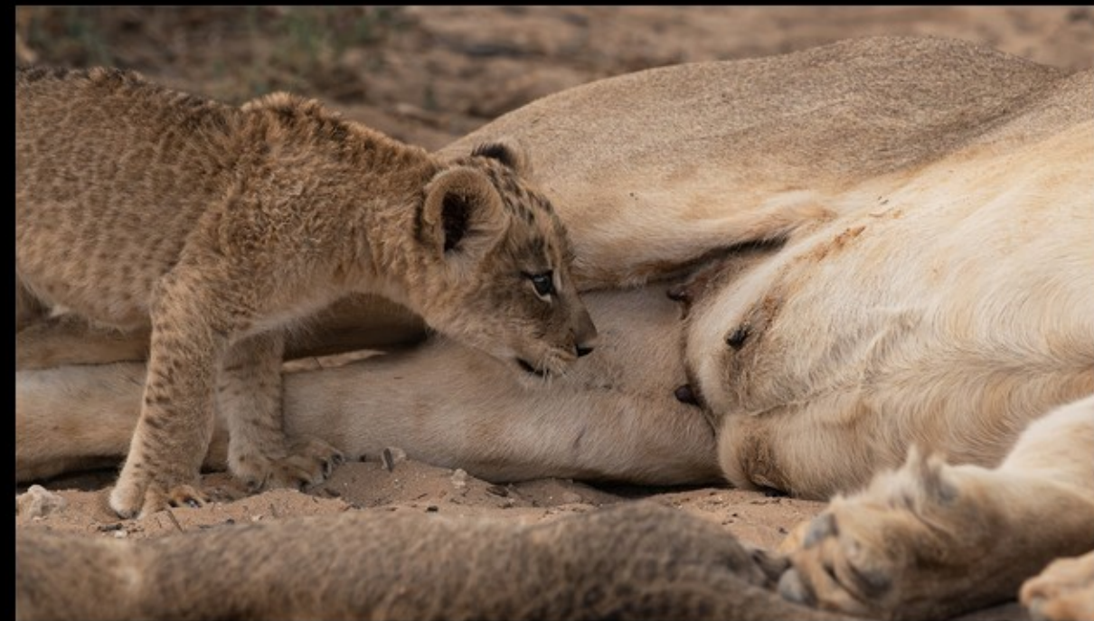
MR-002-van lus tot lip aflek lekker-7635