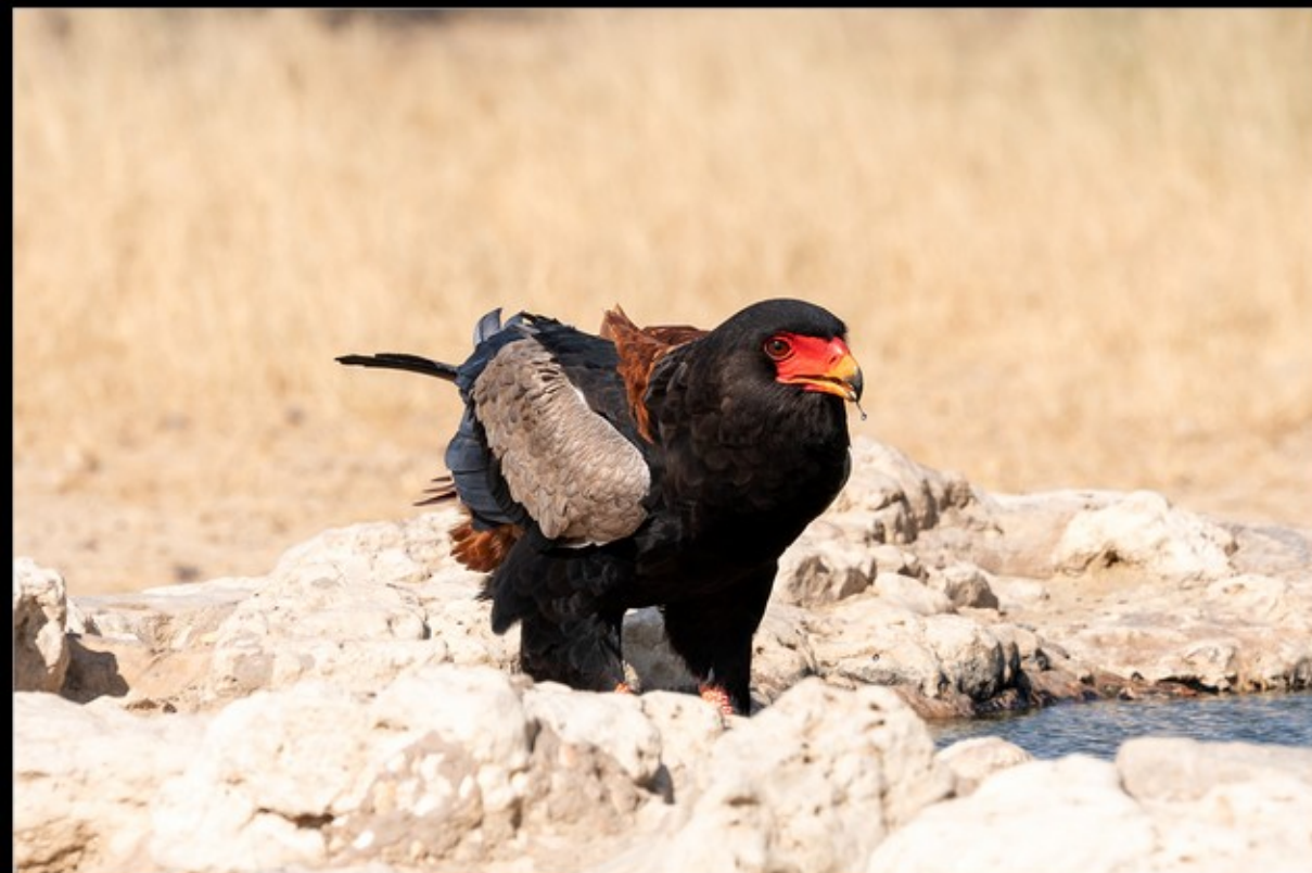
MR-001-Berghaan drink water-17924