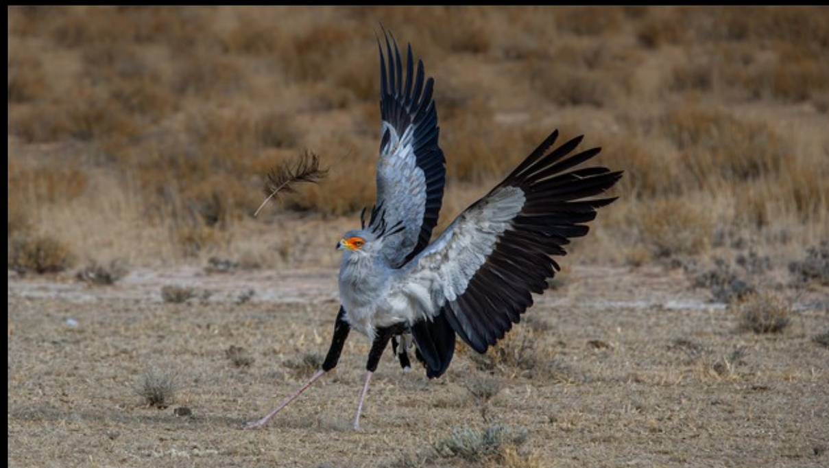
MR-001-Playing With A Feather 1-1097