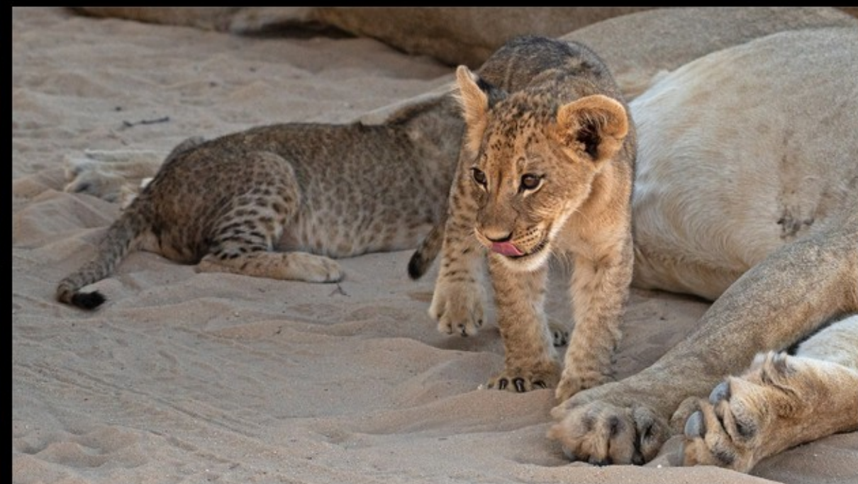
MR-005-\ån lus tot lip aflek lekker-7635