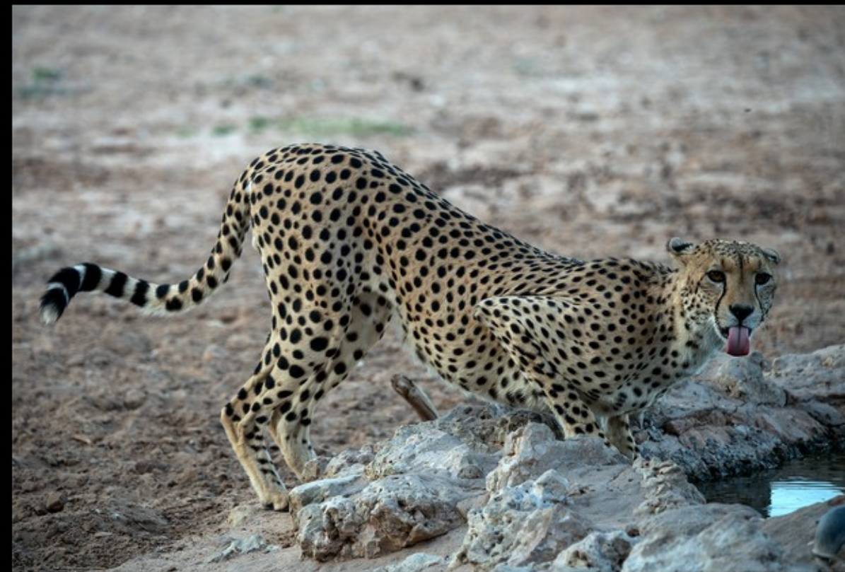
NA-2 star-Helena Oosthuizen-36-G-Jagluiperd Drink Water