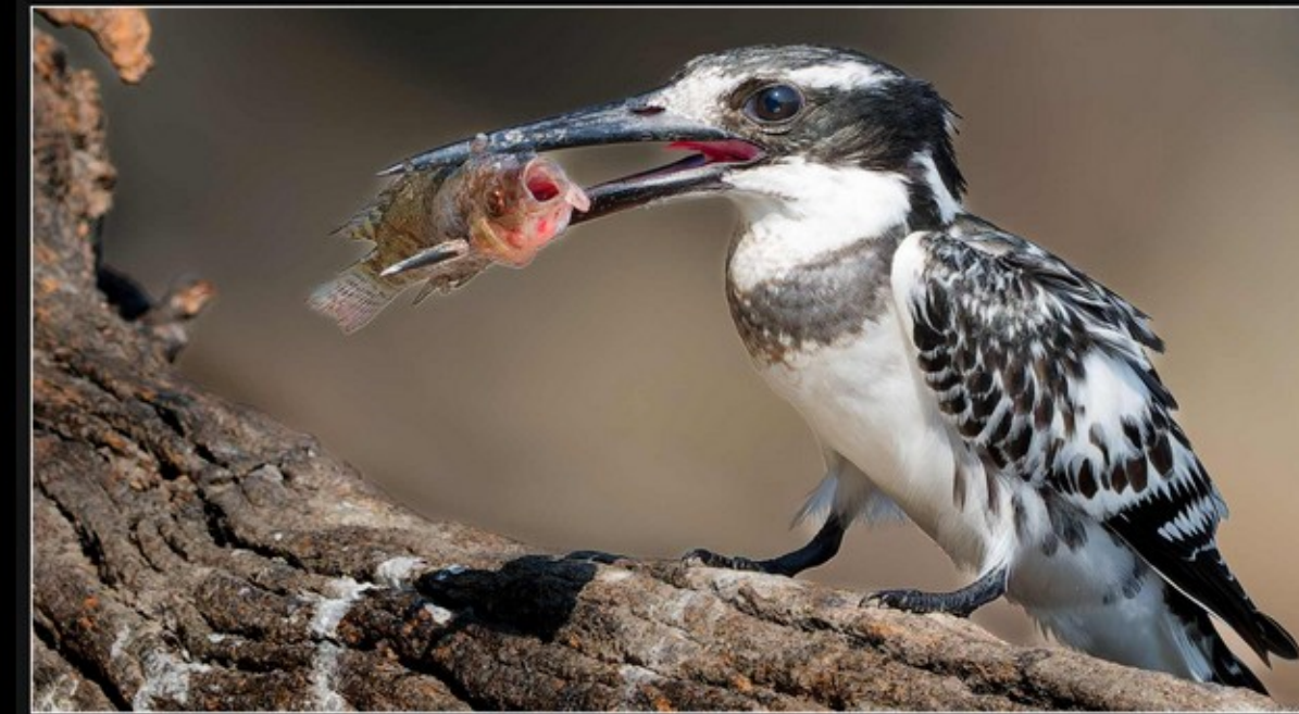
NB-1 star-Karel De Bont-35-G-Battered Fish