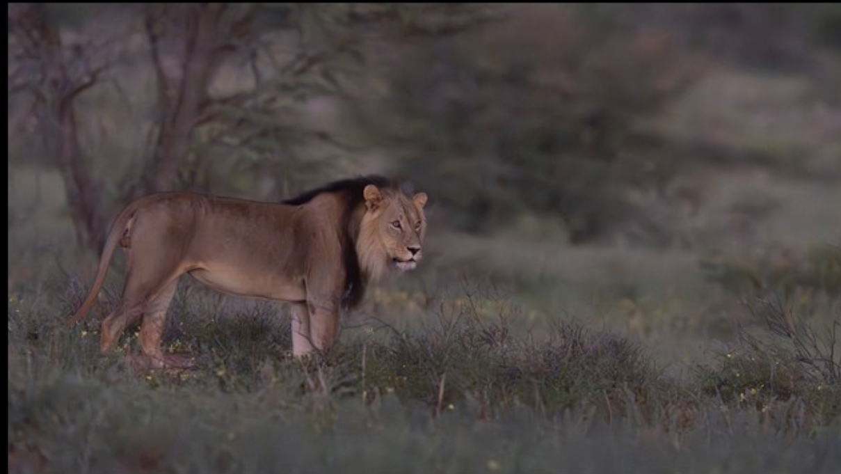
NA-1 star-Judy De Bont-36-G-Hungry