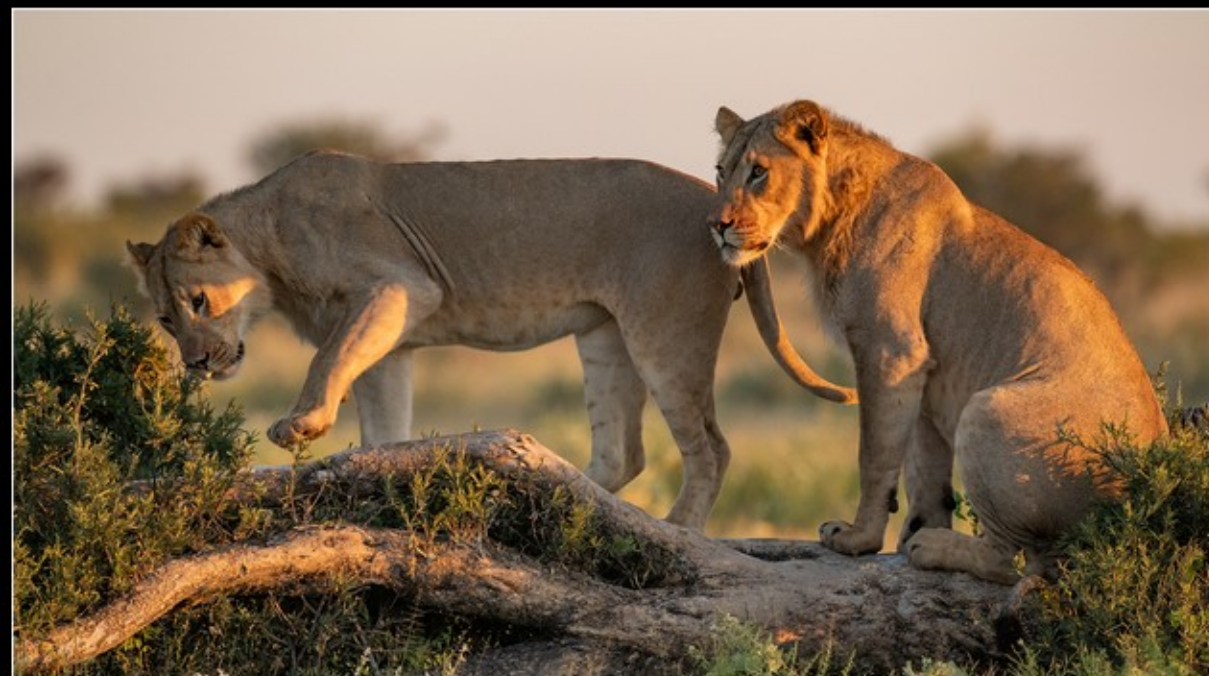
MR-001-Curious lions 4-202