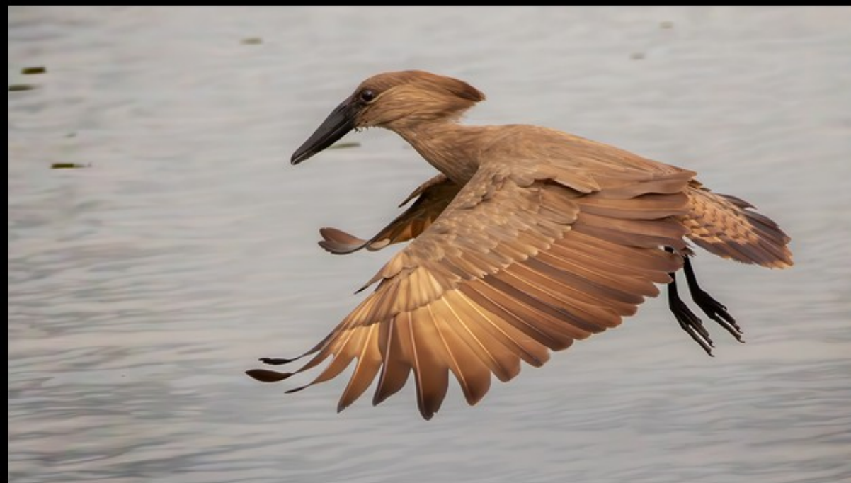
NB-M-Neels Jackson-36-G-Hamerkop Oor Die Water