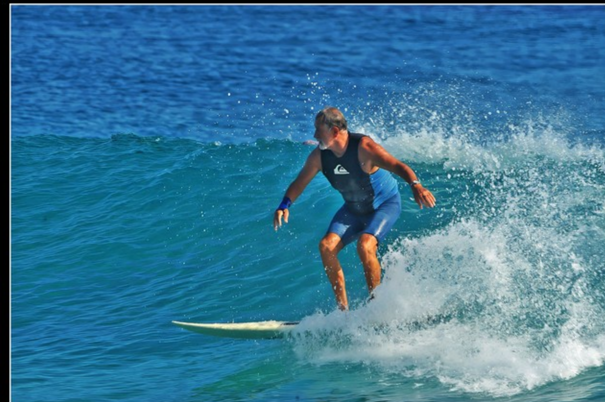
MR-001-Ou surfer 5-629