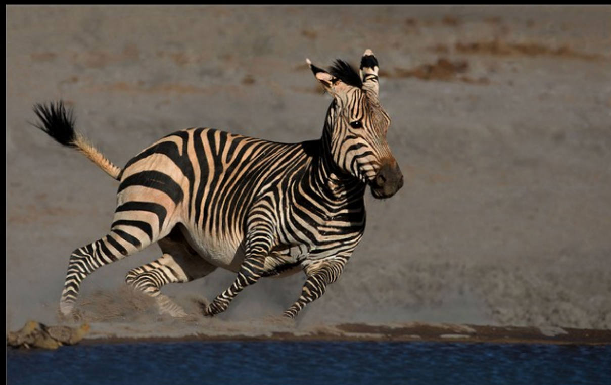
MR-001-01_Hartman zebras at waterhole-734