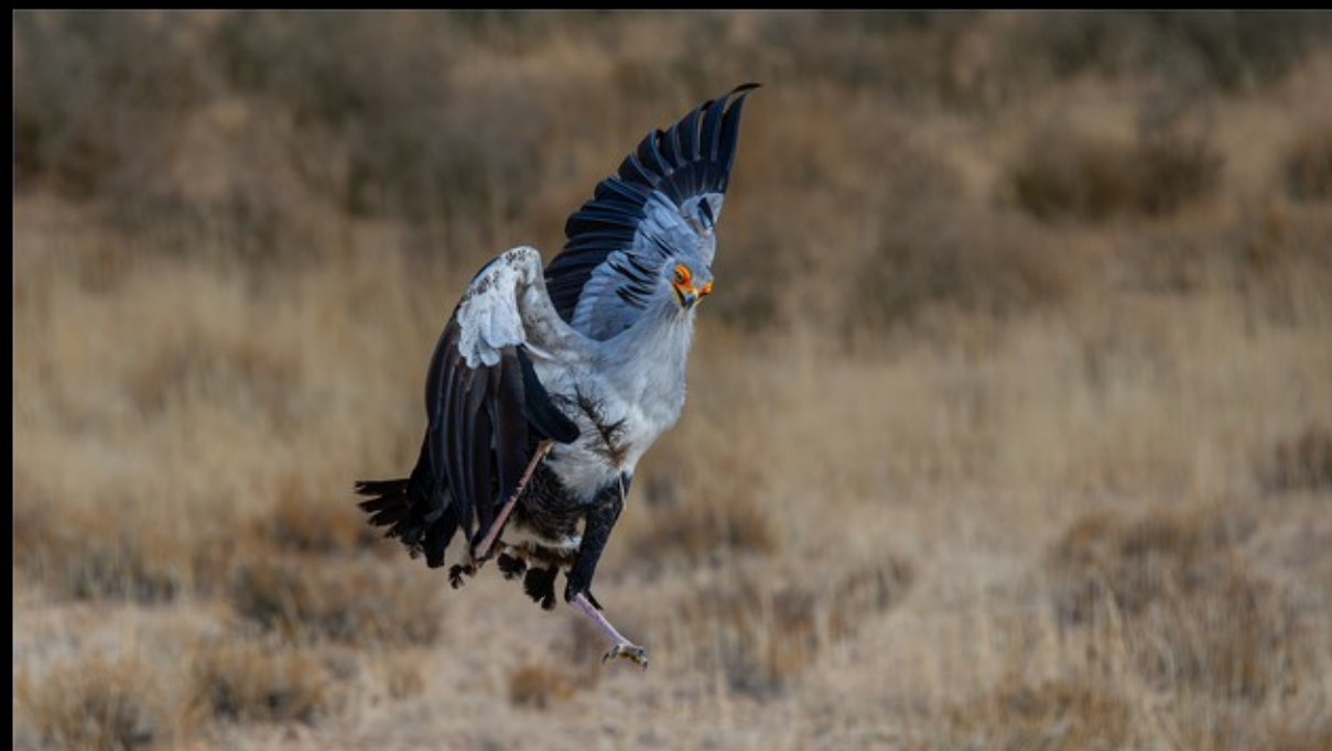
MR-001-Playing With A Feather 4-1097