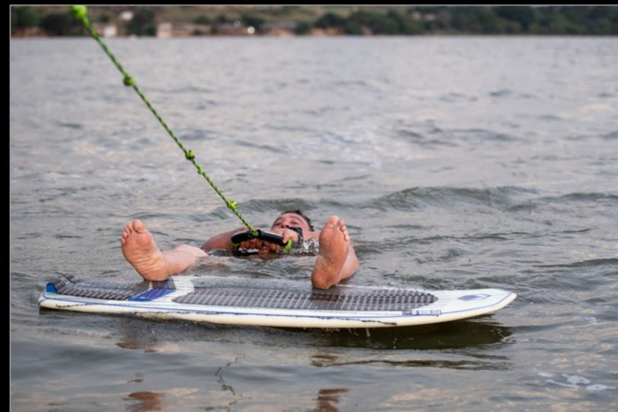
MR-001-Well done Big guy-11218