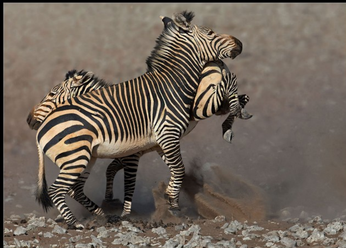
MR-001-04_Hartman zebras at waterhole-734