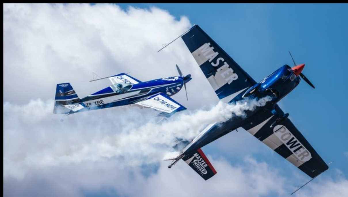
SP-1 star-Jacques Pieterse-3-Disqf-Aerobatics