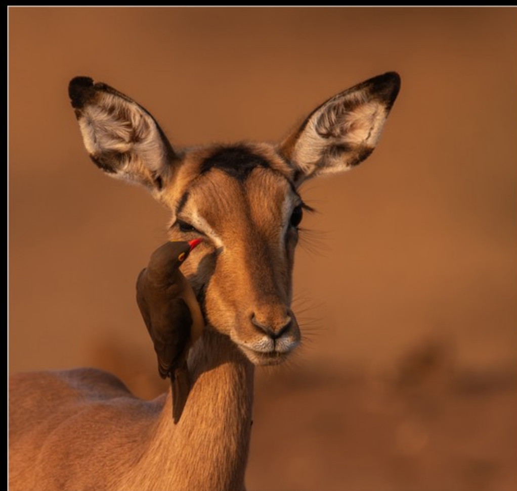
MR-001-Tick cure 3-9029