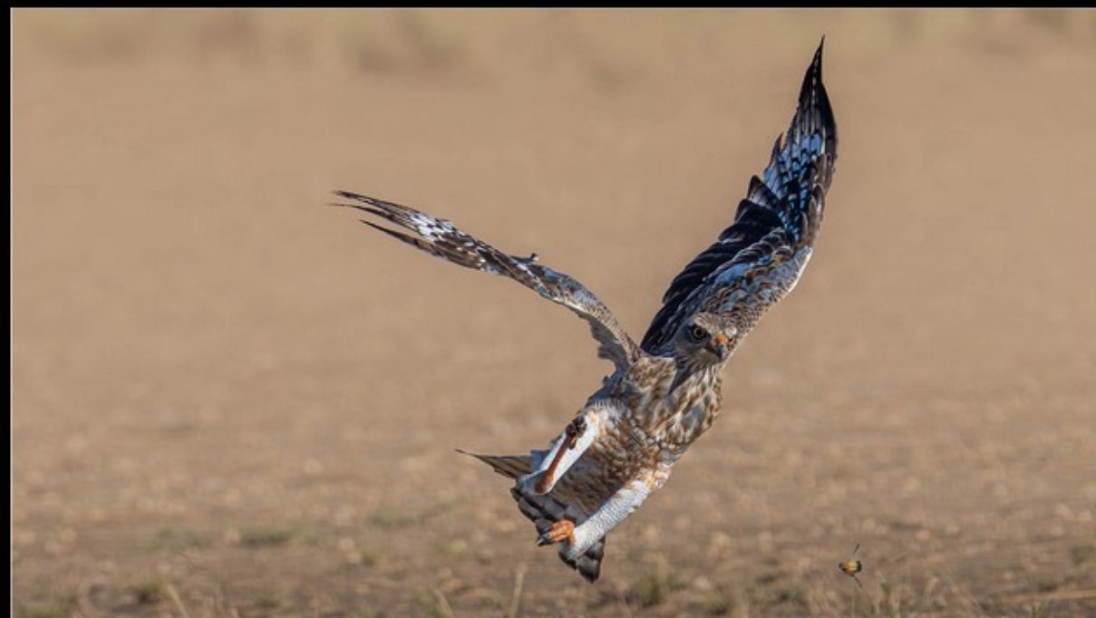
MR-001-The hunt is on 2-537