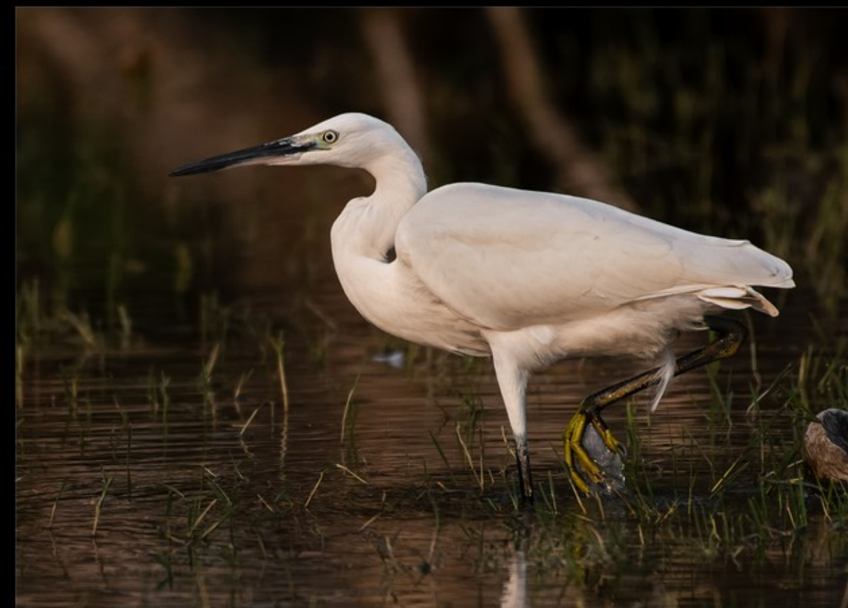
MR-001-Reier hengel in Moremi-14170