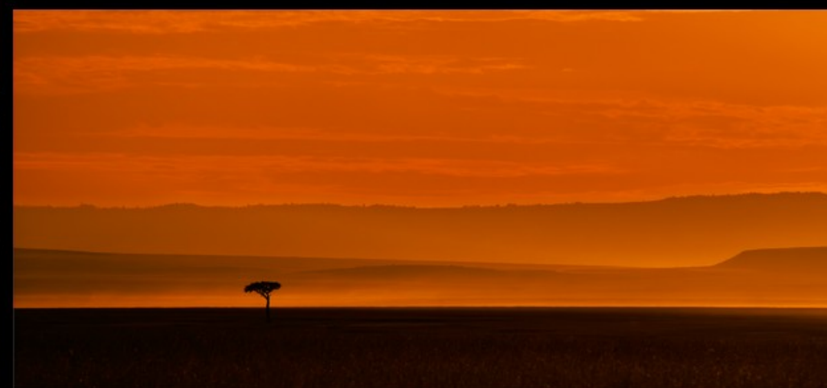
SC-M-Tania Cholwiche-39-COM; Ctg WIn-African Sunset