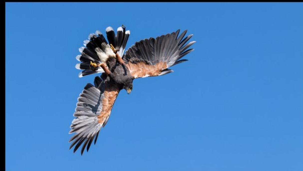
MR-001-Arial manouvers 3-7085