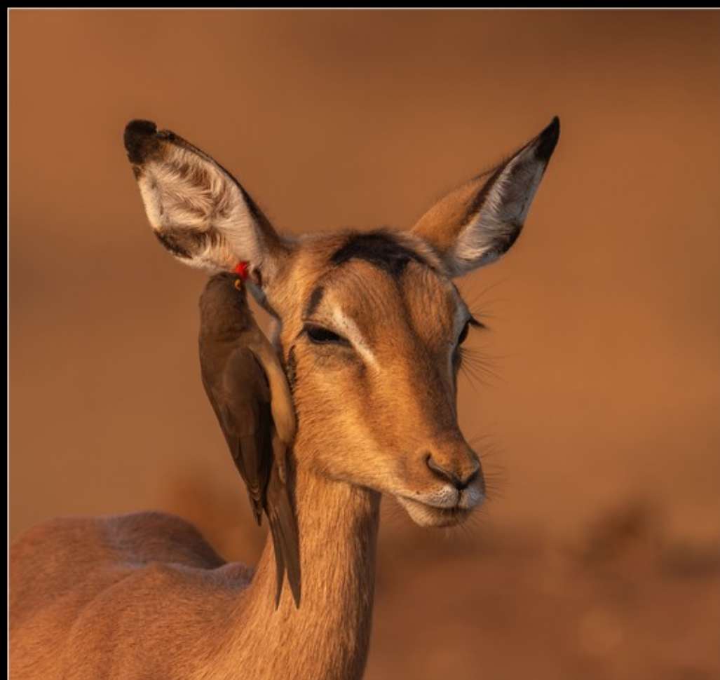
MR-001-Tick cure 1-9029