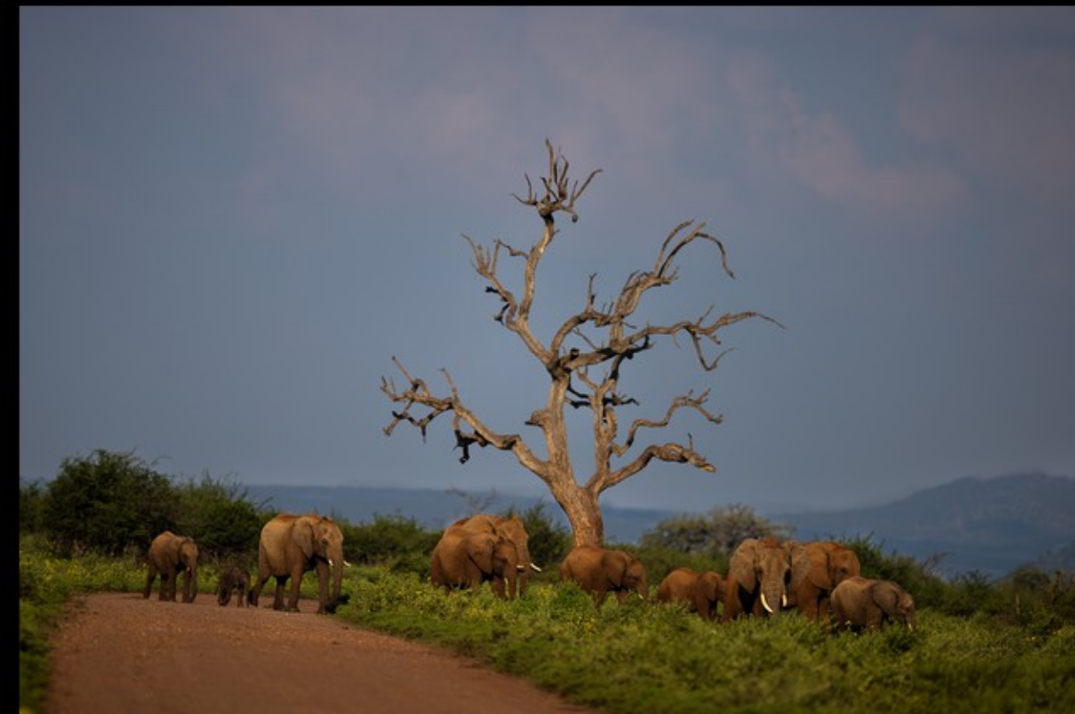
SC-2 star-Maria Geringer-36-G-Dust Road To The Horizon