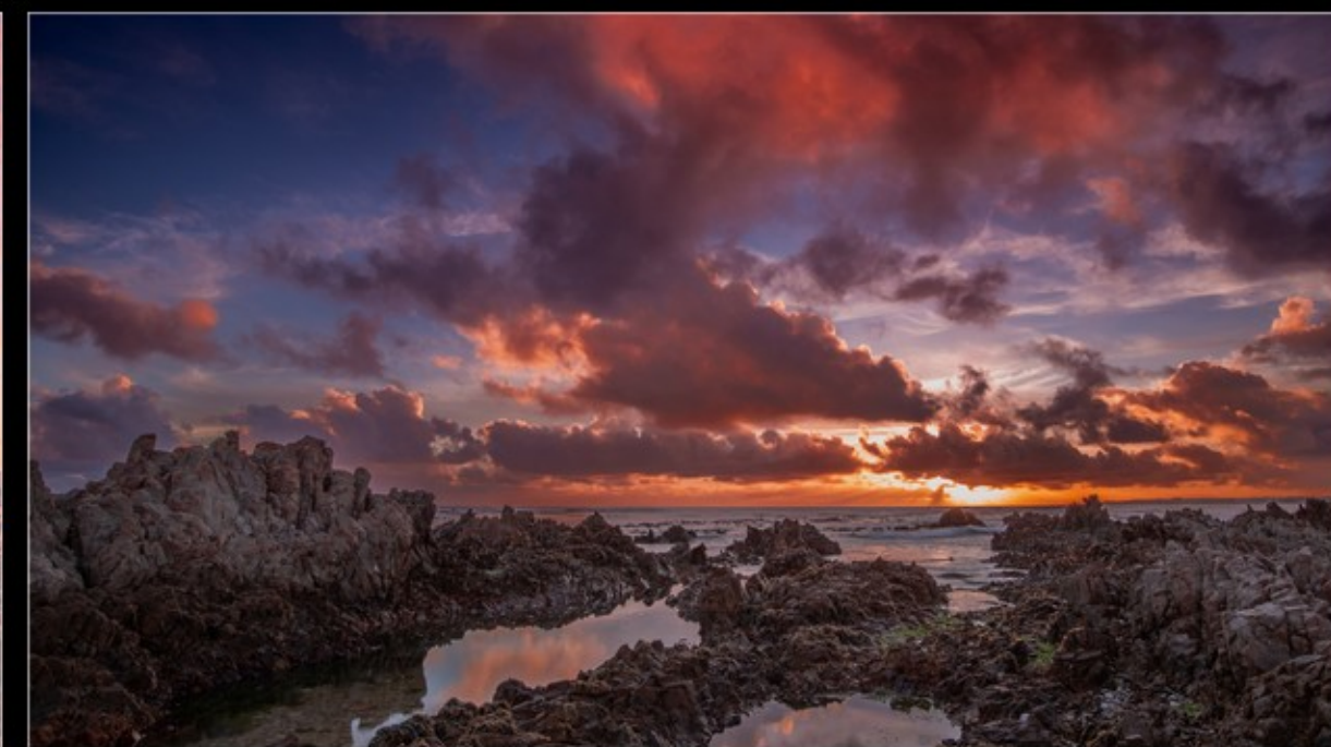
SC-M-Aj De Kerk-37-G-Die Son Gaan Rus