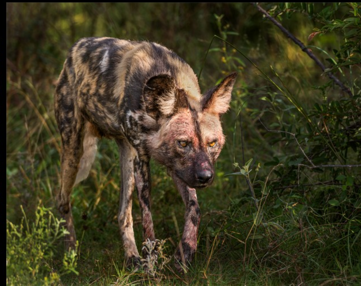
MR-004-Wild dog hunting-12921