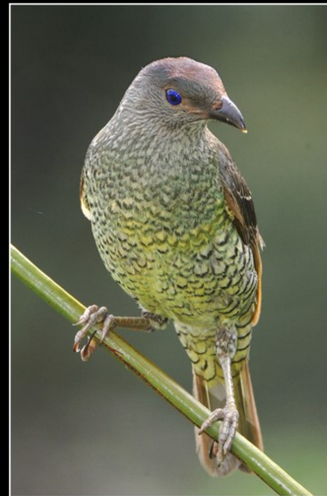
NB-M-Cor Rademeyer-35-G-Female Blue Eyed Bower Bird