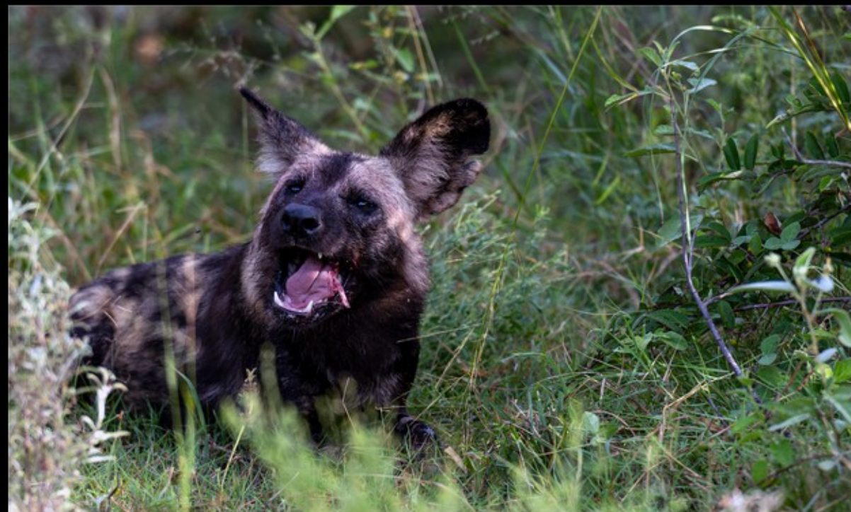
MR-003-Wild dog hunting-12921