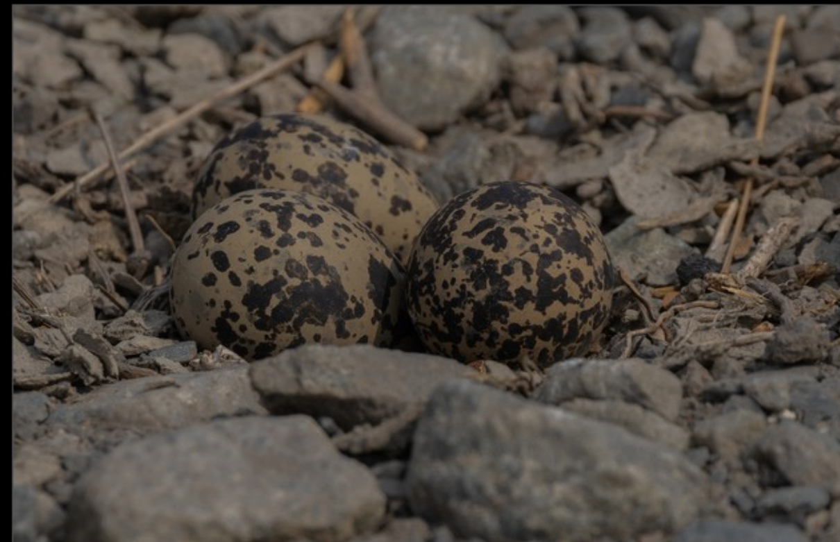
MR-001-Lewe van die Bontkiewiet-2806