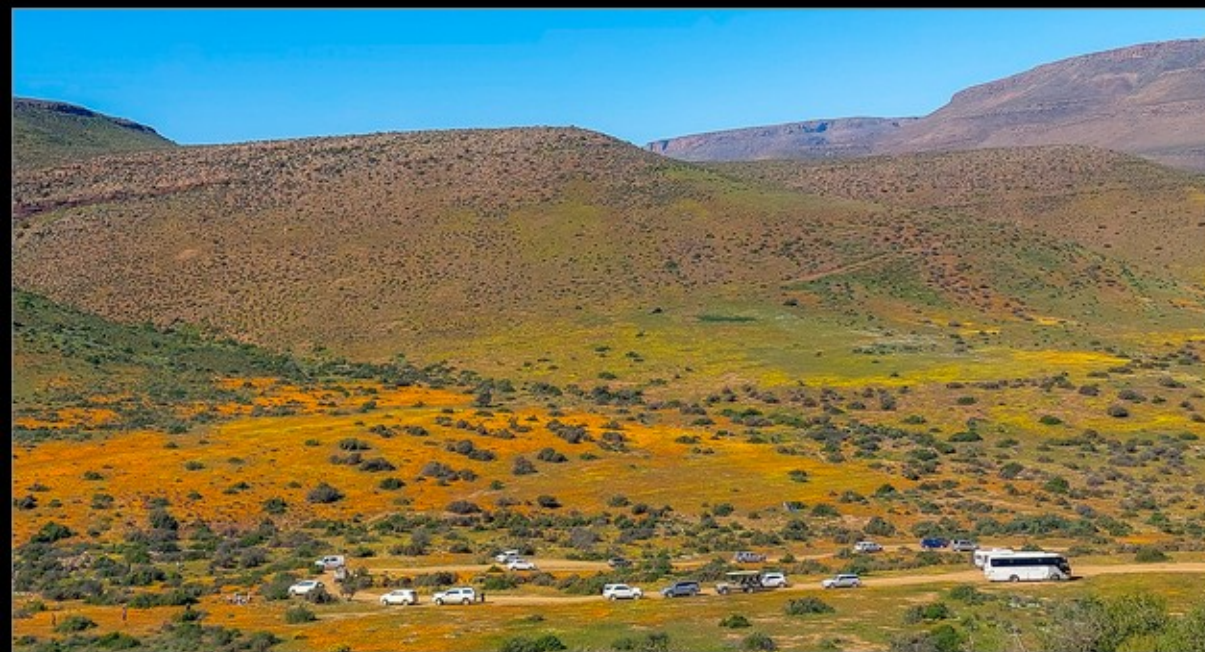
PJ-4 star-Lydia Wolmarans-33-G-Blommetyd In Namakwaland