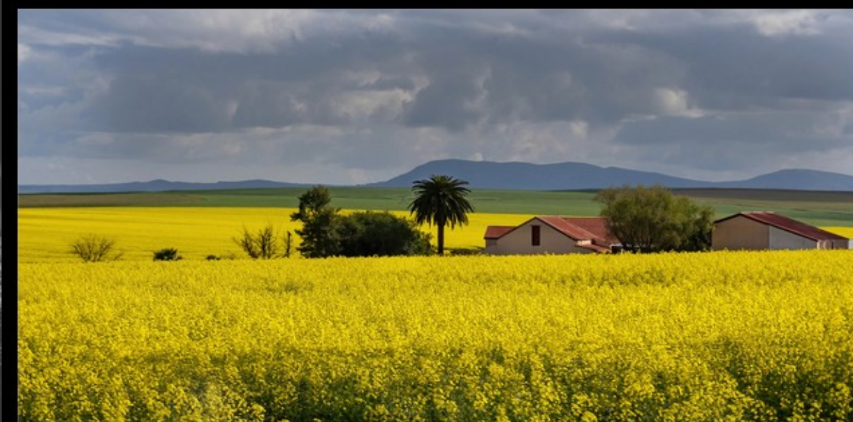
SC-M-Carien Kruger-35-G-Rooidakhis Tussen Die Canollas