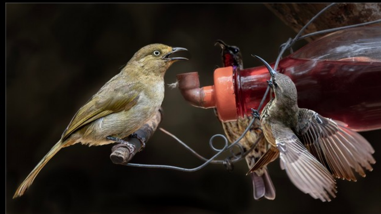
MR-002-Wie is die nektar koning-3999