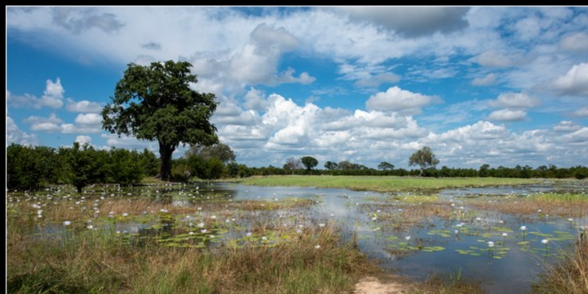
SC-M-Ingrid Marais-35-G-Leliedam 2