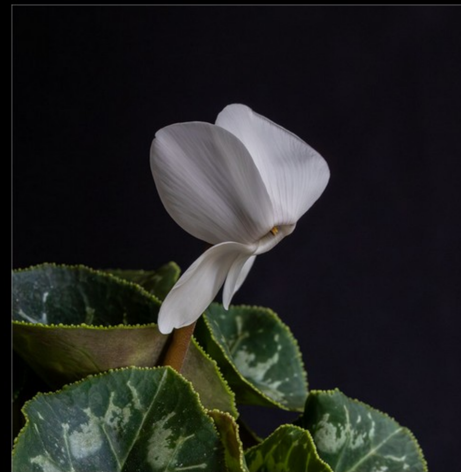
MR-001-Cyclamen Mini 3-17833