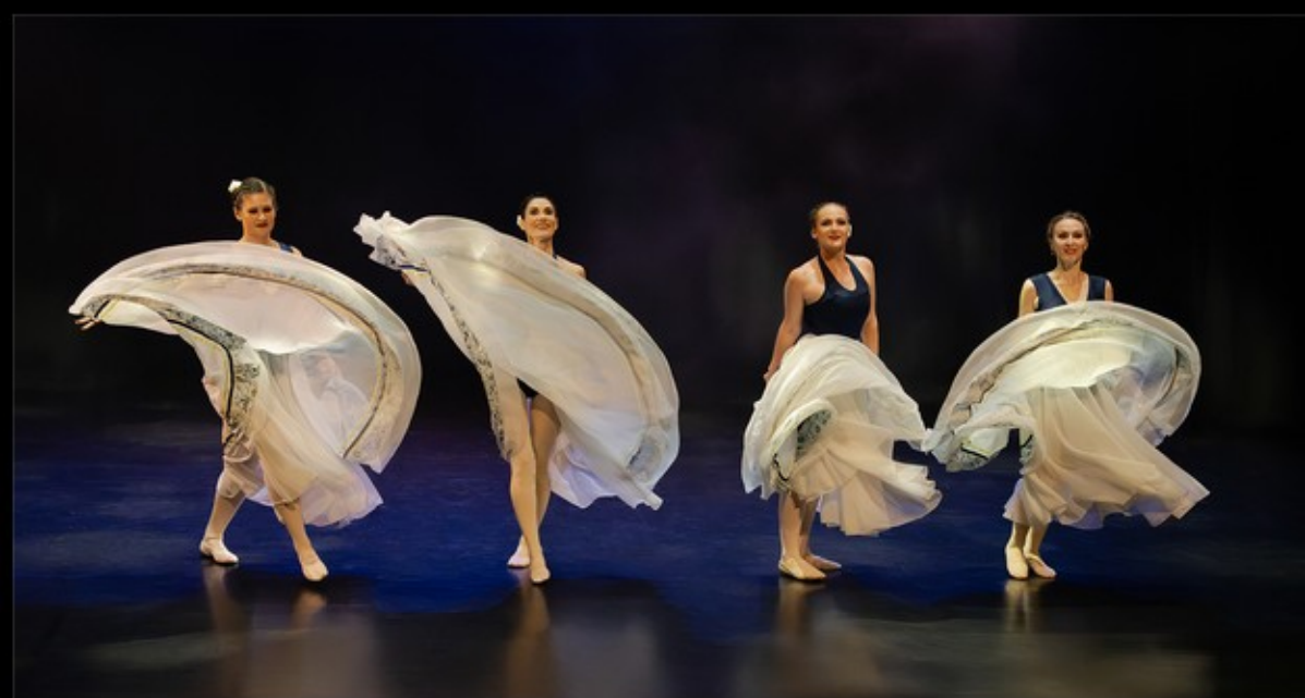
MR-001-Happy dancing team 2-8861