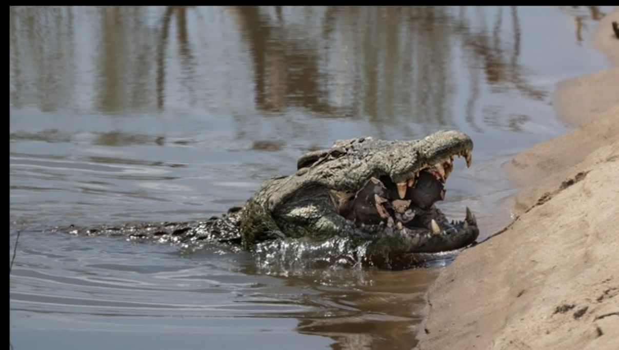
MR-001-3 Nile crocodile caught a terrapin-1918