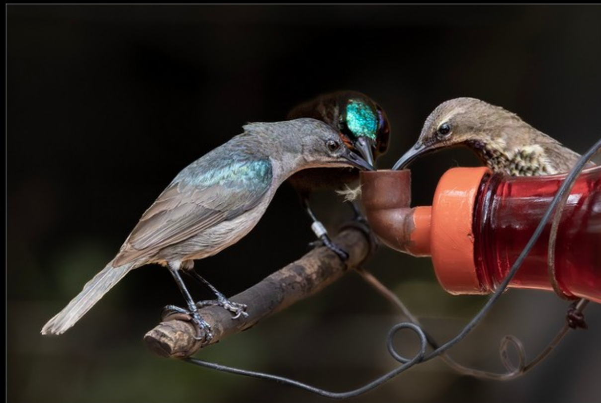
MR-001-Wie is die nektar koning-3999