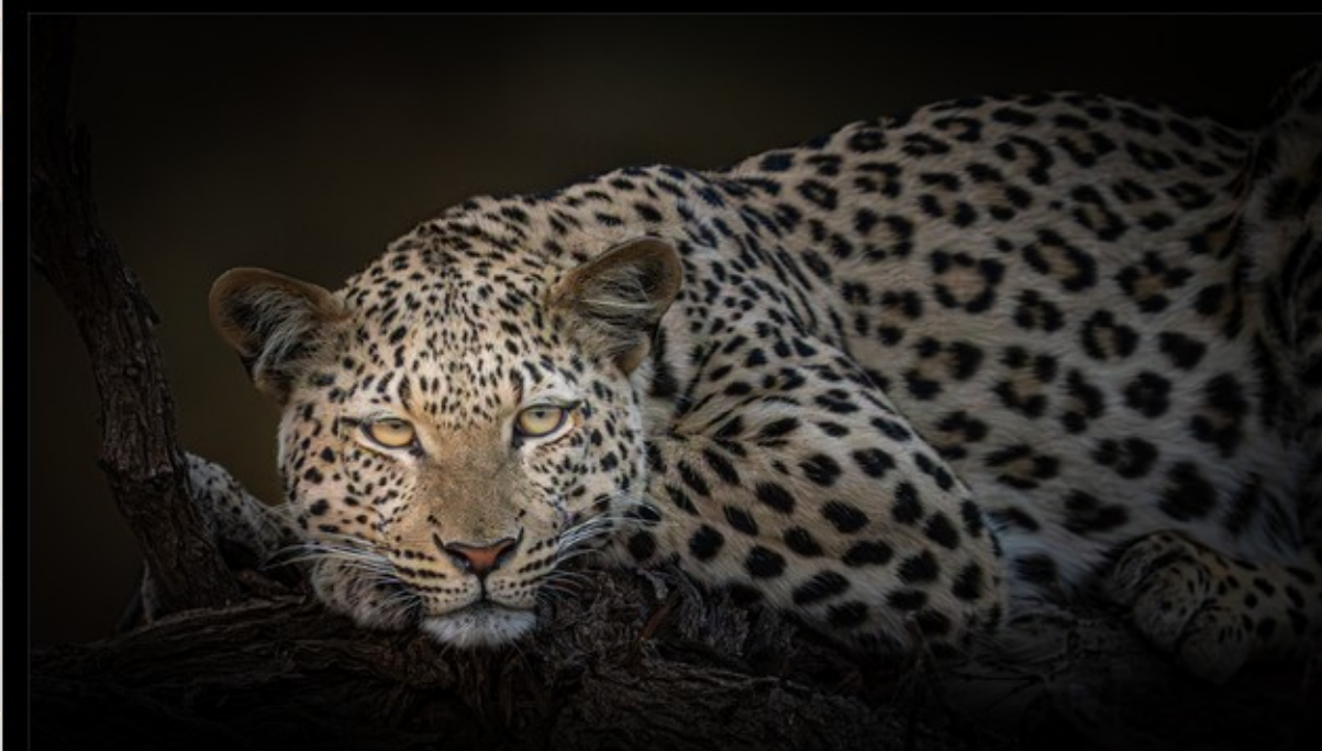
PO-M-Johan Greyling-39-COM; Ctg Win-Leopard Stare