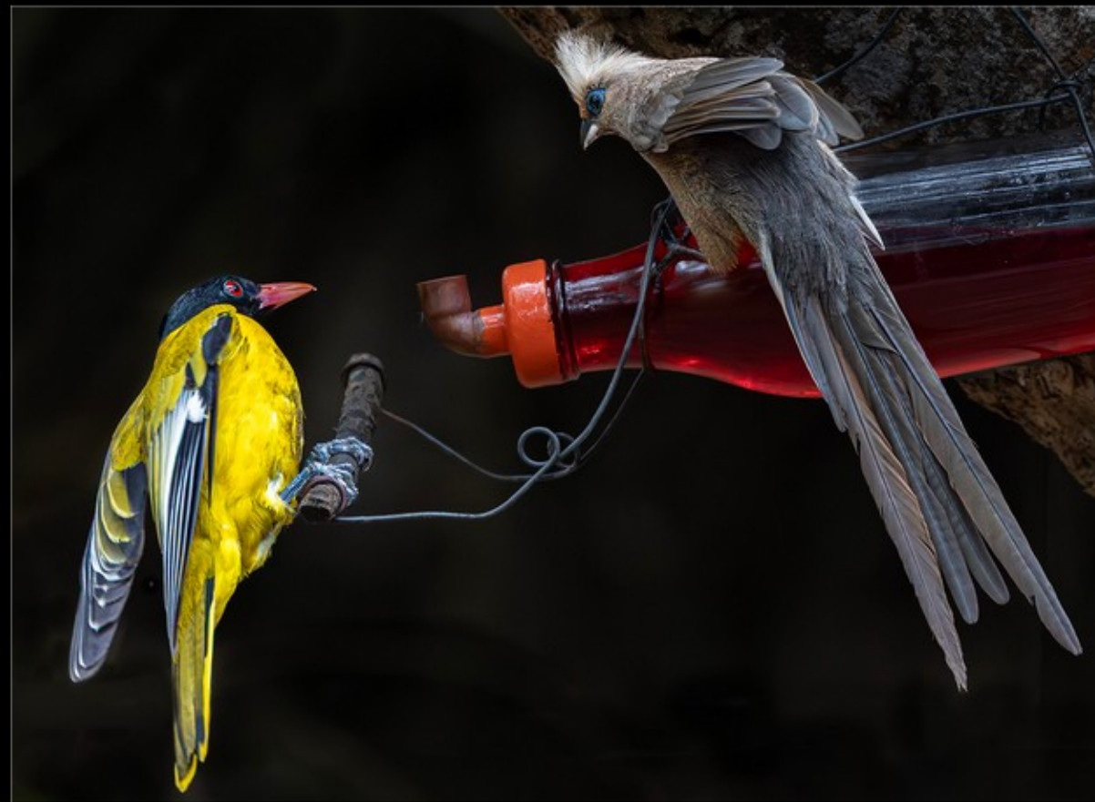
MR-004-Wie is die nektar koning-3999