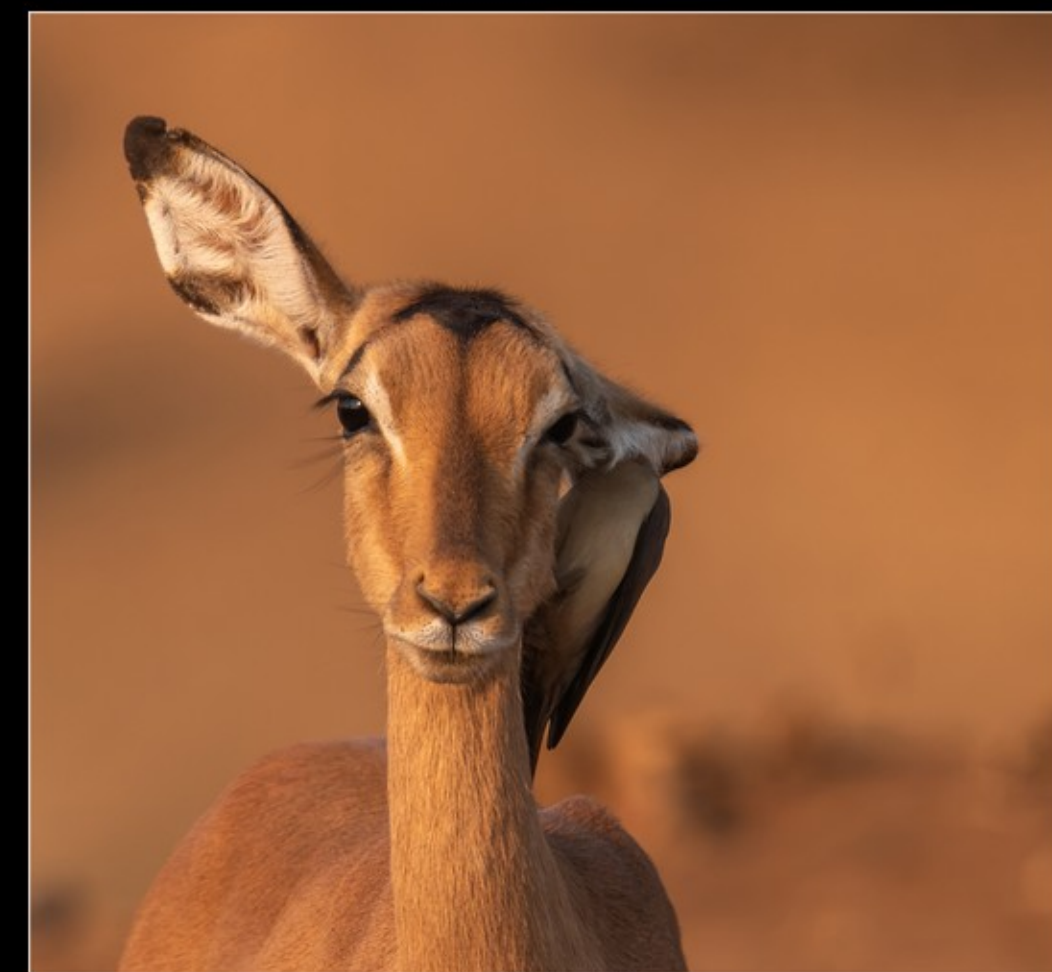
MR-001-Tick cure 5-9029