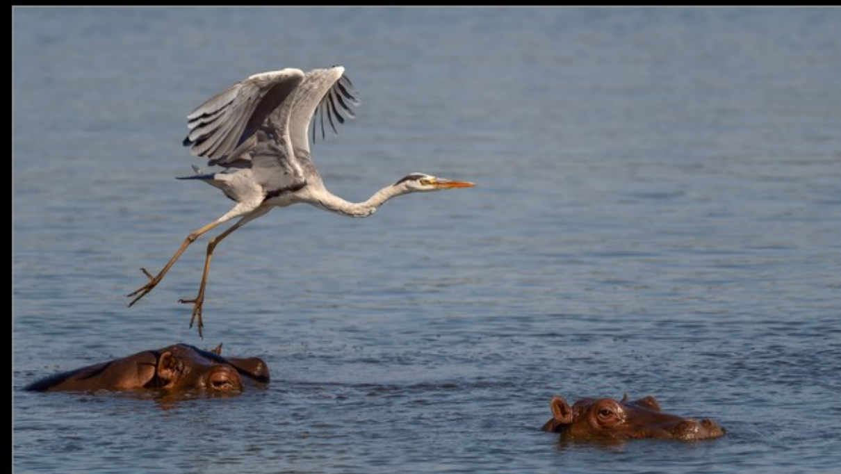
NB-5 star-Hans Bogenhofer-36-G-Sunset Dam Uber