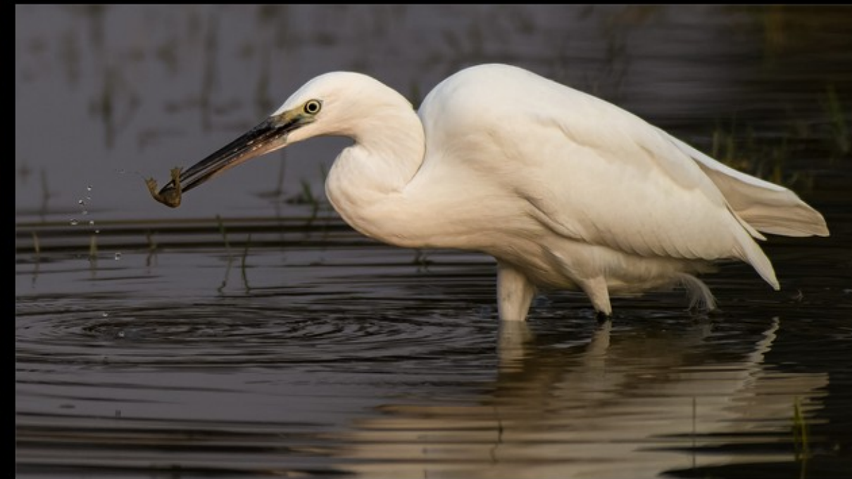
MR-004-Reier hengel in Moremi-14170