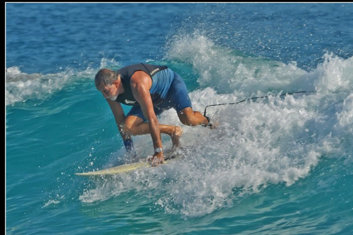
MR-001-Ou surfer 4-629