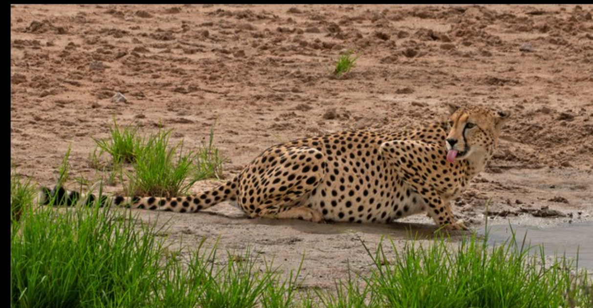
NA-M-Ona Ackermann-36-G-Dikgevreet En Dors