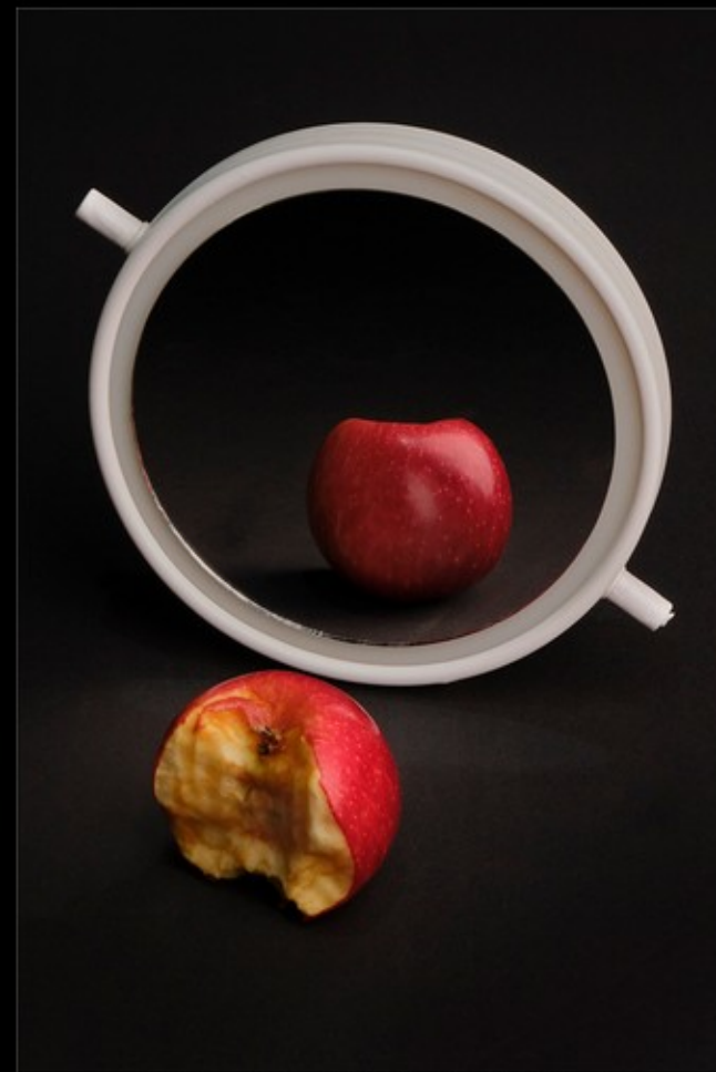
PO-M-Ryno Eksteen-36-G-Both Sides Of Social Media