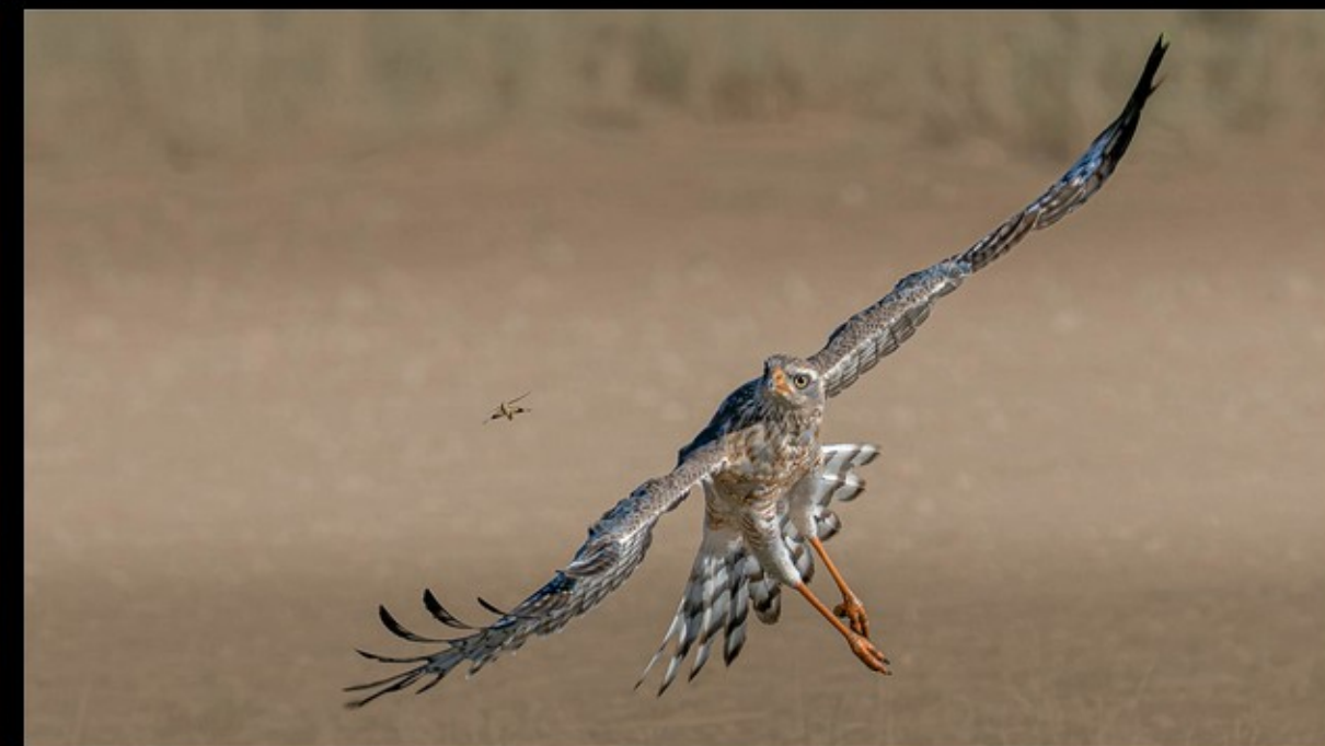
MR-001-The hunt is on 4-537