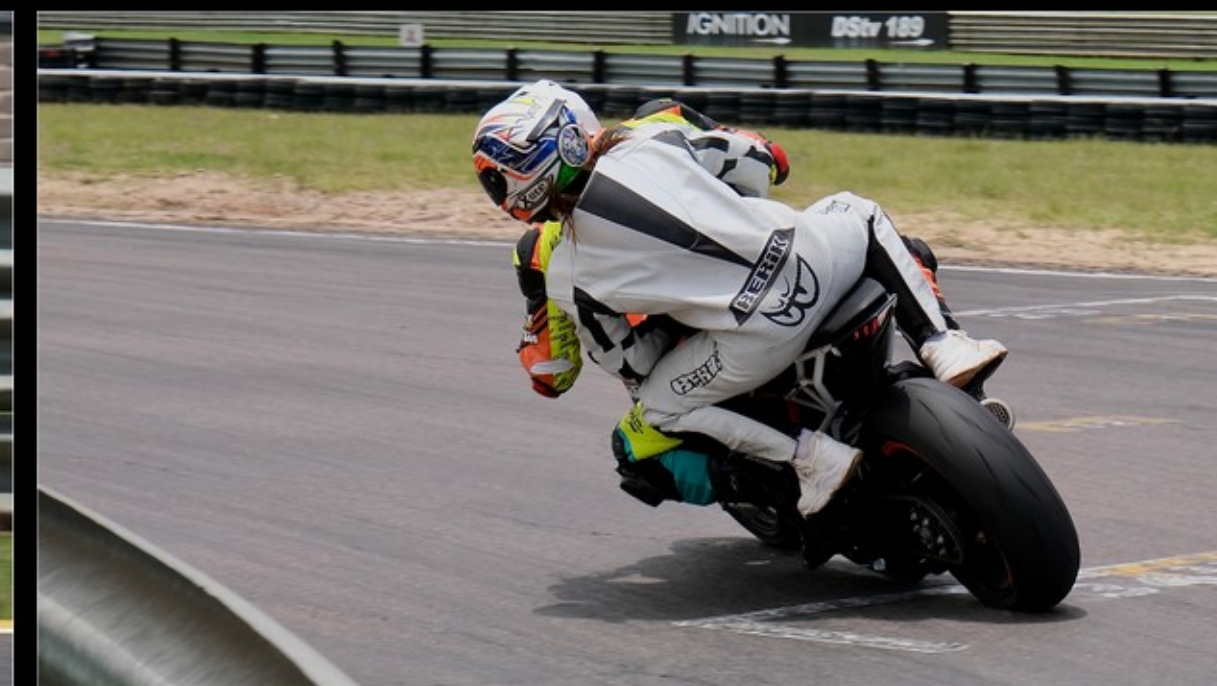
MR-001-Met toestemming ry sy saam 4-10568