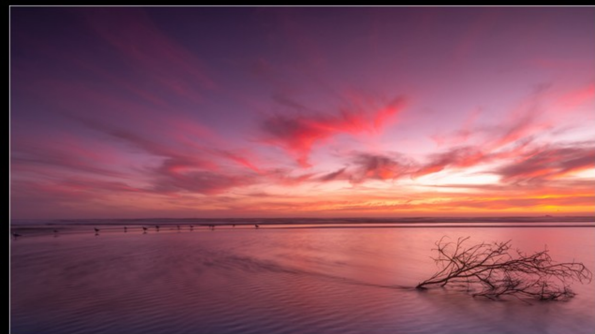
SC-M-Aj De Kerk-39-CDM-Seemeeue Soek Kos