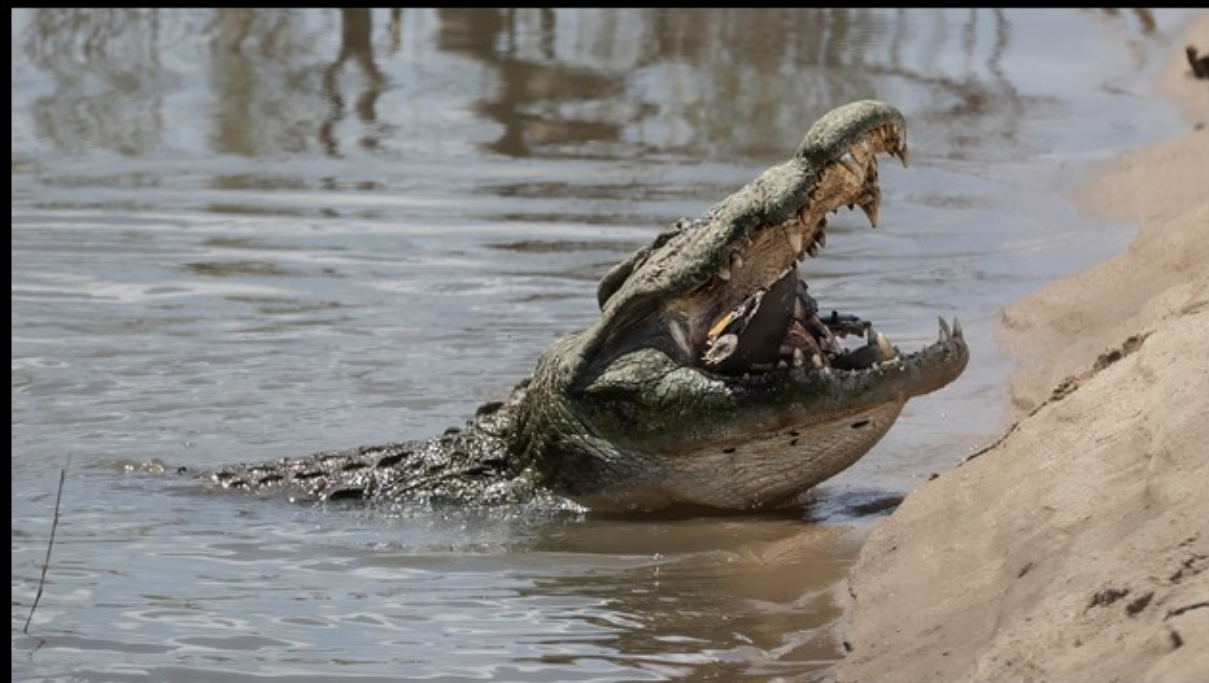
MR-001-4 Nile crocodile caught a terrapin-1918