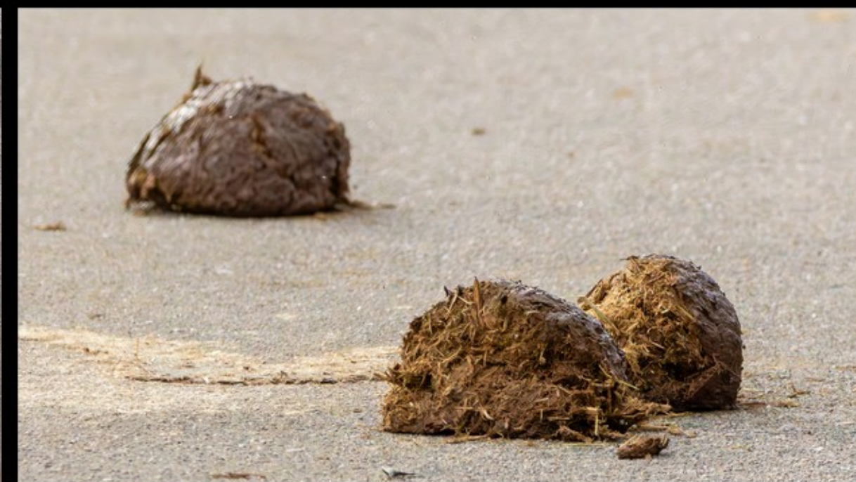
MR-001-Die voedselketting 3-348