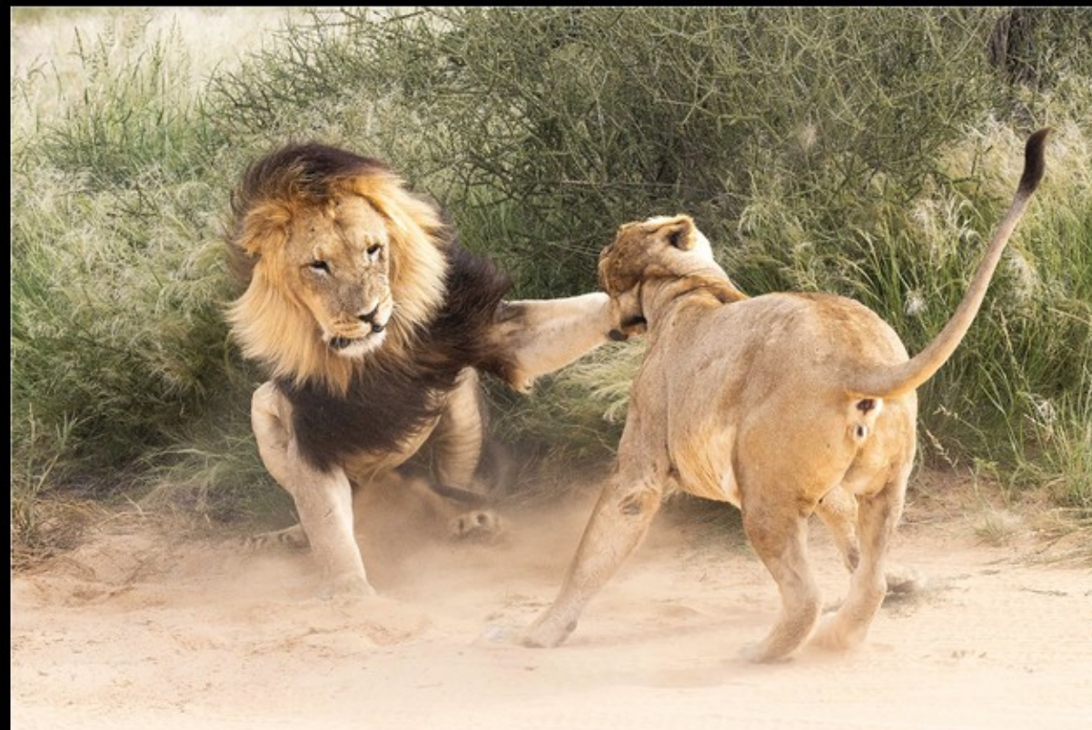
MR-001-Denied with force_series 4-18