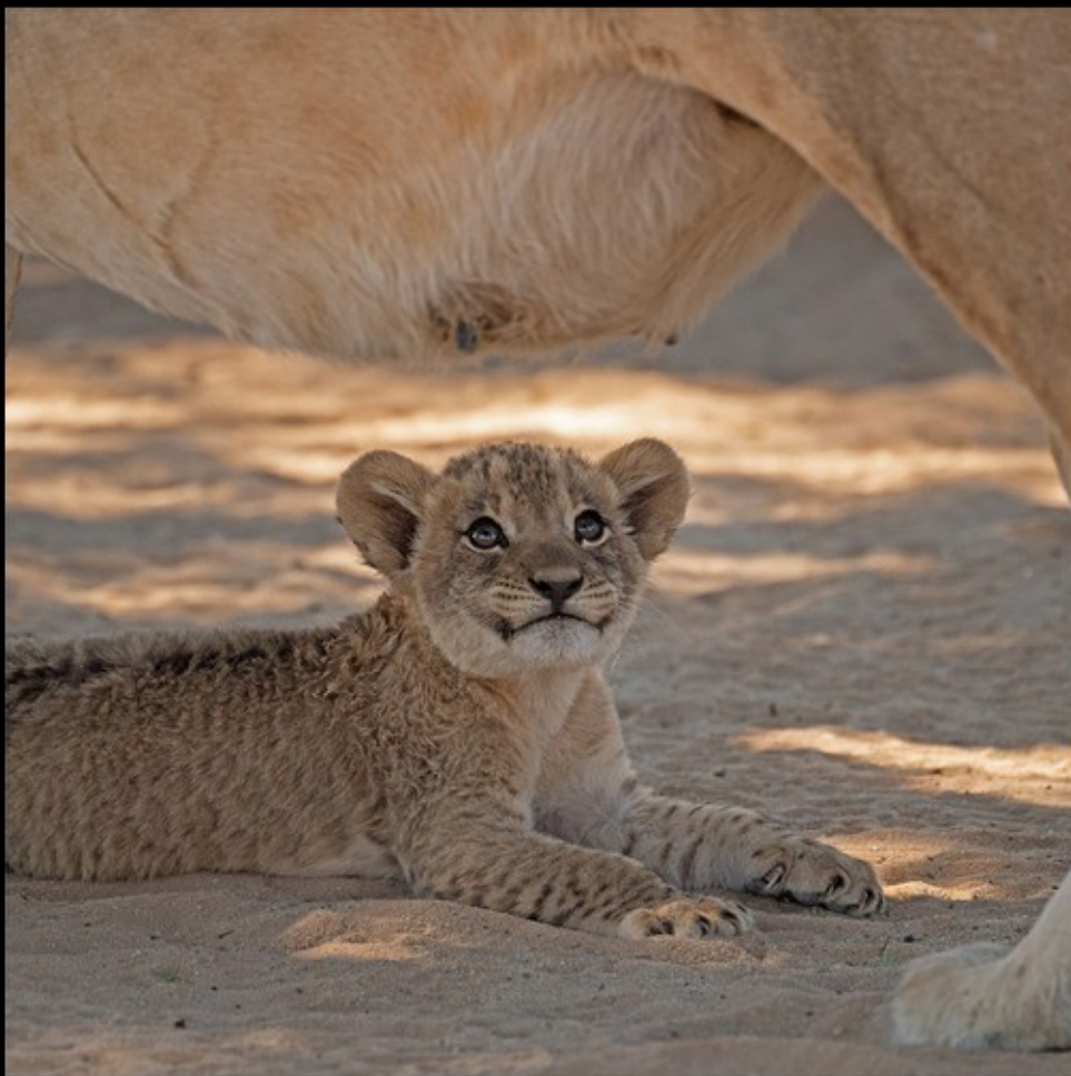
MR-001-\ån lus tot lip aflek lekker-7635