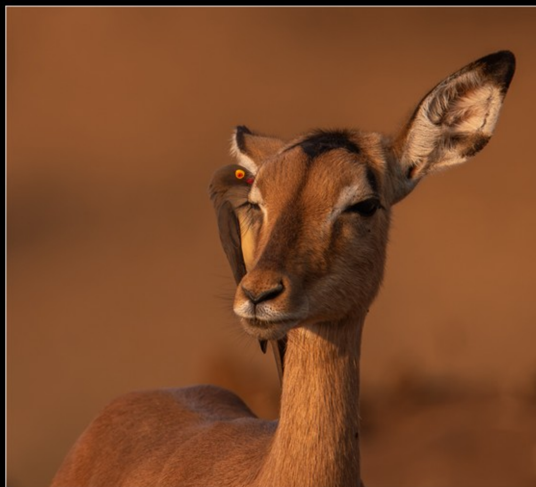
MR-001-Tick cure 4-9029