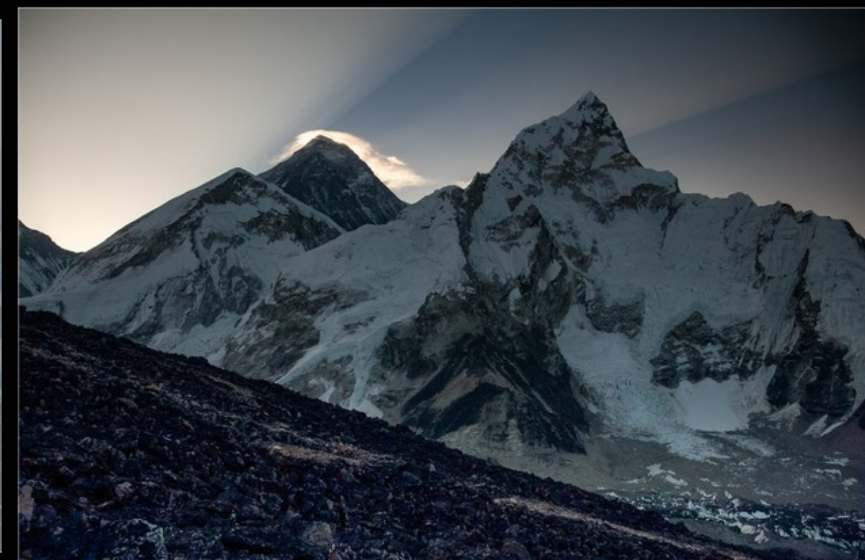
MR-001-Khumbu Valley Vista-4-1113