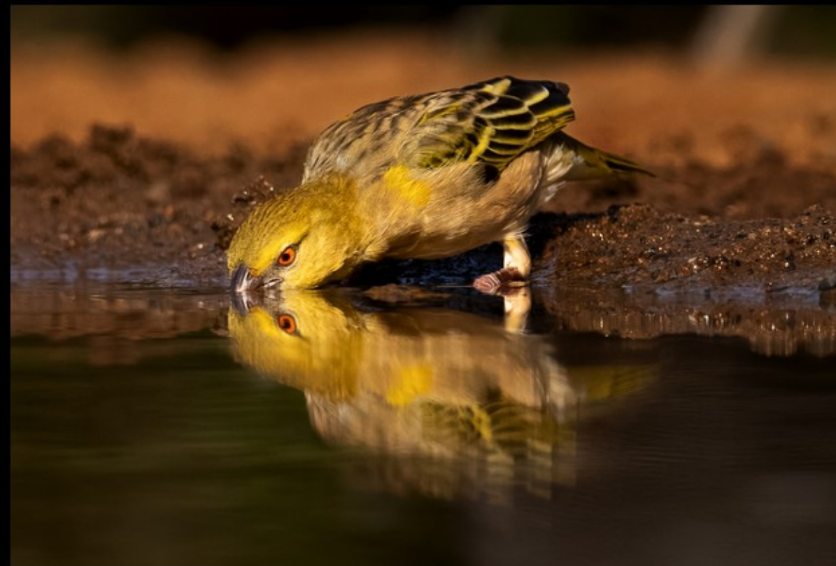
NB-2 star-Maria Geringer-38-G; WIN; Ctg Win-Eye To Eye