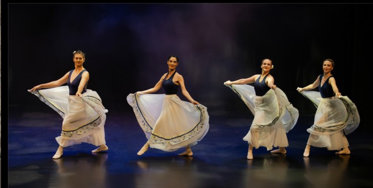
MR-001-Happy dancing team 1-8861