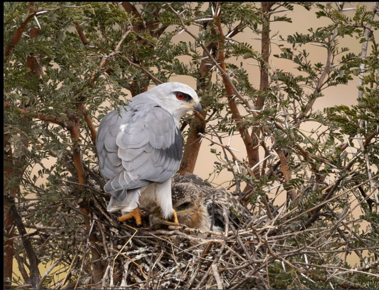
NB-M-Antoinette Oelofsen-36-G-Blouvalk Met Kuikens In Nes