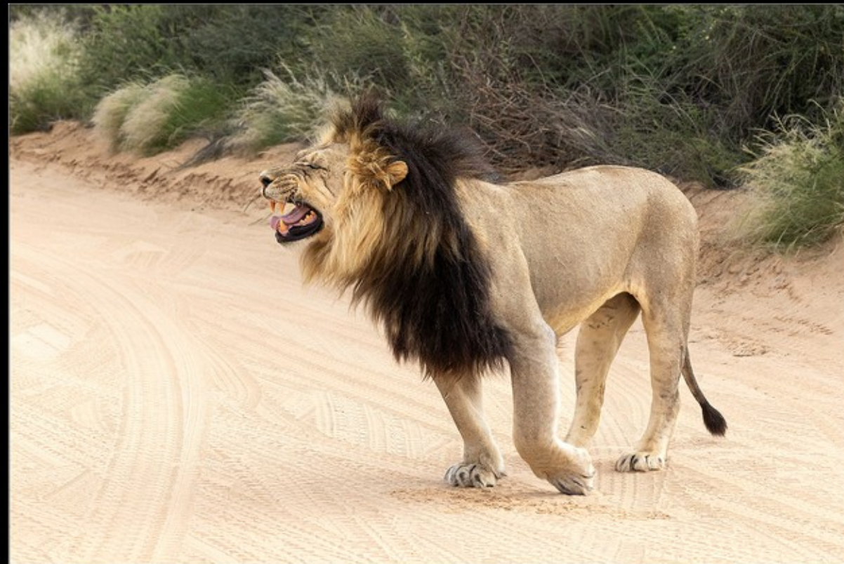
MR-001-Denied with force_series 1-18