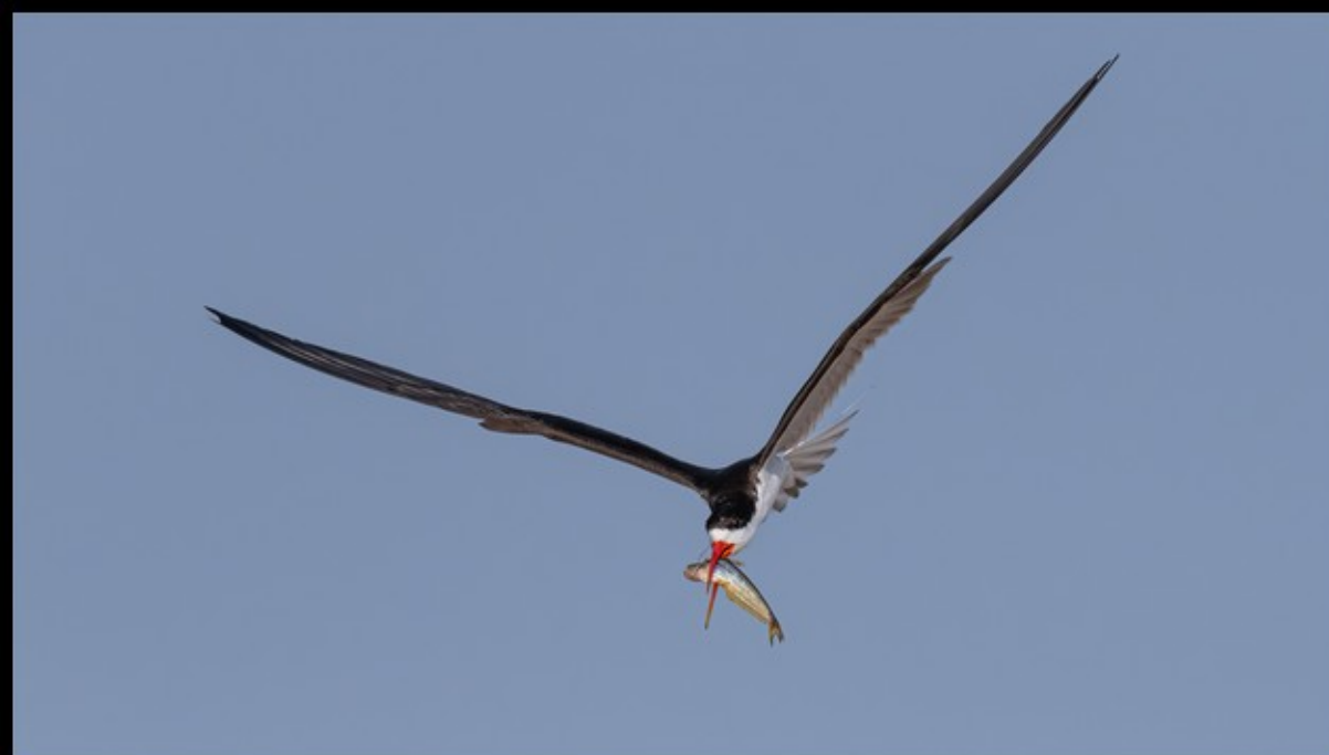
NB-M-Tania Cholwich-37-G-African Skimmer With Catch