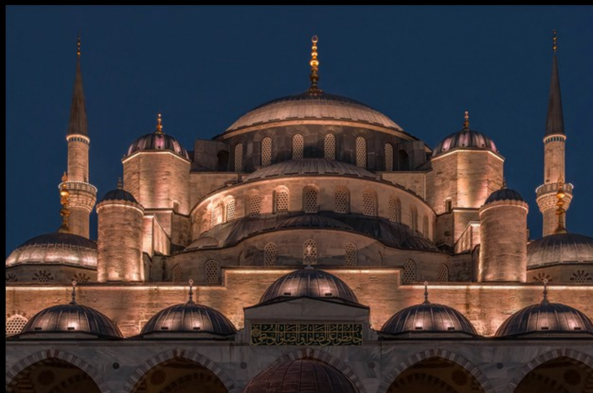
PO-M-Carien Kruger-38-G-Blue Mosque At Blue Hour