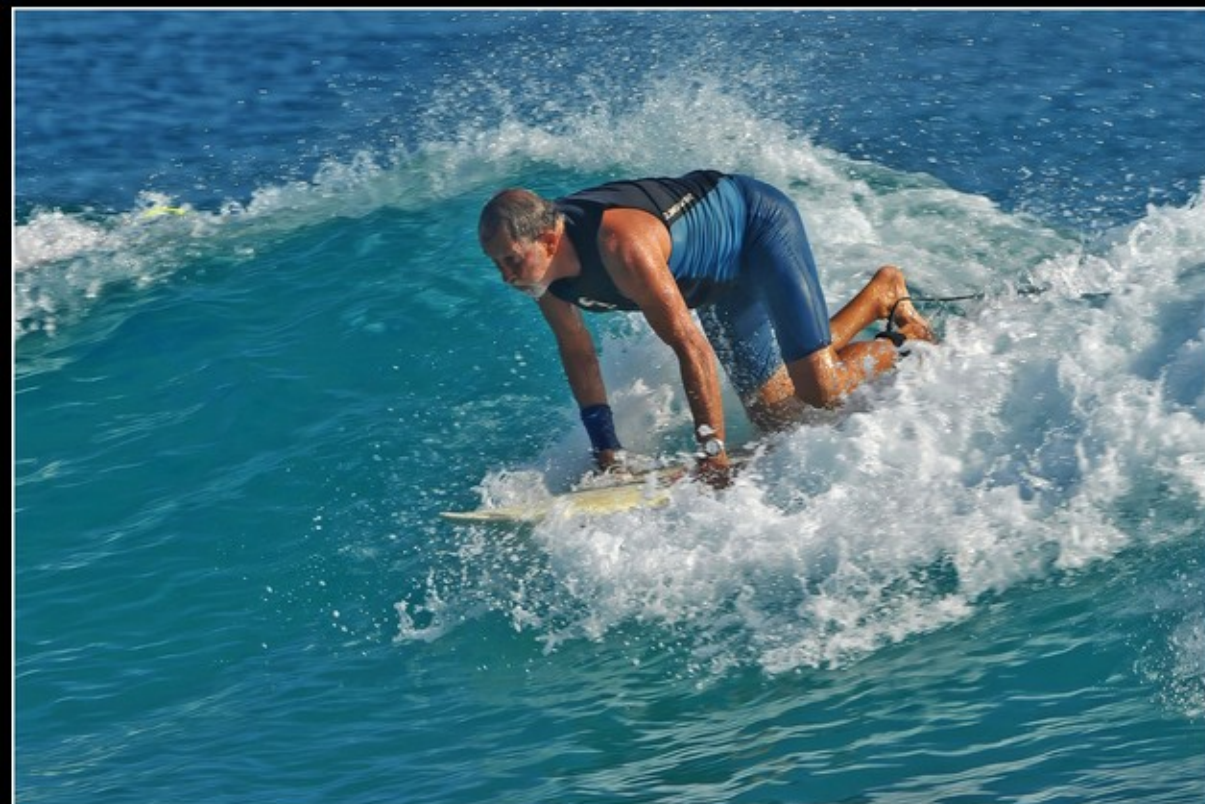
MR-001-Ou surfer 3-629