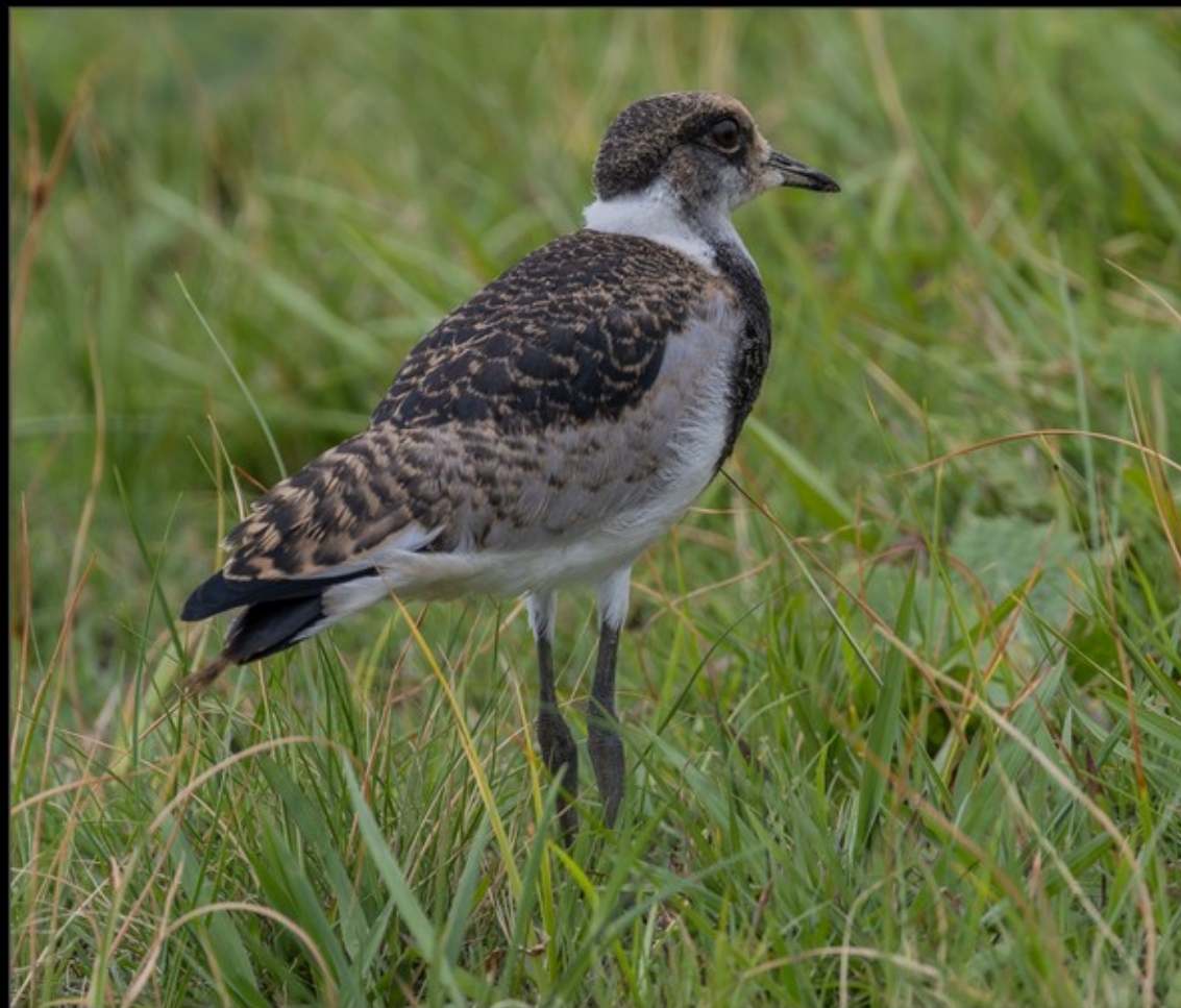
MR-003-Lewe van die Bontkiewiet-2806