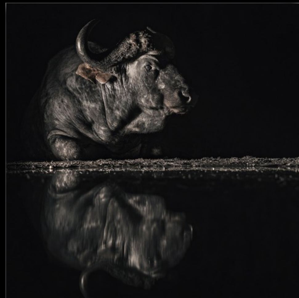
PO-2 star-George Geringer-37-G; Ctg WIn-Buffel In Die Nag