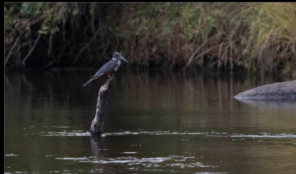
MR-001-1 Amper Take Aways-17046