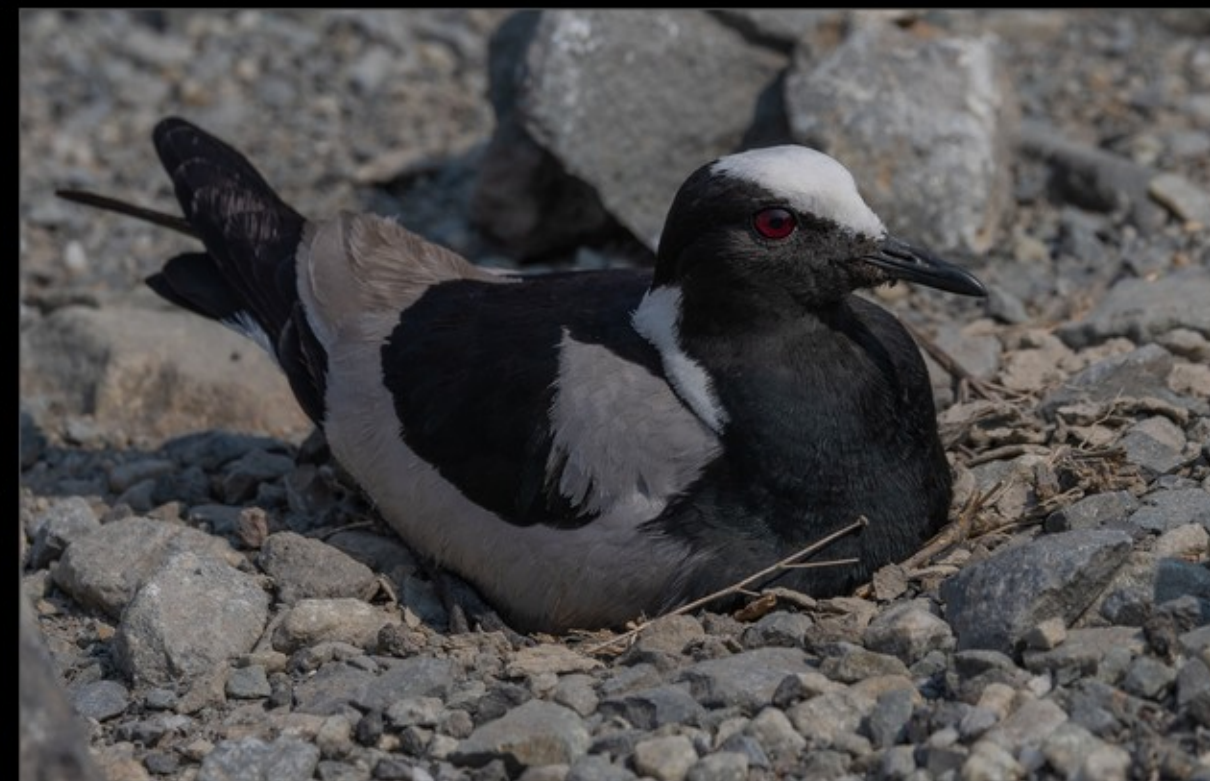
MR-002-Lewe van die Bontkiewiet-2806