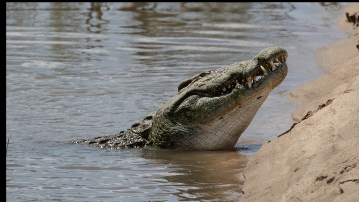
MR-001-5 Nile crocodile caught a terrapin-1918