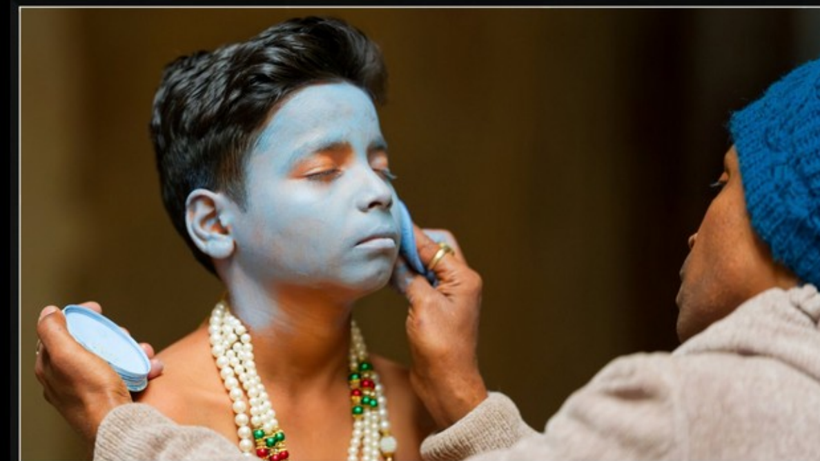
MR-001-Indian boy transformerd with blue makeup -16814