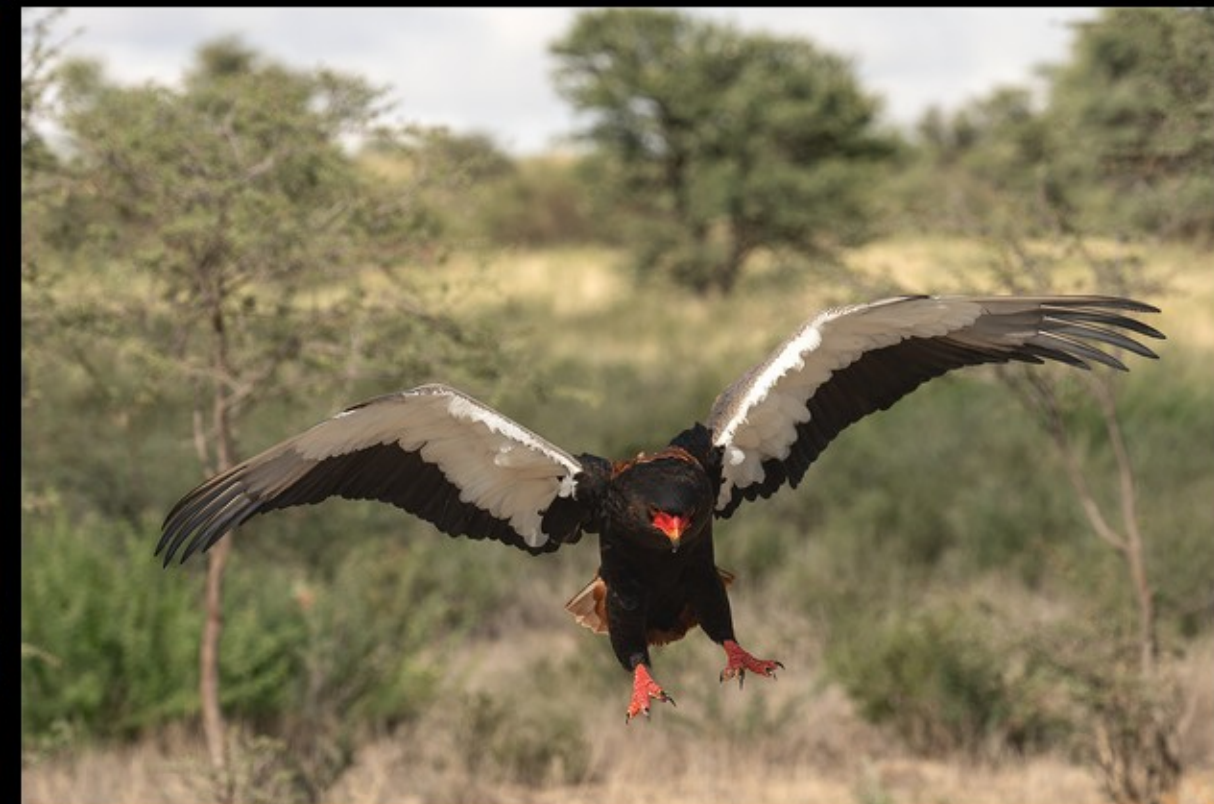
MR-001-Berghaan kom in-17924