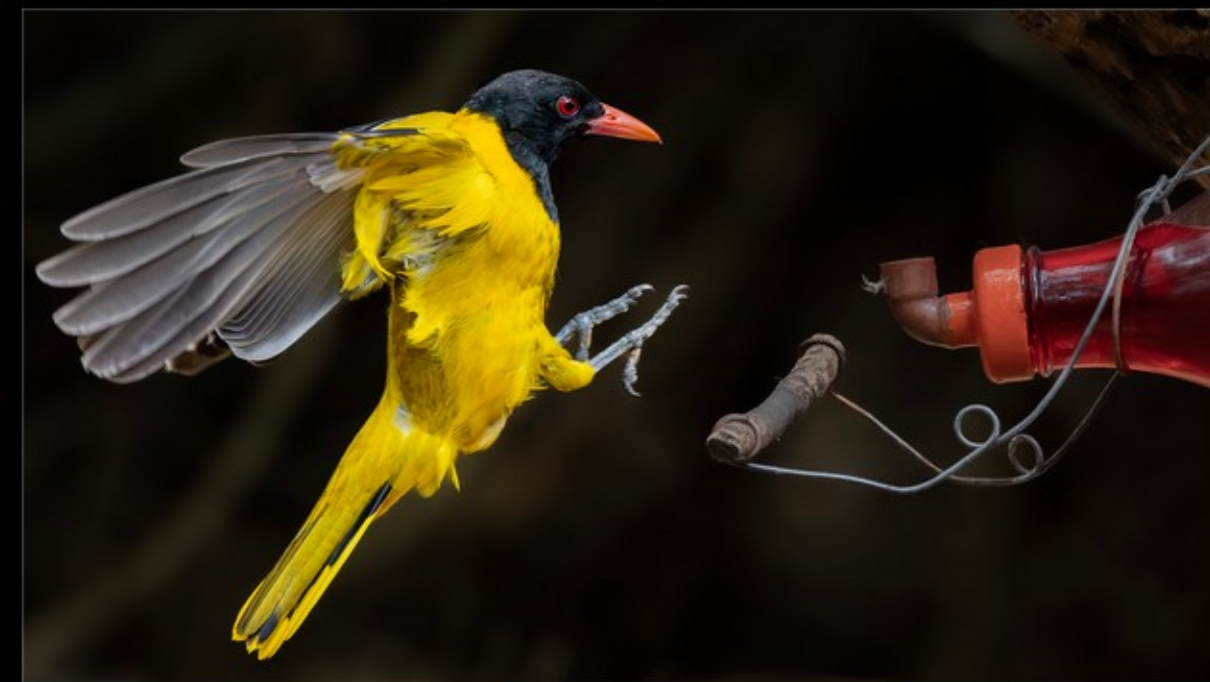
MR-003-Wie is die nektar koning-3999