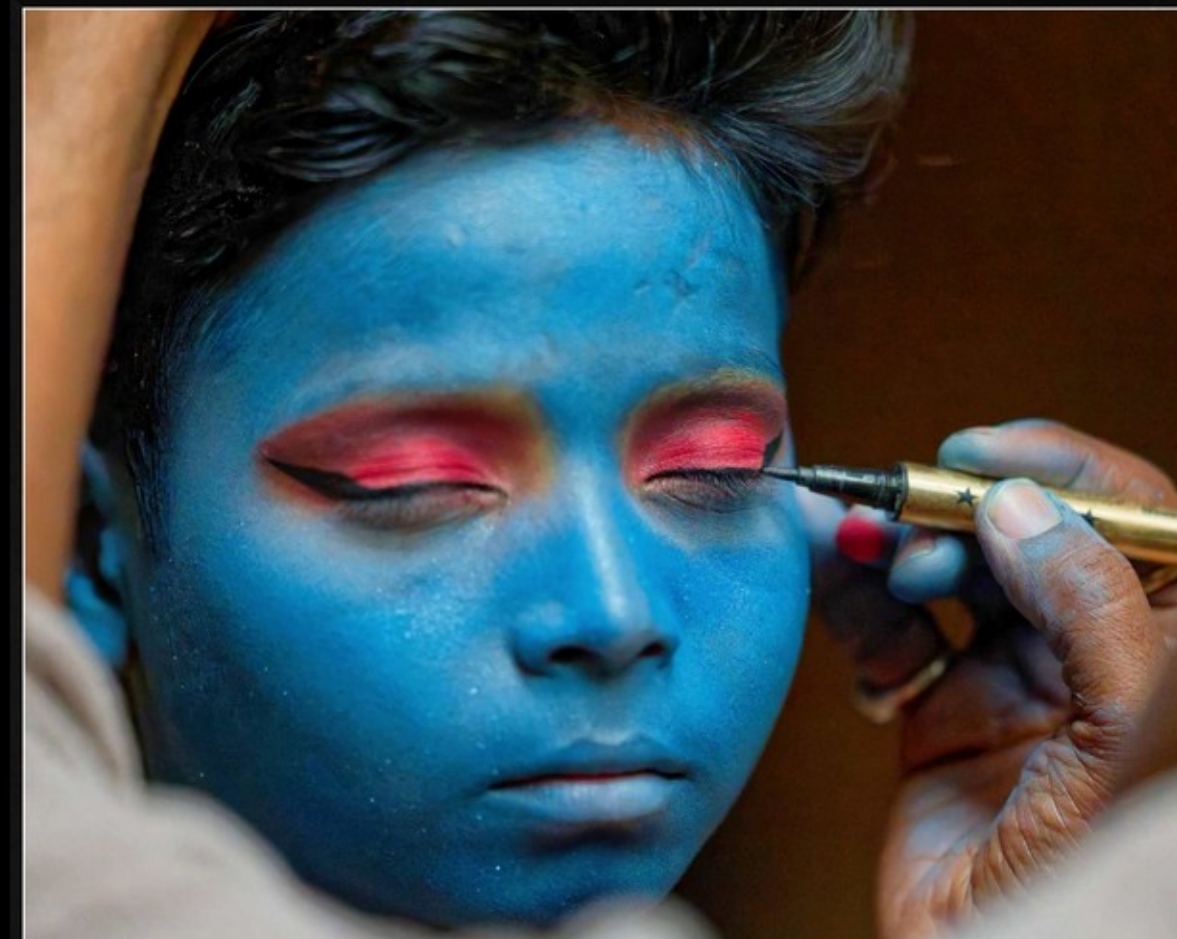
MR-001-Indian boy transformed with blue makeup-16814