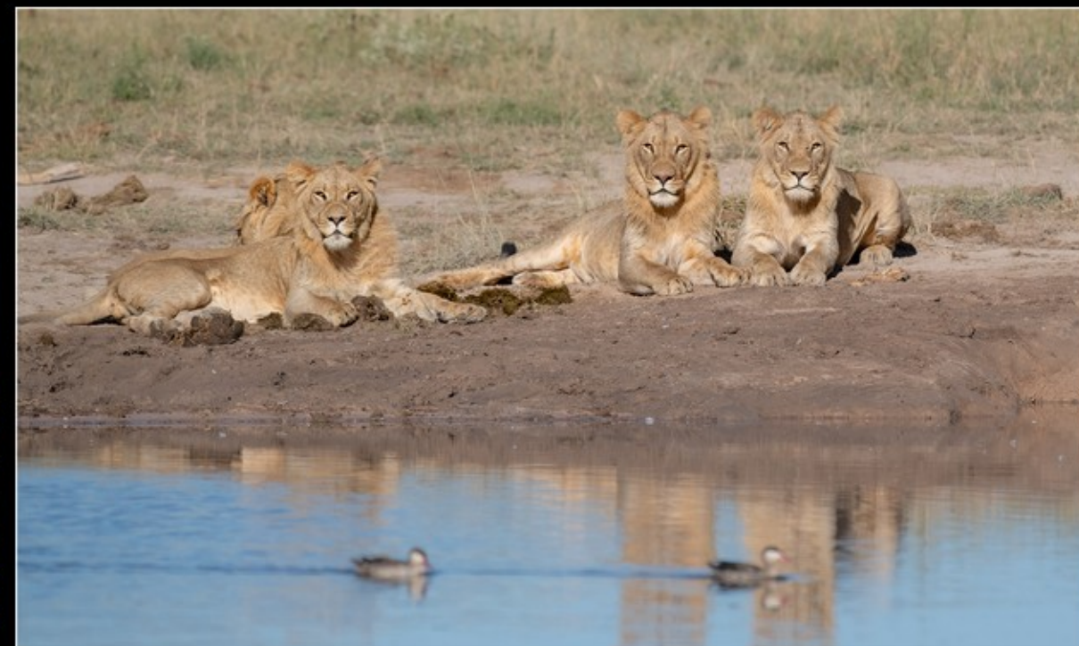
MR-001-Curious lions 5-202