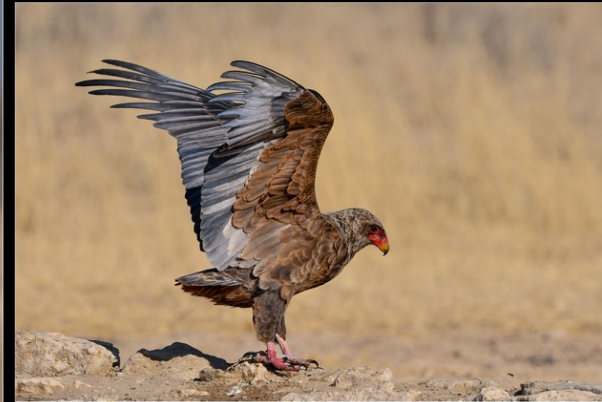
NB-M-Chris Erasmus-39-COM-Young Wings Unfold