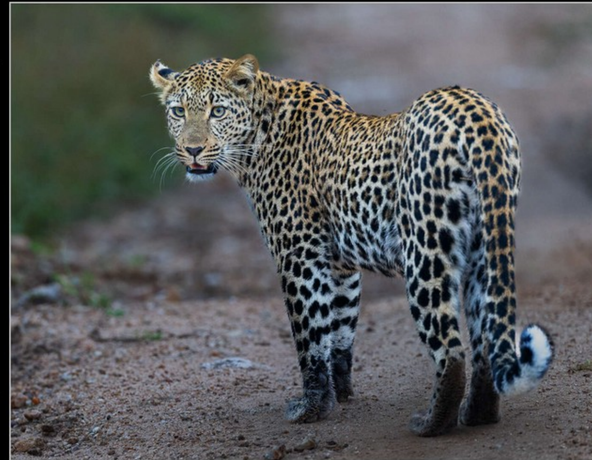
NA-5 star-Keith Boehme-36-G-Bewondering