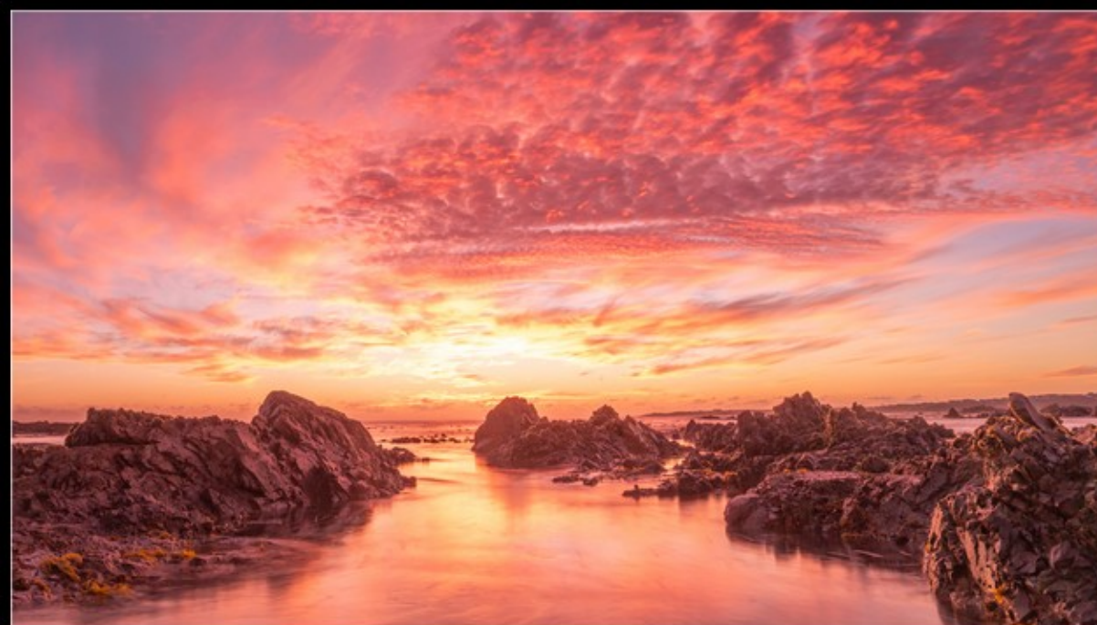
SC-M-Aj De Kerk-35-G-Laaste Warm Sonstrale