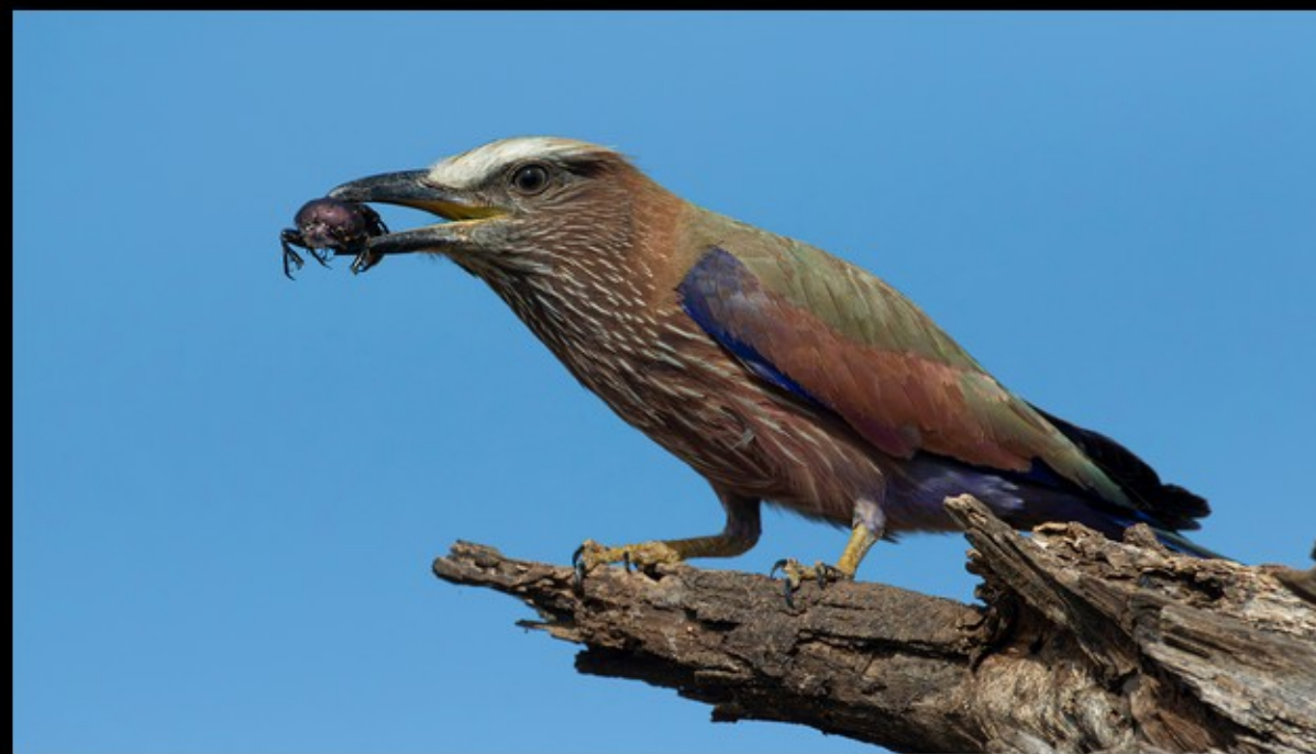
MR-001-Die voedselketting 5-348