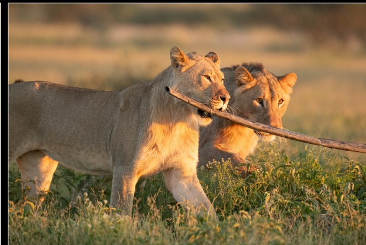
MR-001-Curious lions 2-202