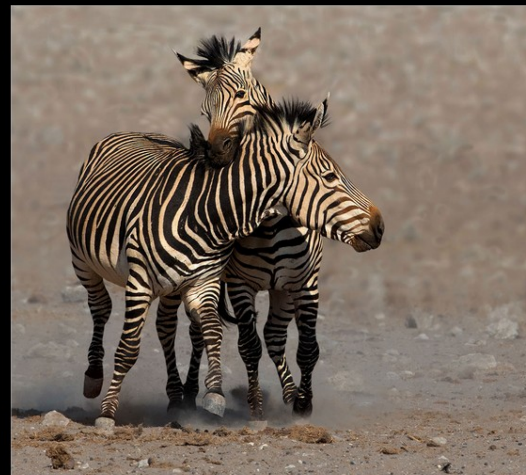
MR-001-03_Hartman zebras at waterhole-734