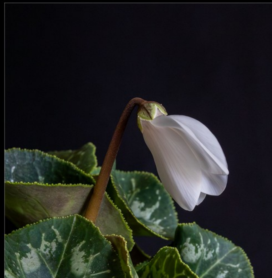
MR-001-Cyclamen Mini 2-17833