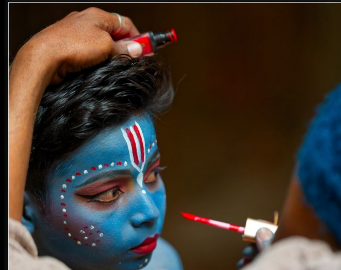
MR-001-Blue face boy-16814