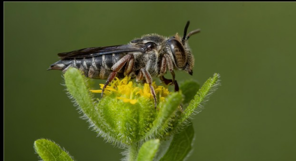
NA-M-Dirk Heyns-40-COM-Winter Son