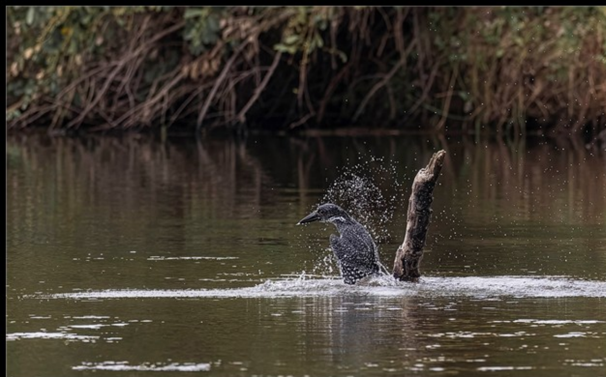
MR-001-3 Amper Take Aways-17046