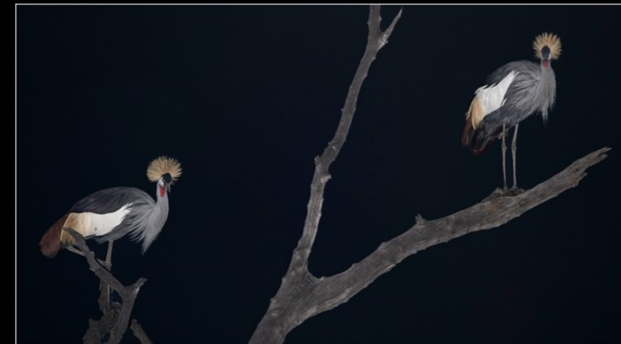
NB-M-Koos Marais-36-G-Grey Crowned Cranes