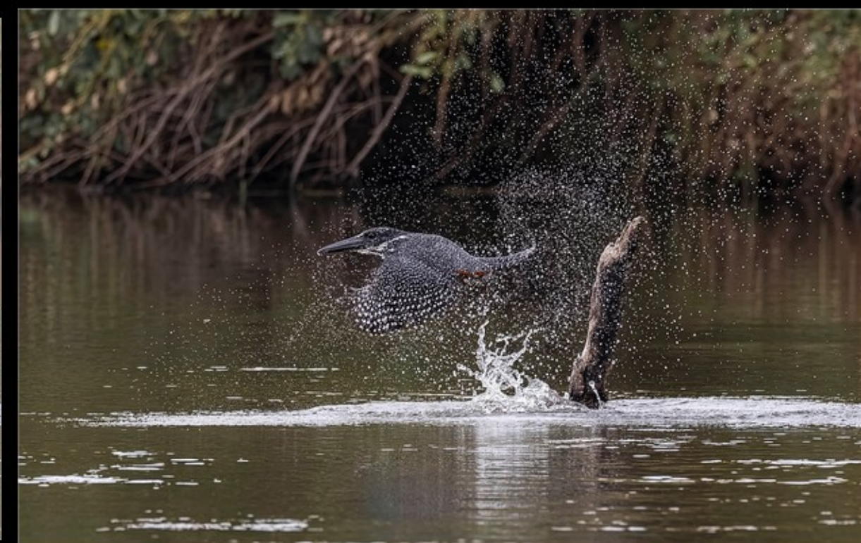
MR-001-4 Amper Take Aways-17046