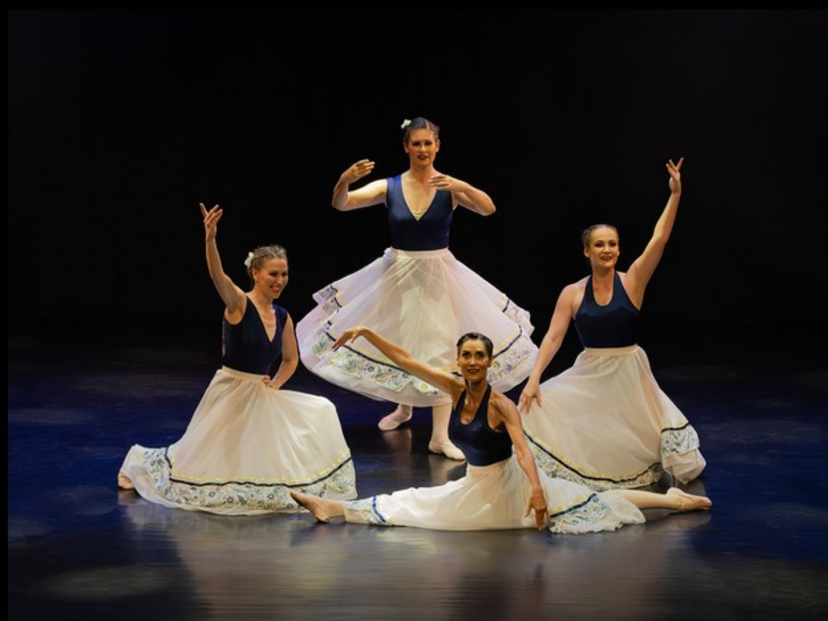
MR-001-Happy dancing team 5-8861