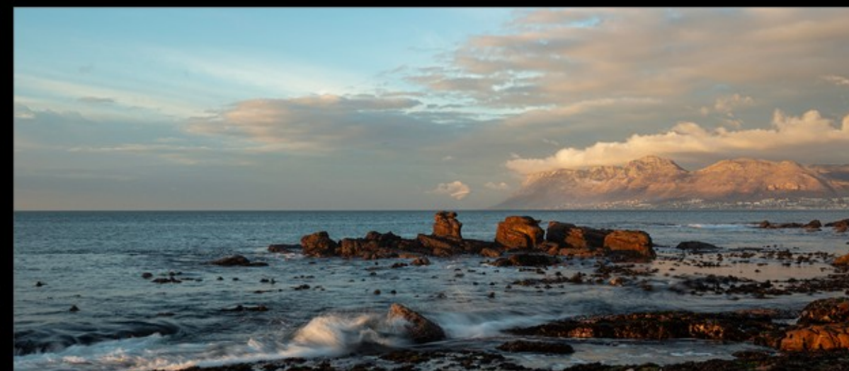
SC-M-Rina Hattingh-35-G-Evening Glow On Atlantic Edge