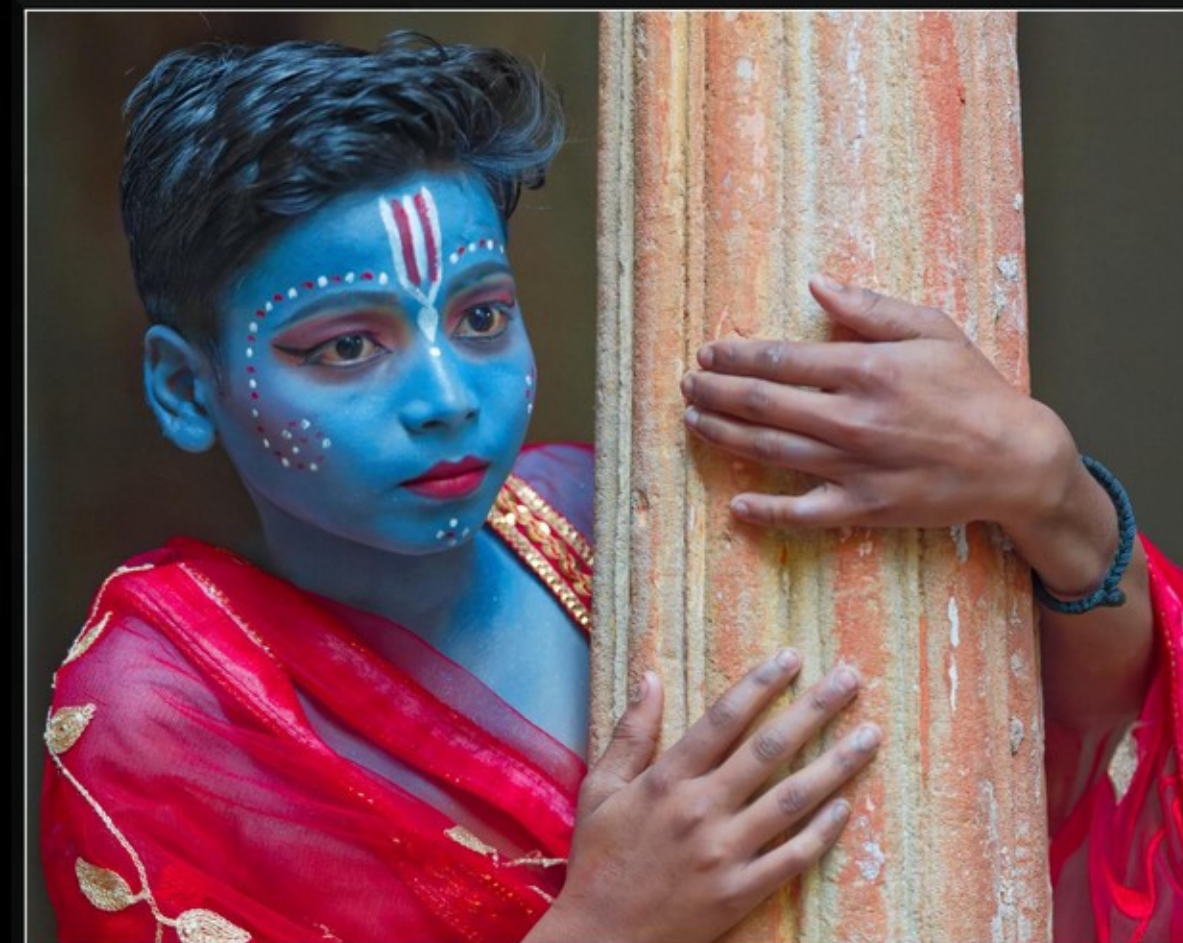
MR-004-Indian boy transformed with blue makeup-16814