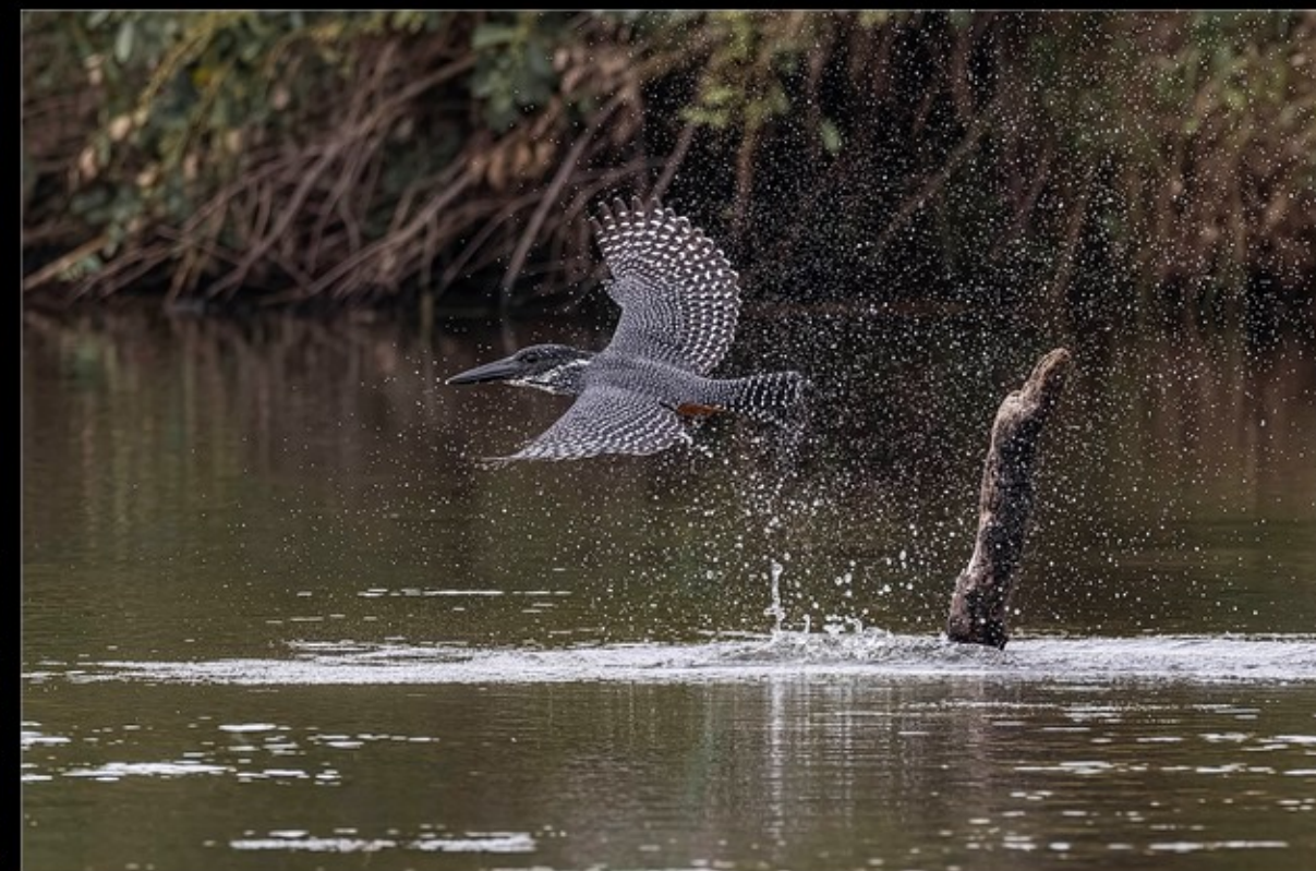
MR-001-5 Amper Take Aways-17046