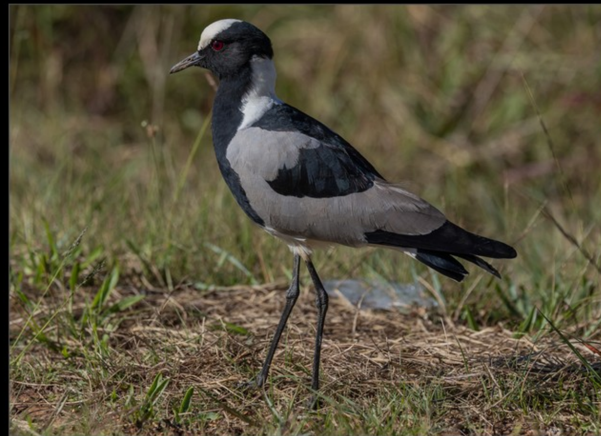
MR-004-Lewe van die Bontkiewiet-2806