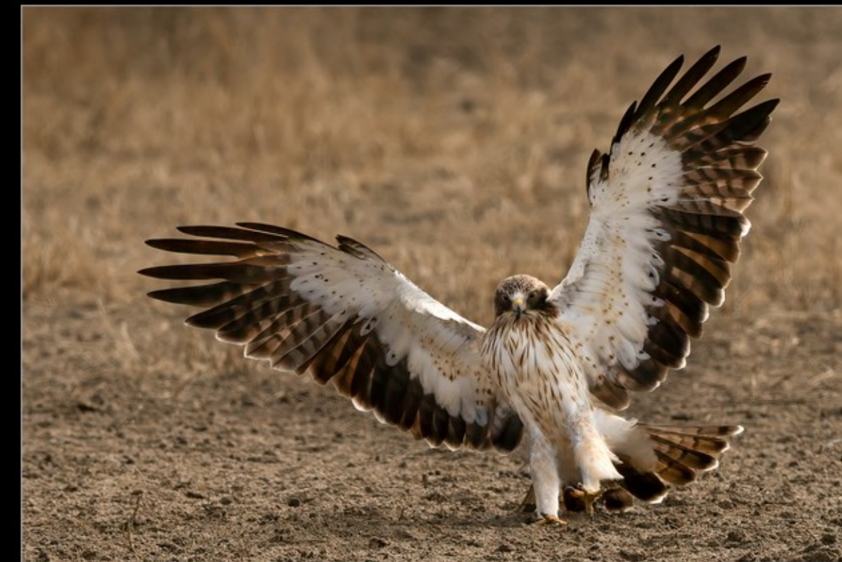
NB-M-Ezabe Bogenhofer-37-G-Hunting Lanner