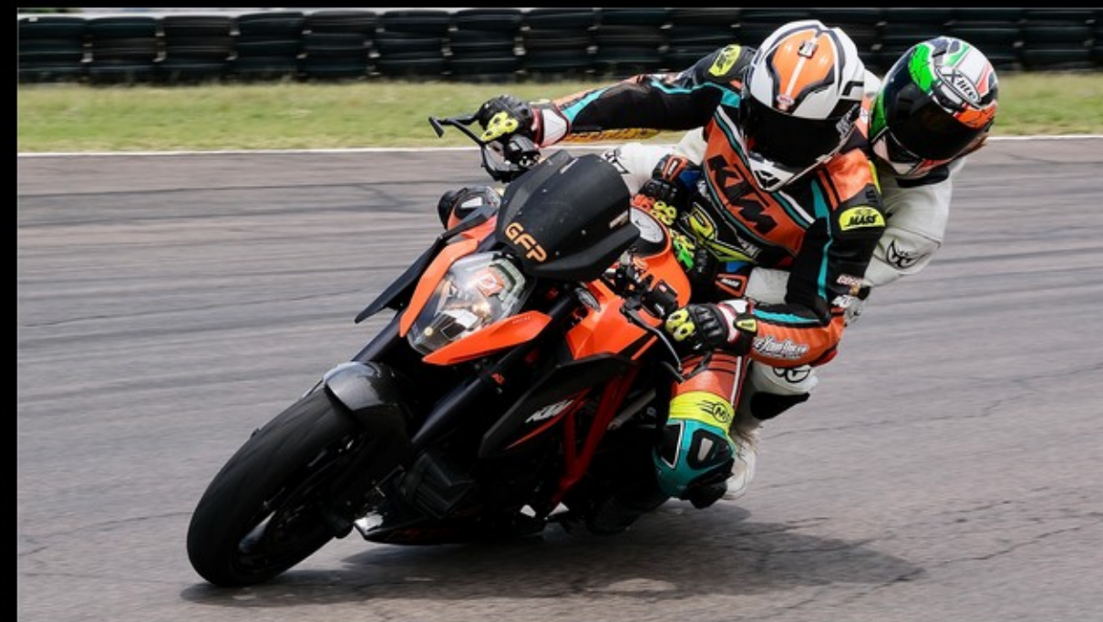
MR-001-Met toestemming ry sy saam 1-10568