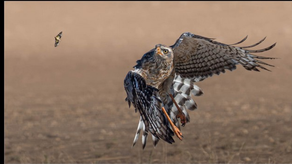
MR-001-The hunts is on 5-537