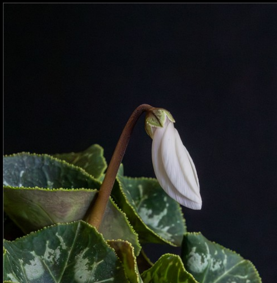
MR-001-Cyclamen Mini 1-17833