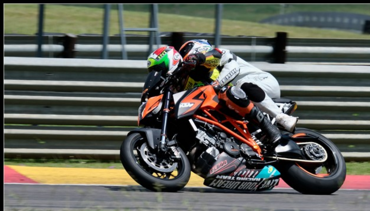
MR-001-Met toestemming ry sy saam 2-10568