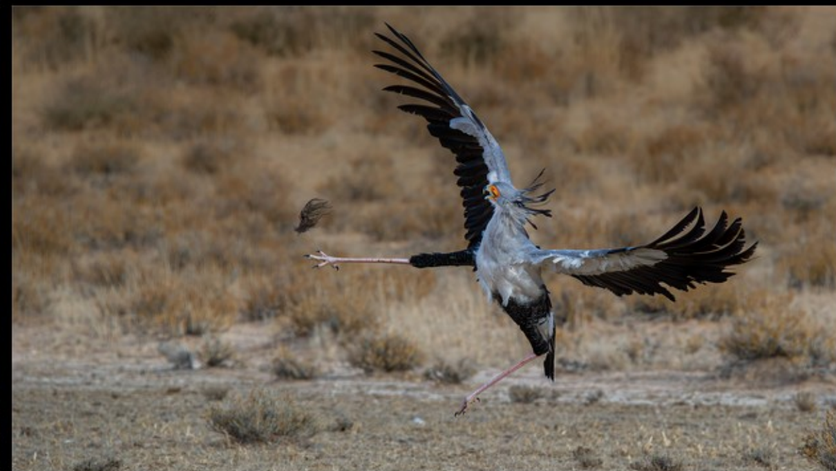
MR-001-Playing With A Feather 2-1097