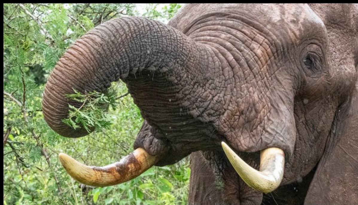
MR-001-Die voedselketting 2-348