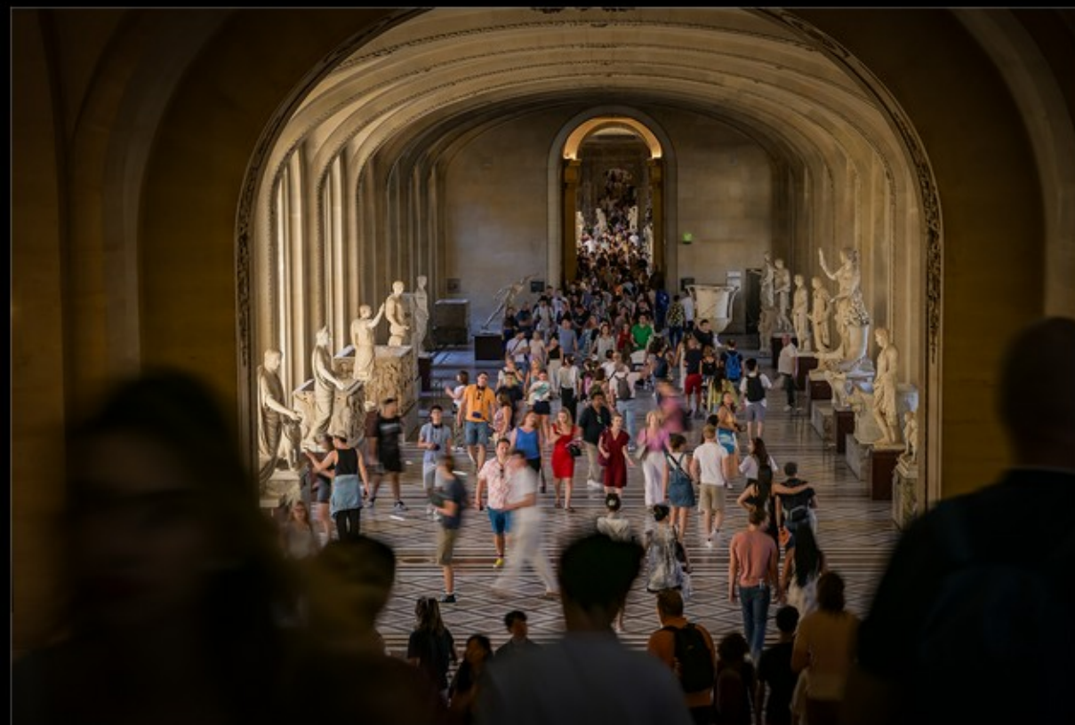
MR-001-The Louvre in a blur 05-7734