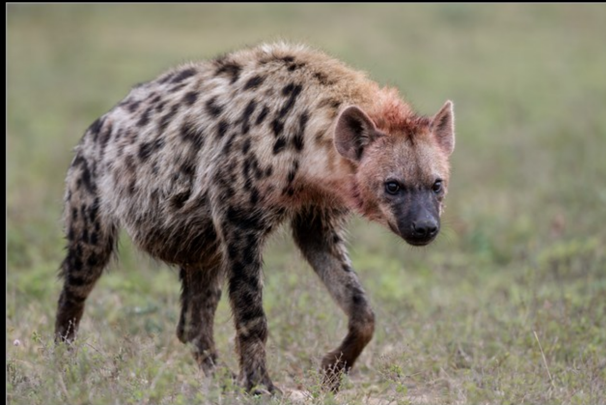
NAM-Ezabe Bogenhofer-36-G-Dik Gevreet