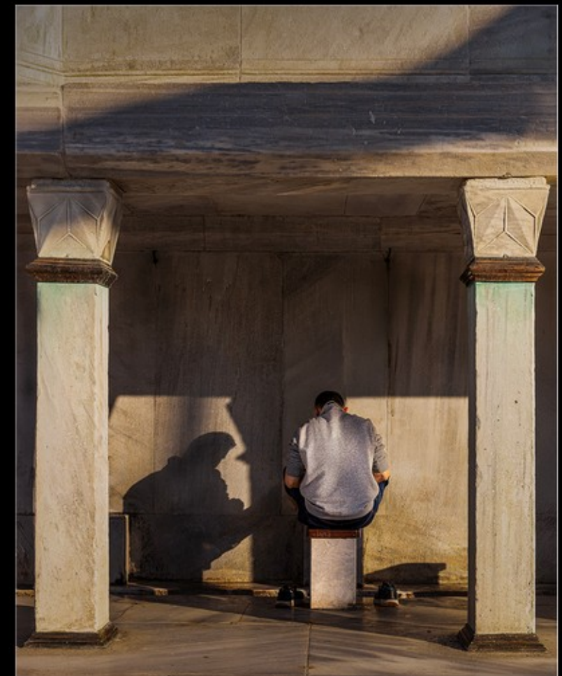
PJ-4 star-Amanda Ellis-39-COM-Voor Sonondergebed