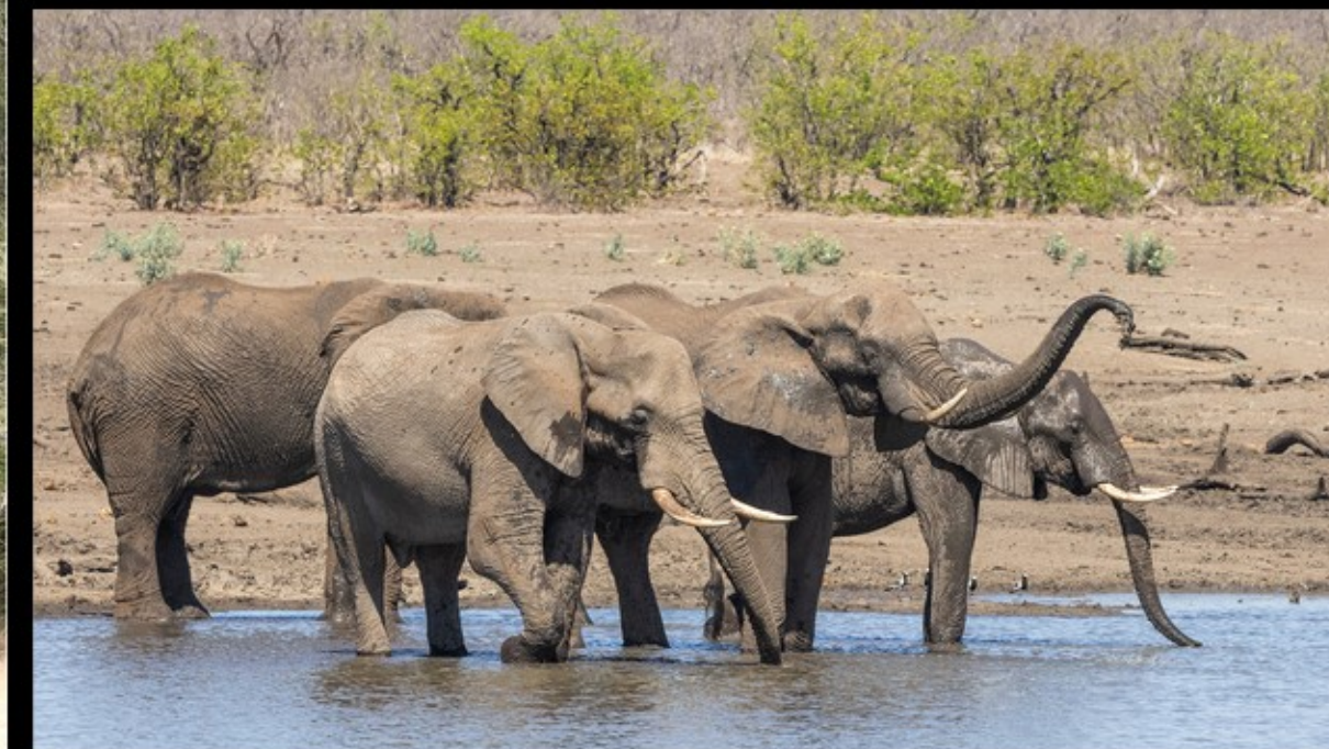
MR-001-Die voedselketting 1-348