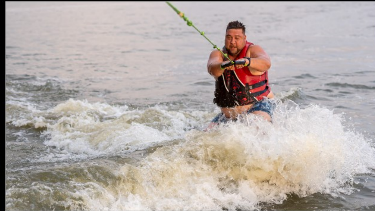
MR-003-Well done Big guy-11218