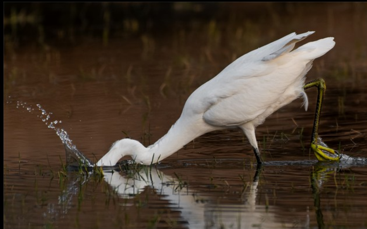
MR-002-Reier hengel in Moremi-14170