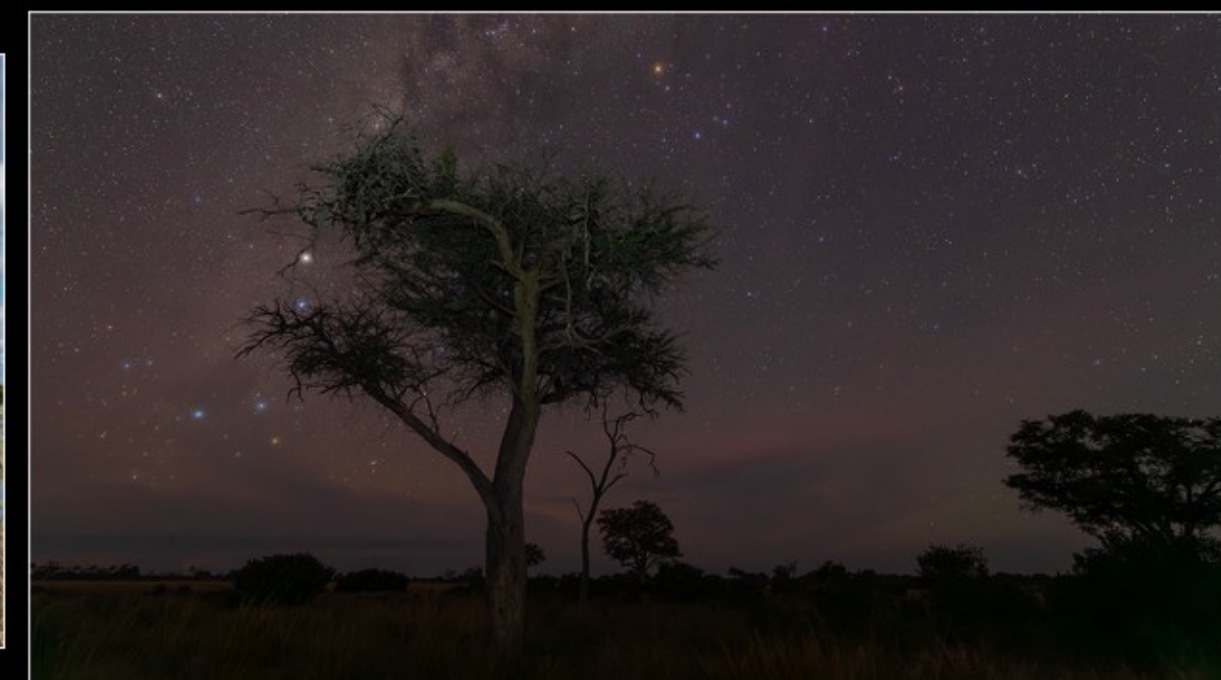
SC-M-Koos Marais-35-G-Kameelboom En Sterre