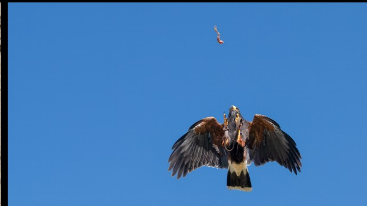
MR-001-Arial manouvers 1-7085