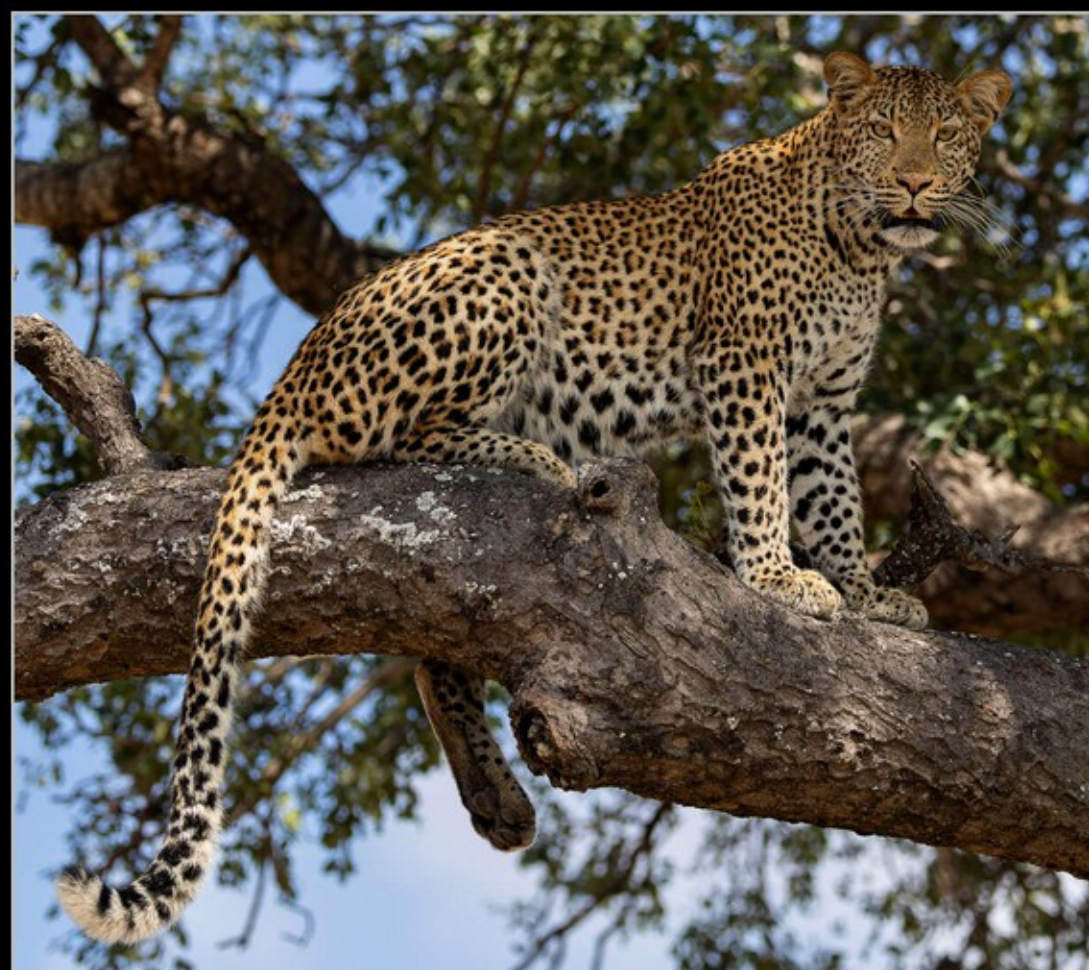
MR-001-Leopard On The Move 2-15194