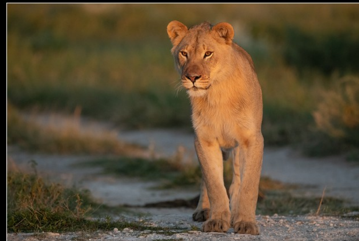
MR-001-Curious lions 1-202