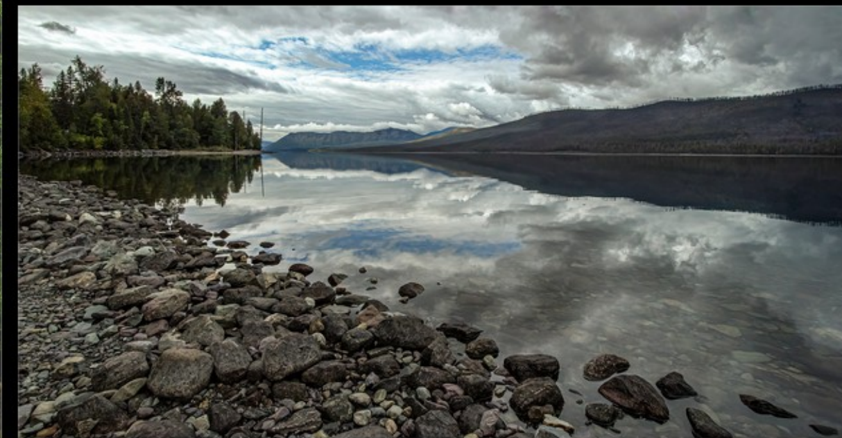
SC-M-Trippie 'Msser-36-G-Reflections On Lake