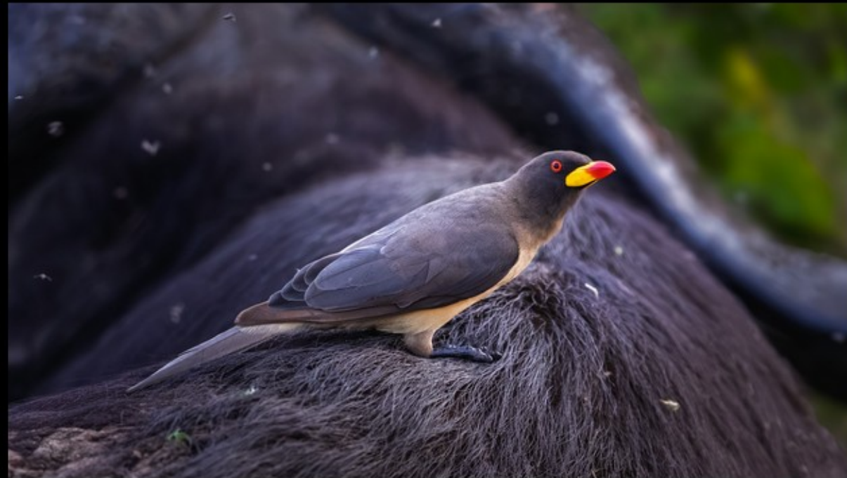
NB-1 star-Jacques Pieterse-36-G-Oxpecker On Buffalo