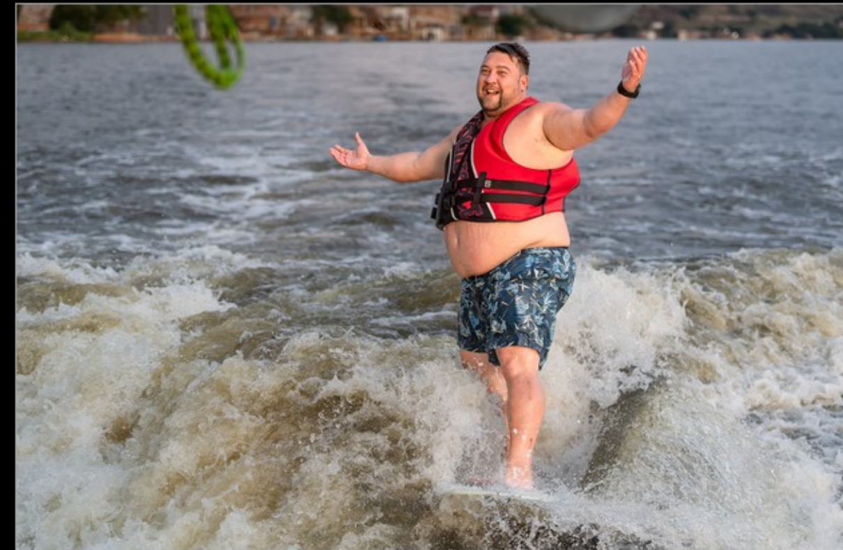
MR-004-Well done Big guy-11218