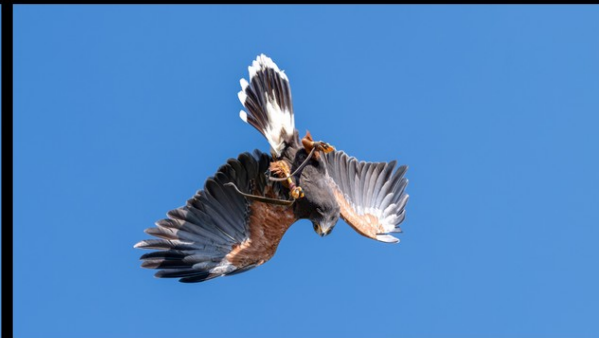
MR-001-Arial manouvers 4-7085