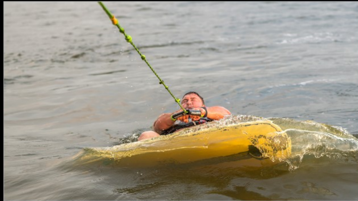
MR-002-Well done Big guy-11218