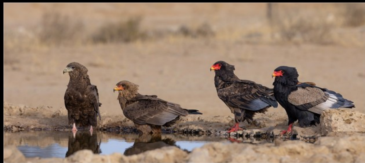
NB-M-Chris Erasmus-41-COM; Ctg WIn-Generations At Waterhole