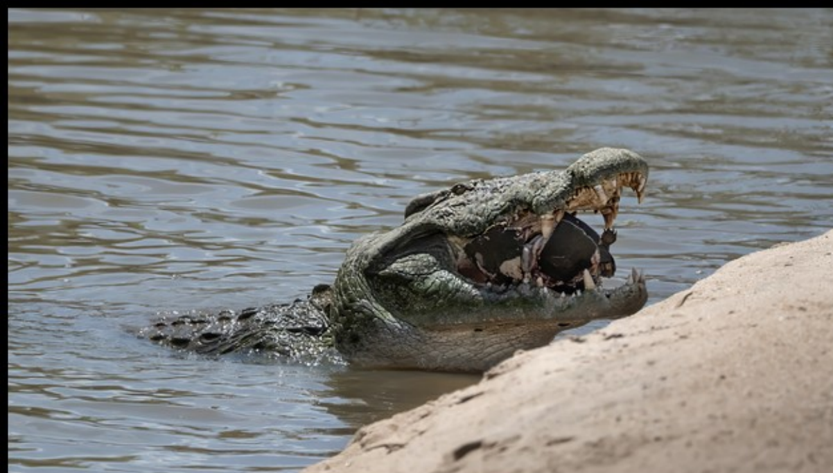
MR-001-1 Nile crocodile caught a terrapin-1918