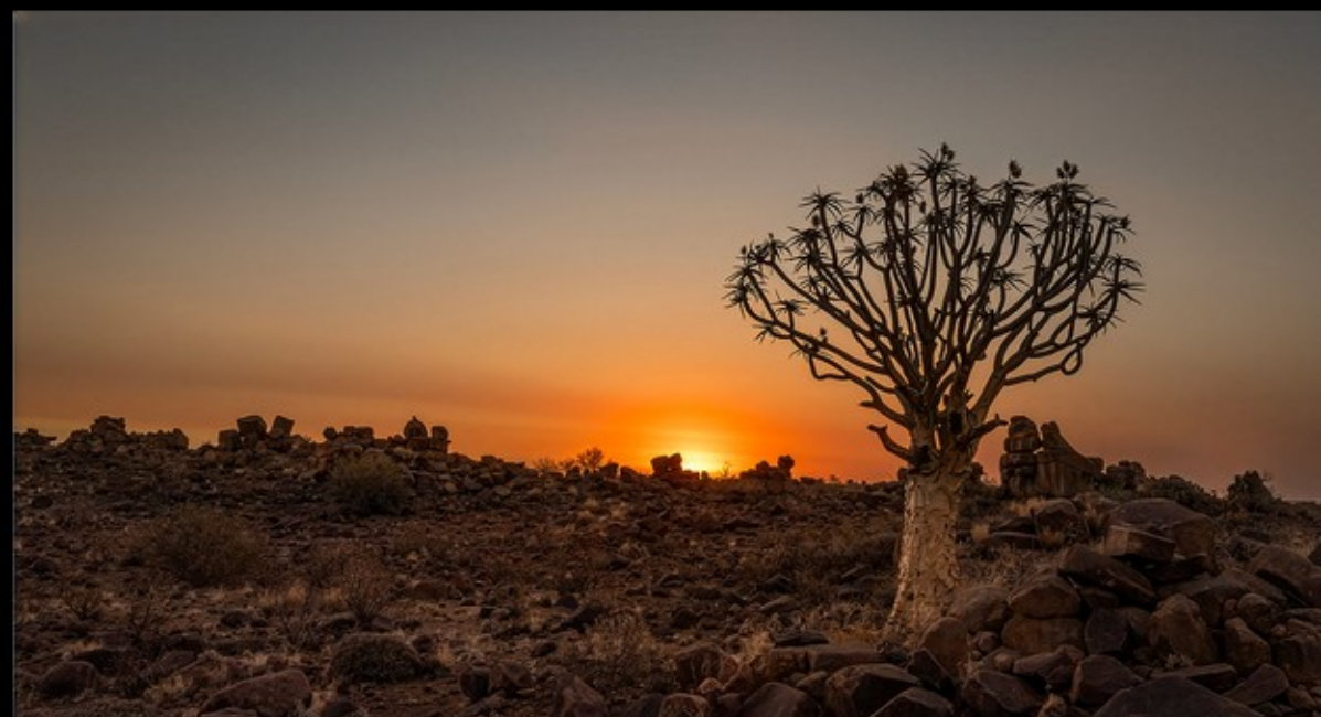
SC-M-Rina Hattingh-39-COM-Last Glow