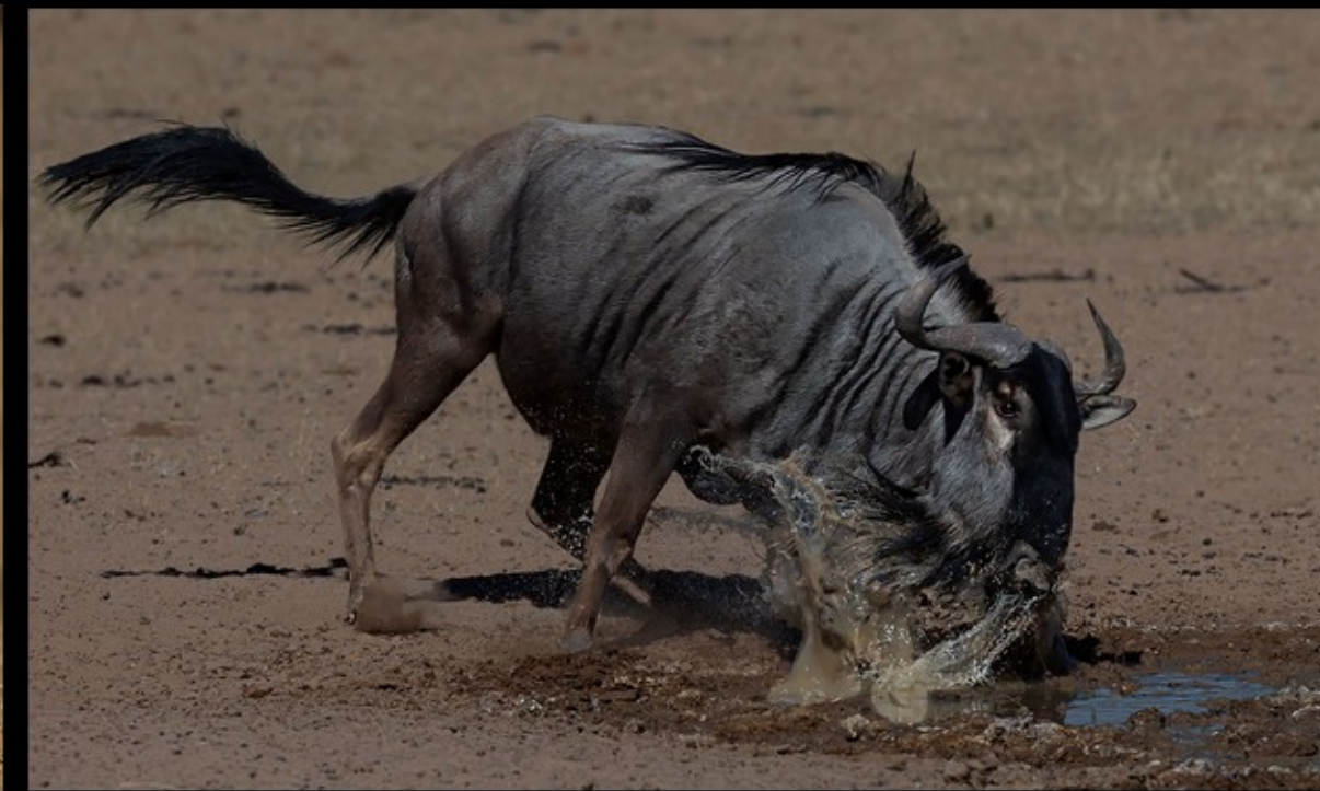
NA-M-Andre Ligthelm-37-G-Catch A Fright