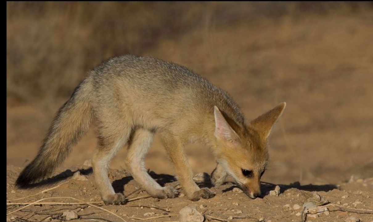
NA-M-Andre Ligthelm-36-G-Unfamiliar Smell