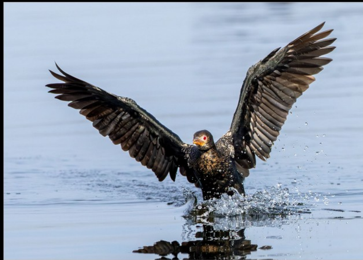
NB-3 star-Johann Cloete-34-G-Reed Cormorant Touch Down