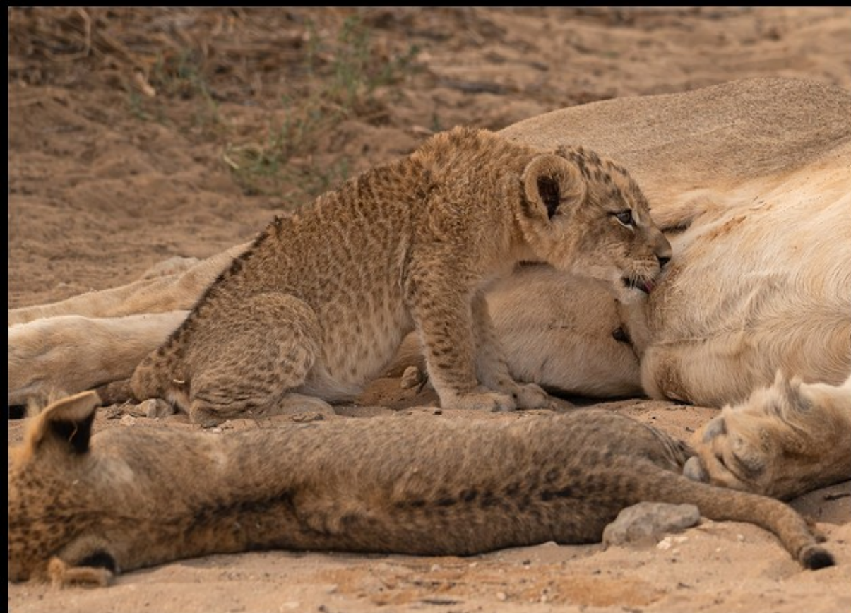
MR-004-\ån lus tot lip aflek lekker-7635