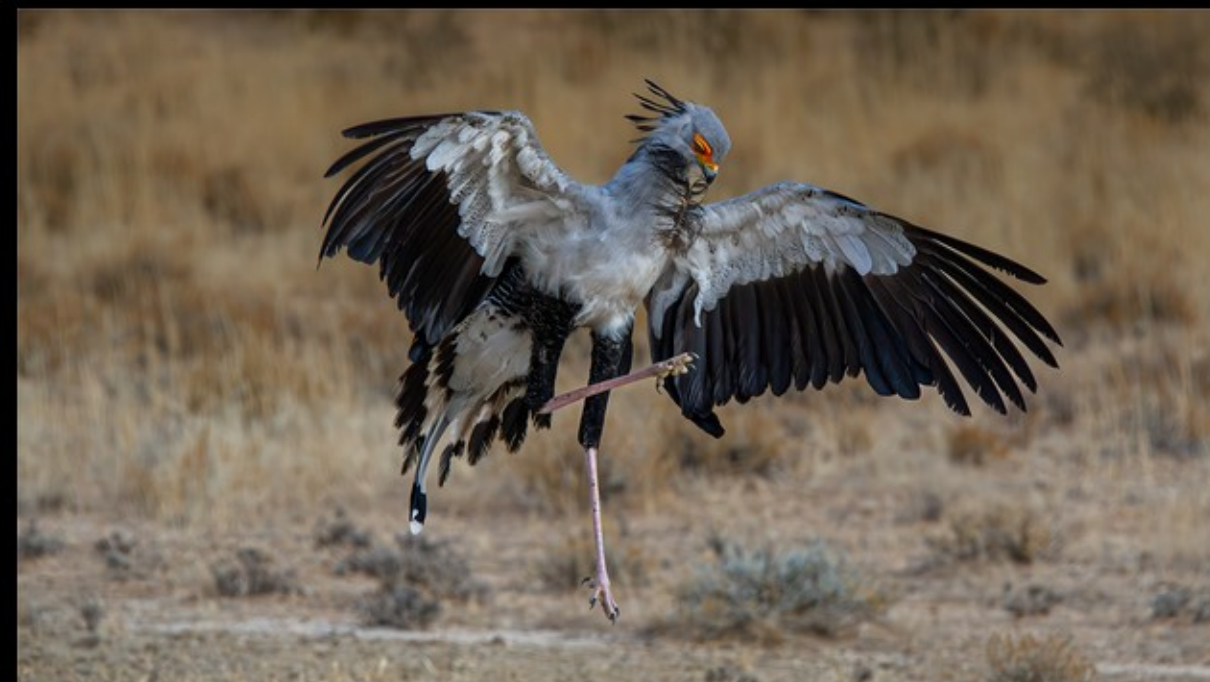
MR-001-Playing With A Feather 5-1097