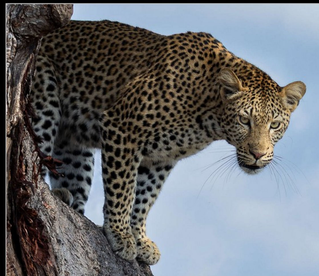
MR-001-Leopard on the Move 3-15194