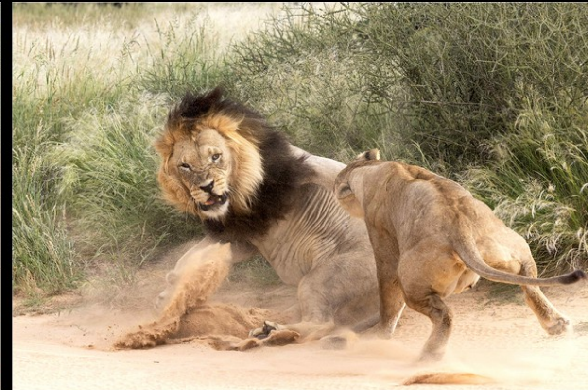
MR-001-Denied with force_series 2-18