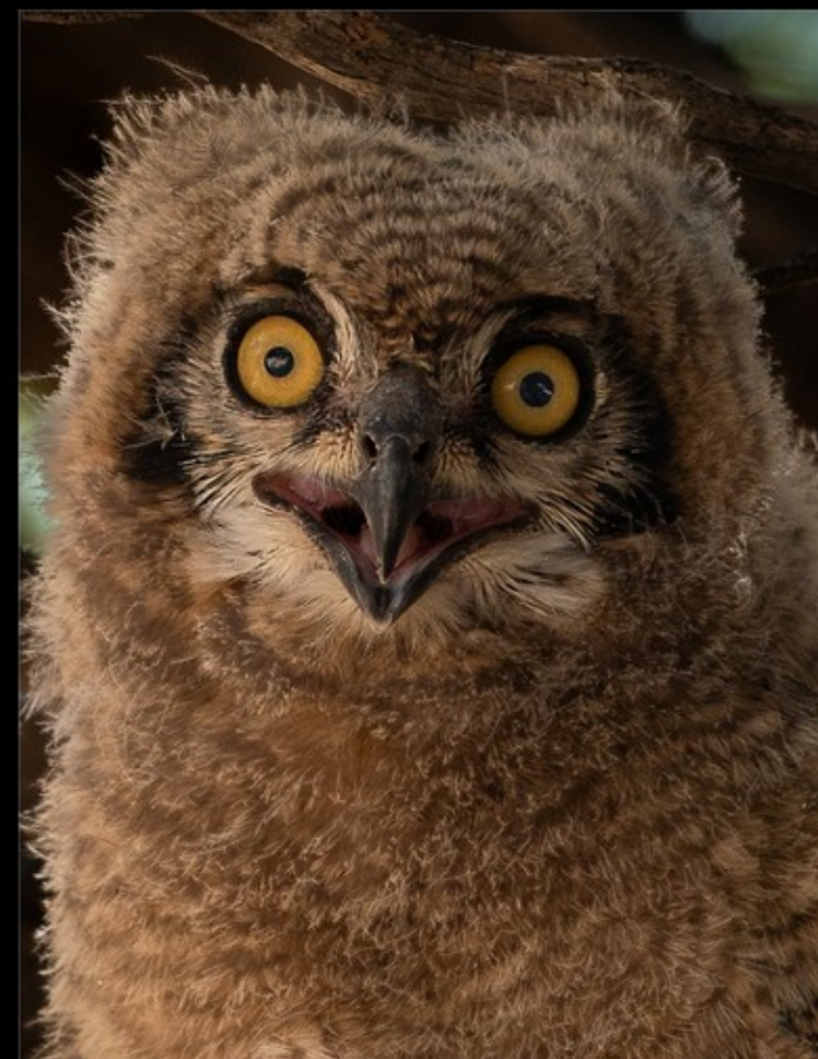
NB-M-Ona Ackermann-36-G-Grootoog Uilskuiken