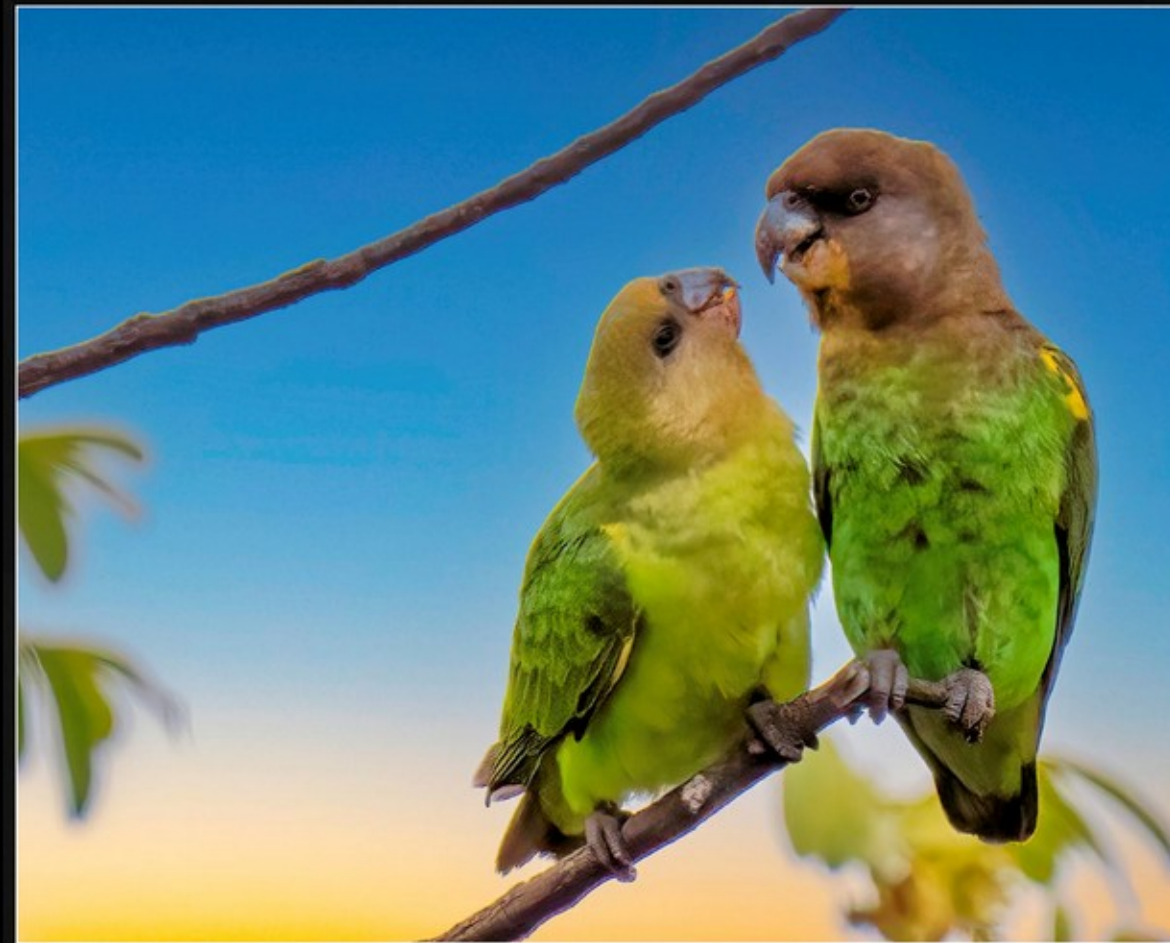
NB-1 star-Judy De Bont-33-G-Love Birds