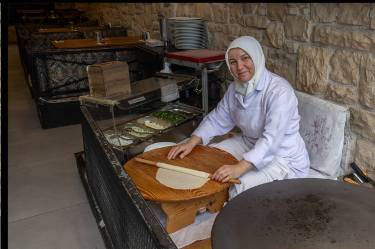
MR-001-Roling out the Gozmele-2792