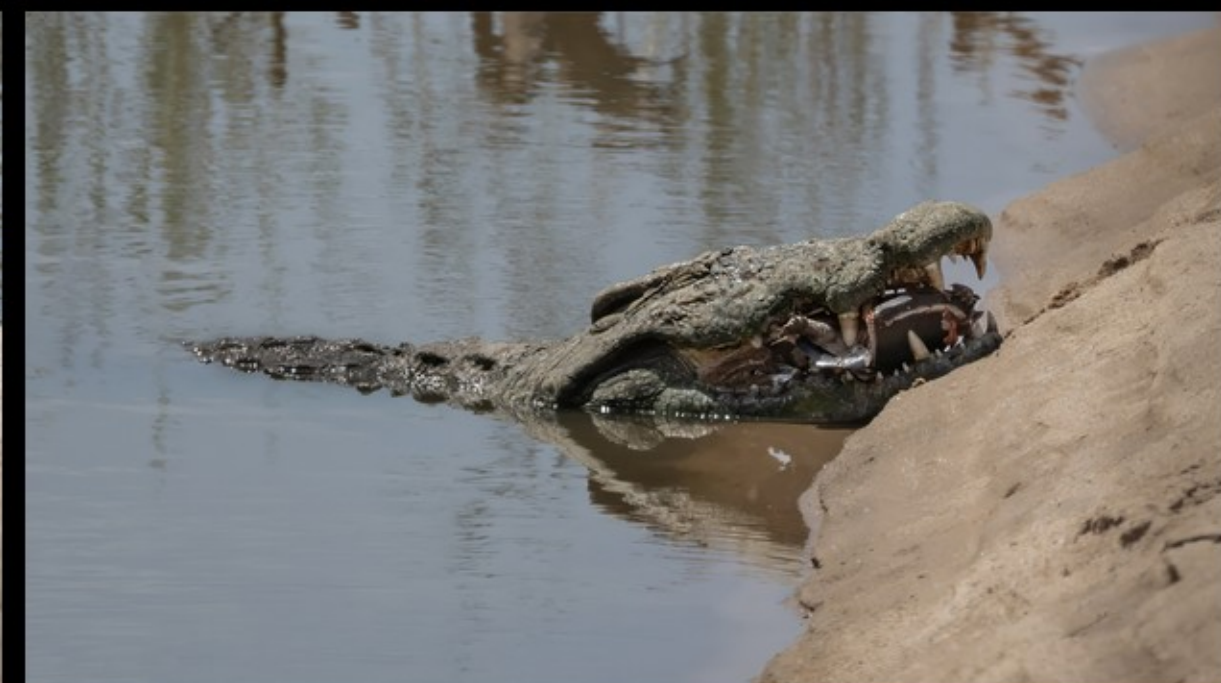
MR-001-2 Nile crocodile caught a terrapin-1918