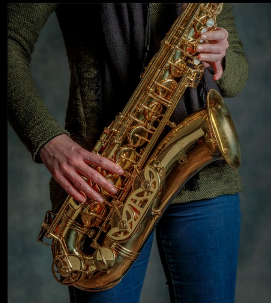
MR-001-Playing the saxophone-16528