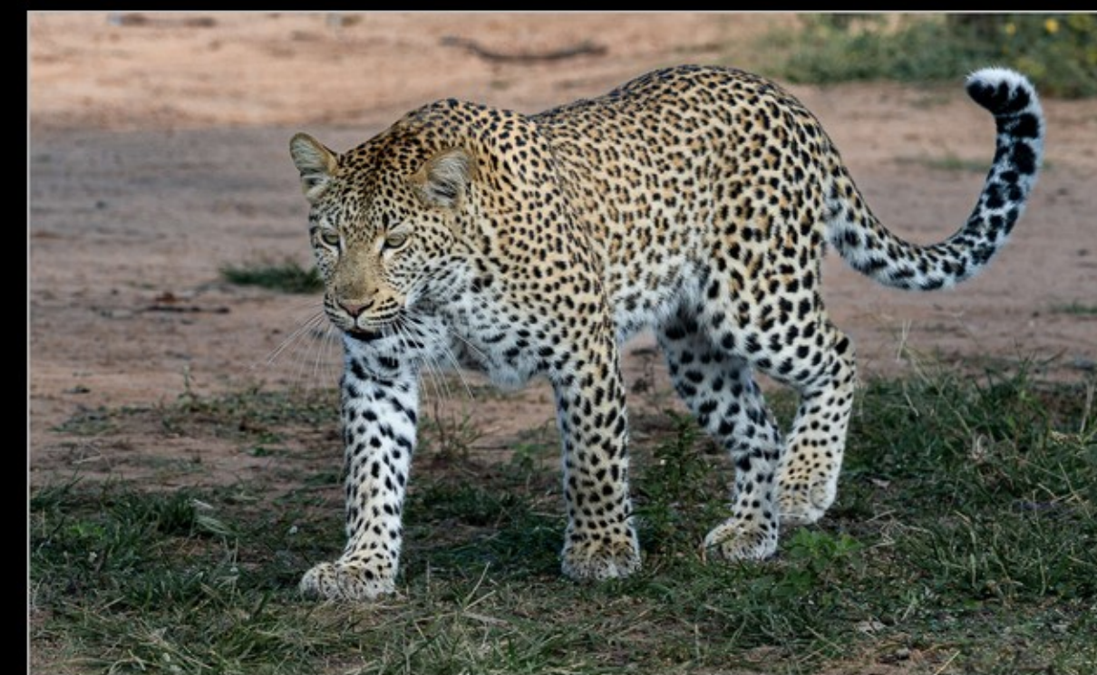
MR-001-Leopard On The Move 4-15194