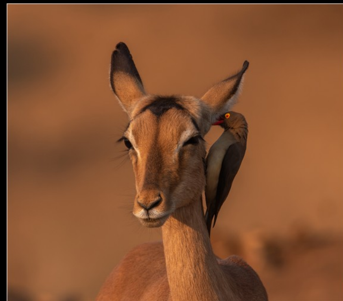
MR-001-Tick cure 2-9029