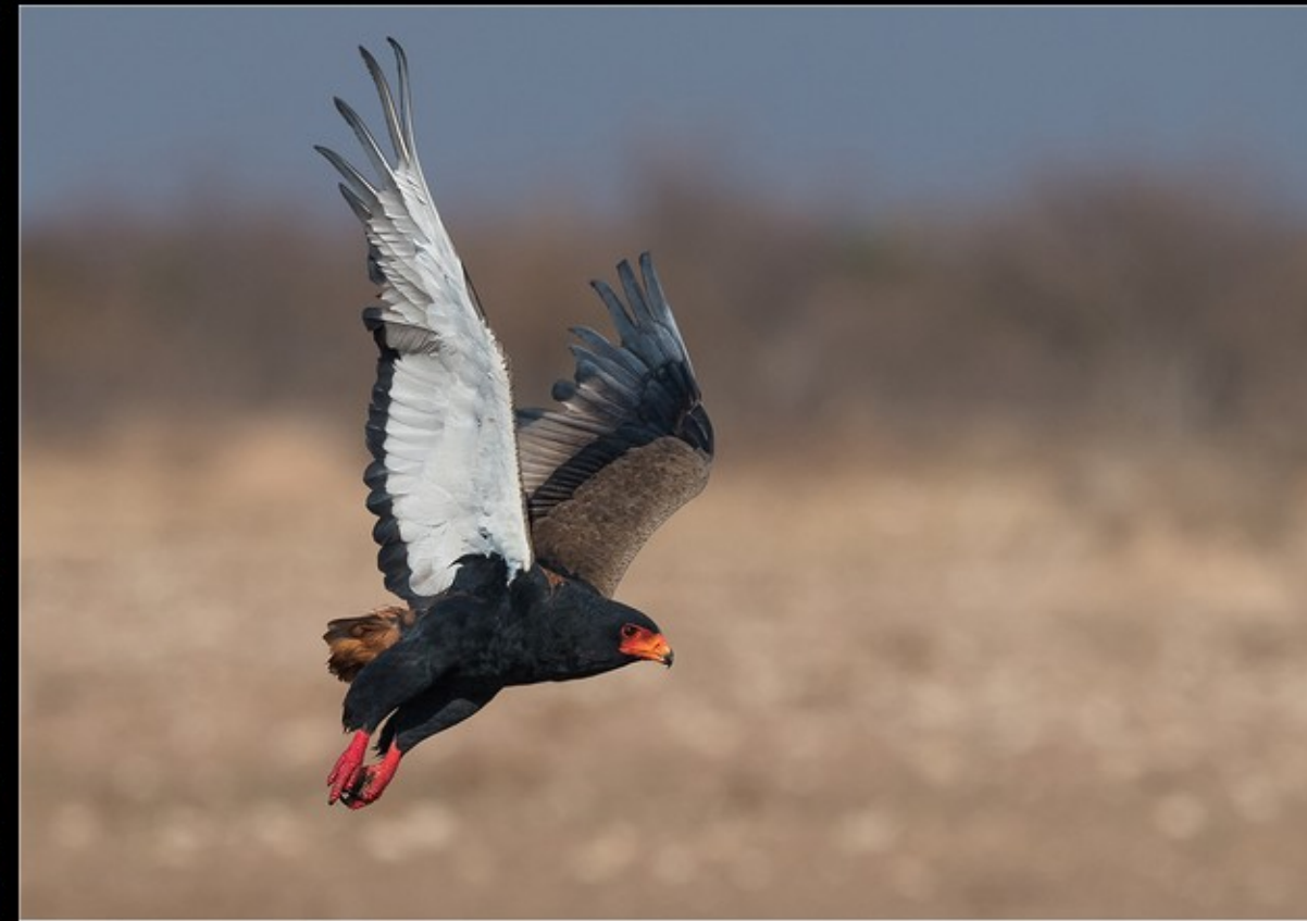
NB-M-Chris Erasmus-39-COM-Wings Of Freedom