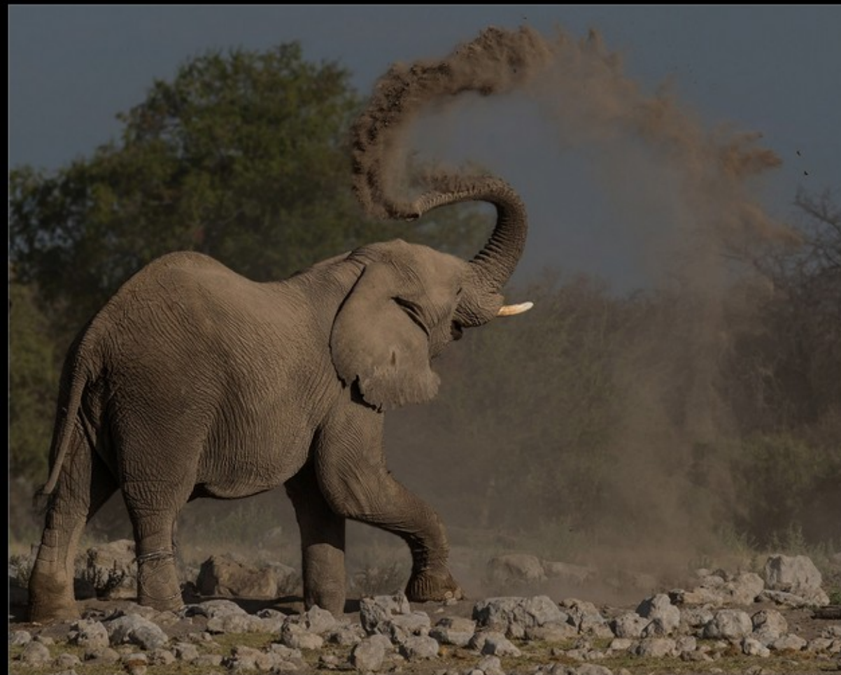
NA-M-Annette Ligthelm-37-G-Snare Escape