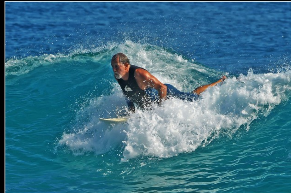
MR-001-Ou surfer 2-629