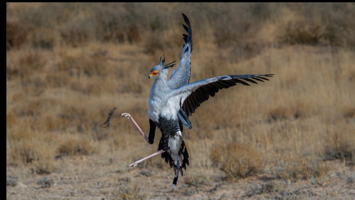
MR-001-Playing With A Feather 3-1097