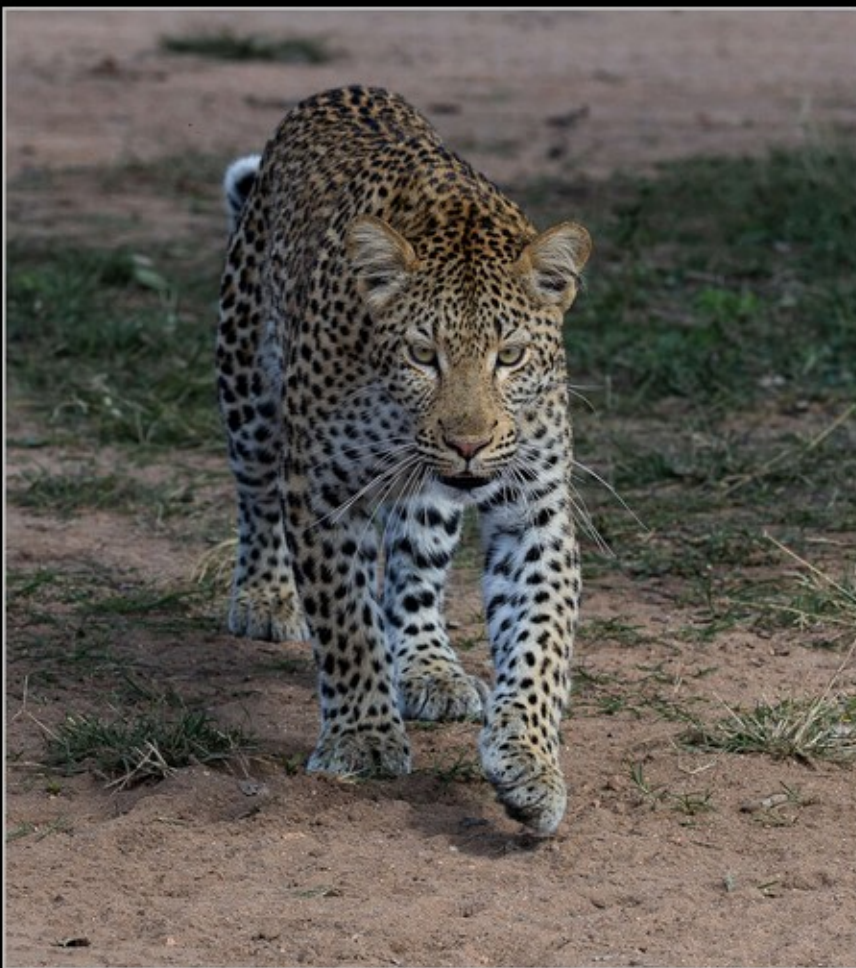
MR-001-Leopard On The Move 5-15194