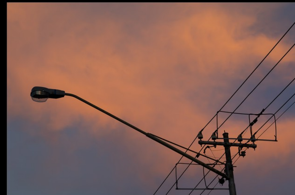
PO-2 star-Bianca Lubbe-33-G-Sunset Clouds