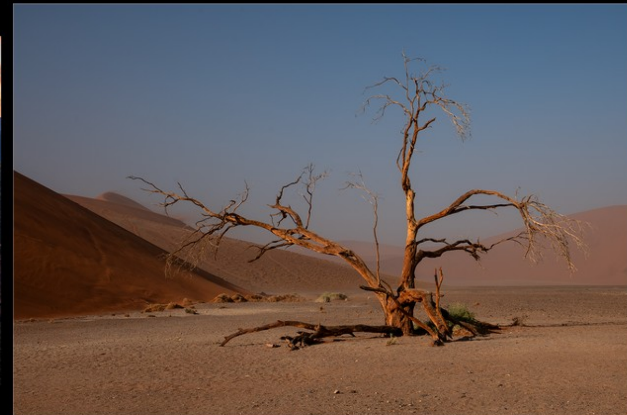
SC-2 star-Helena Oosthuizen-35-G-Sossusvlei