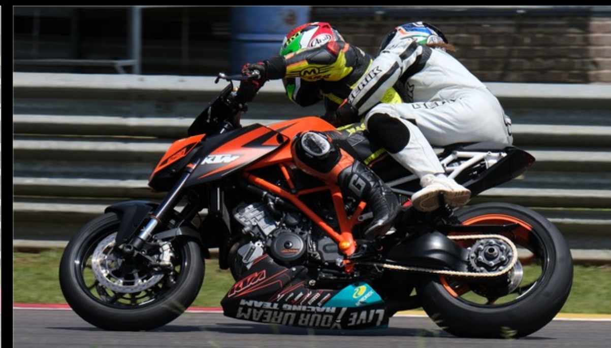
MR-001-Met toestemming ry sy saam 3-10568