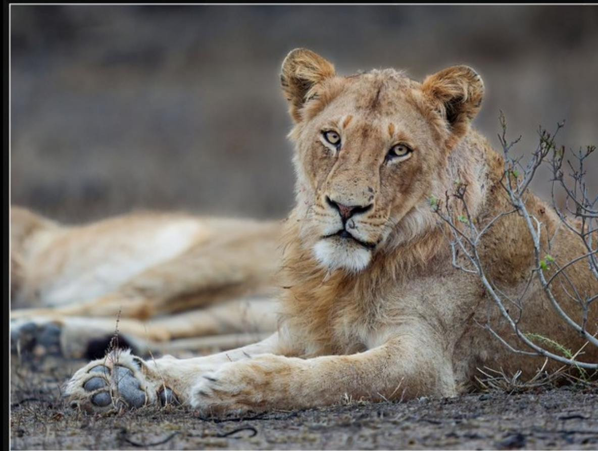
NA-1 star-Judy De Bont-36-G-Young Male Lion